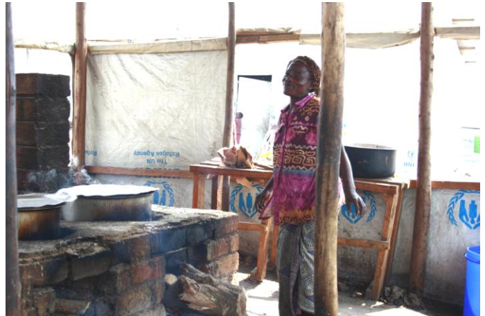
Preparation of hot meals in Lusenda's common areas.