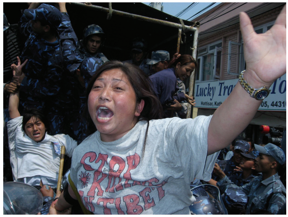
Tibetan protesters being arrested by Nepali police near the Chinese Embassy Visa Section on March 31, 2008.

Human Rights Watch has directly observed many of the Tibetan demonstrations in Kathmandu and the police response to them. From March 10 to 28, Nepali police consistently responded to the demonstrations with unnecessary or excessive force, using lathi s to beat protesters in the head and body, and by kicking and punching them. Police officers have sexually assaulted Tibetan women during arrest. Many women and girls have reported male police officers groping them and kicking or hitting them with a lathi in the groin.