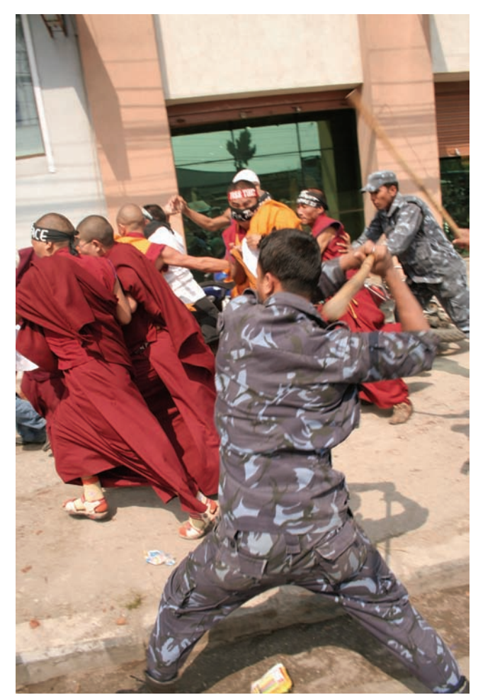
Tibetan monks chased by Nepali police near the UN complex on March 24, 2008.

In our observations of police use of force in response to demonstrations by Tibetans after March 10, we found that Nepali police used unnecessary force against peaceful demonstrators and excessive force against demonstrators resisting arrest. Every one of the more than 90 Tibetan demonstrators interviewed by Human Rights Watch had either been beaten during a protest or had observed friends being beaten.