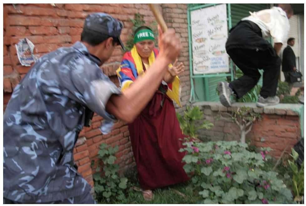
A Tibetan nun cornered and beaten by a Nepali police officer near the UN complex on April 21, 2008.

The authorities typically detained those arrested for several hours before releasing them in the evening without charge. On two occasions Tibetans were detained overnight: 99 people were held in four locations on April 16, and 68 were held at Ghan II Police Barracks on April 2.