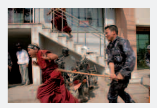
A Nepali police officer wields lathi against a Tibetan protester on March 24, 2008 near the UN complex.

Appeasing China urges the government of Nepal to respect the fundamental rights of Tibetans to engage in peaceful assembly and expression, and to end the arbitrary arrest, harassment, and mistreatment of those exercising these rights. It calls on the Chinese government to end all public and private pressure on the Nepali government to violate Tibetans' rights.