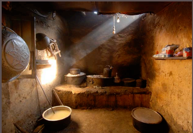
A kitchen used to prepare all the food for both the men's and women's sides of the prison at Parwan, north of Kabul. Giant cauldrons are used to cook the staple of rice. Prison meals are basic, but some women and girls whom Human Rights Watch interviewed are from such poor backgrounds that they were grateful for their regular prison meals.