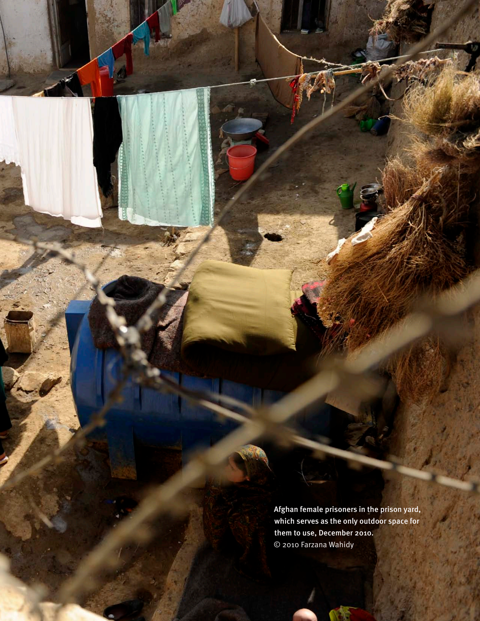
Afghan female prisoners in the prison yard, which serves as the only outdoor space for them to use, December 2010.