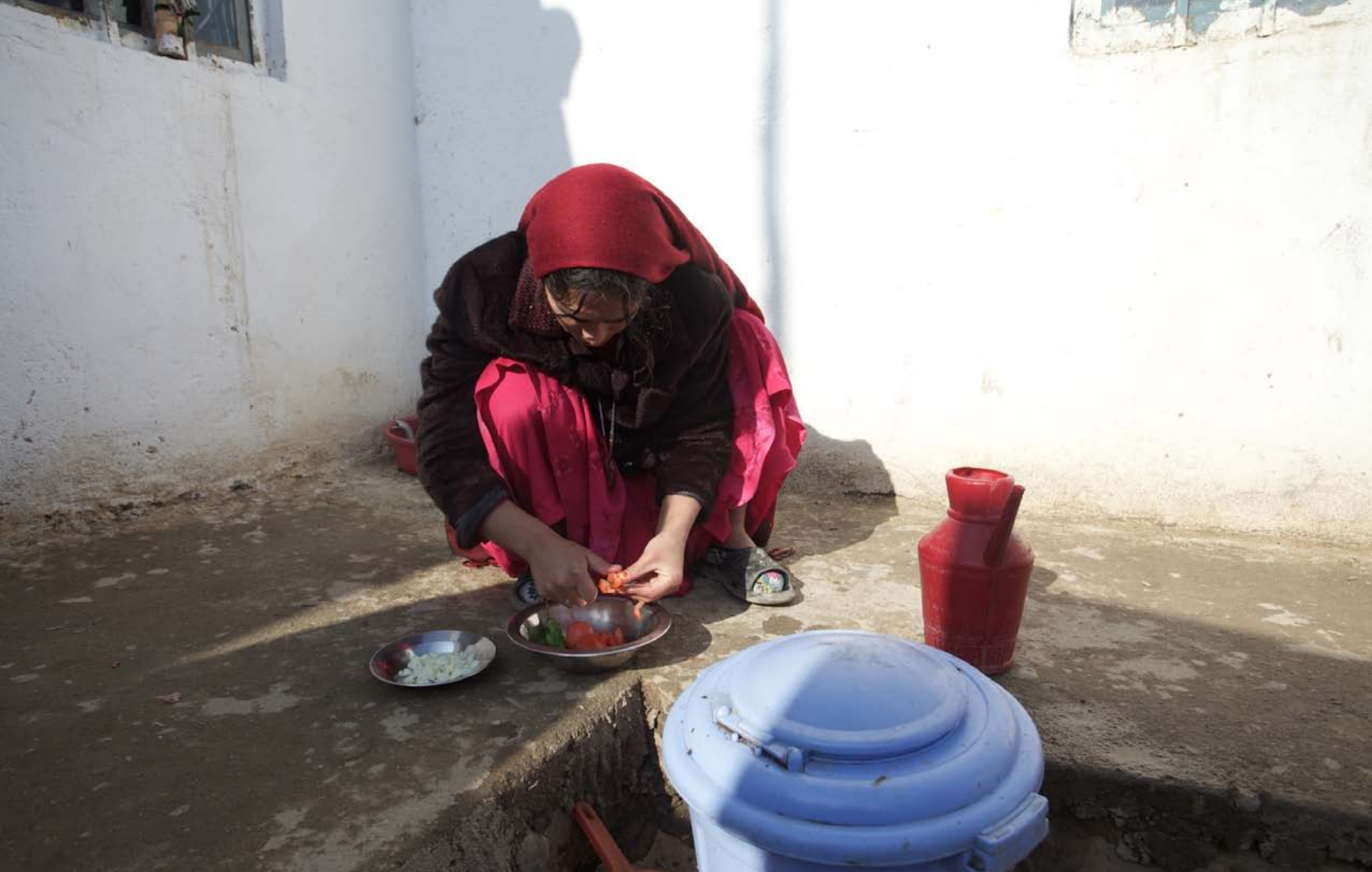
A prisoner, serving a five-year sentence for zina (sex outside marriage), prepares lunch for the other inmates at a women's prison. While it is easy for a man to divorce his wife in Afghanistan, it is much more difficult for a woman to do so. A woman unable to divorce her husband is more vulnerable to charges of zina .