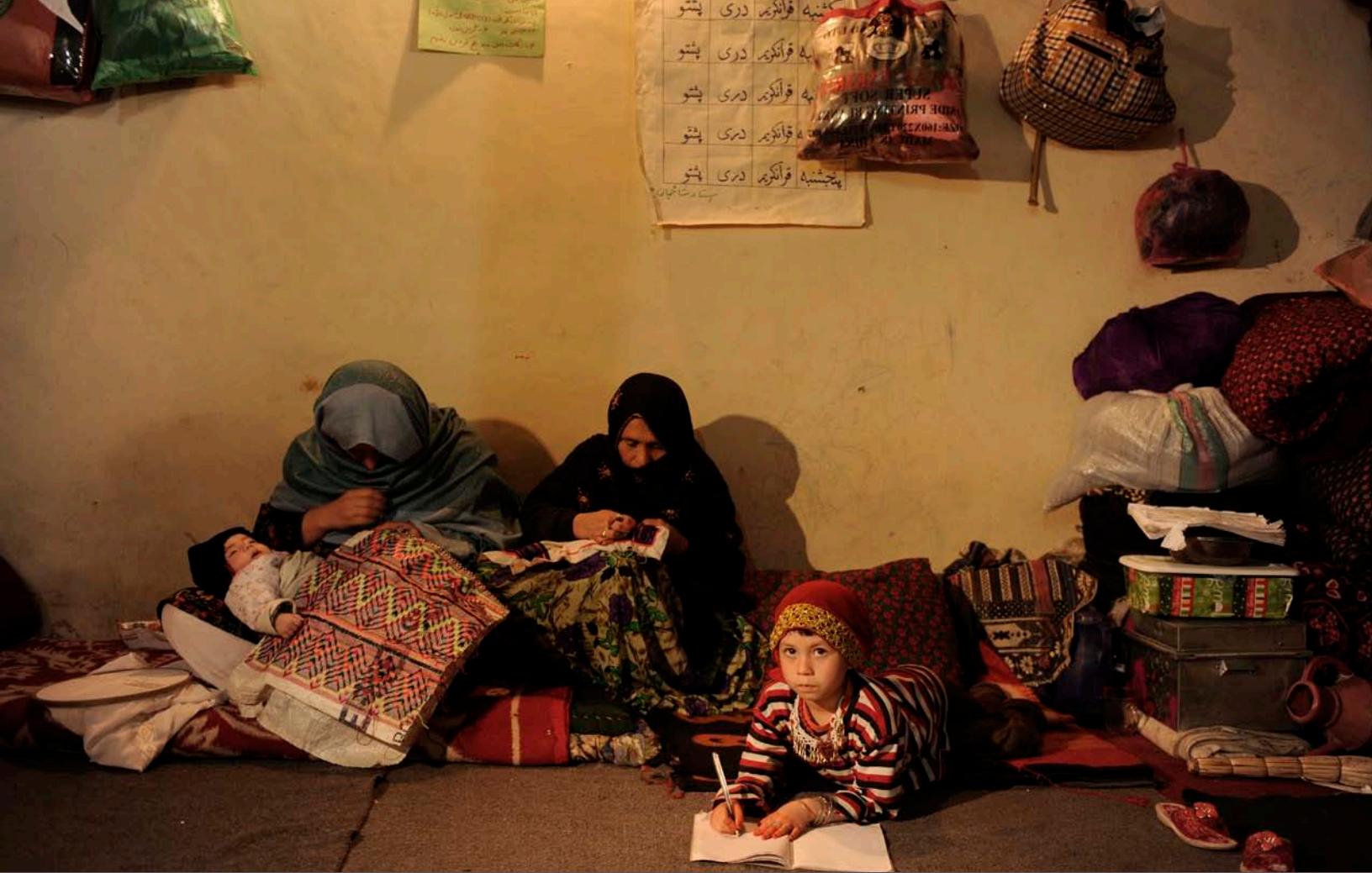
A child studies while two women prisoners sew, March 2010. Several hundred children in Afghanistan live in prisons and juvenile detention facilities. Serious efforts in some facilities to provide education for children and vocational programs for prisoners have not taken root system-wide. Some women and girls interviewed said that they were attending school for the first time through classes in the prison or juvenile rehabilitation center.