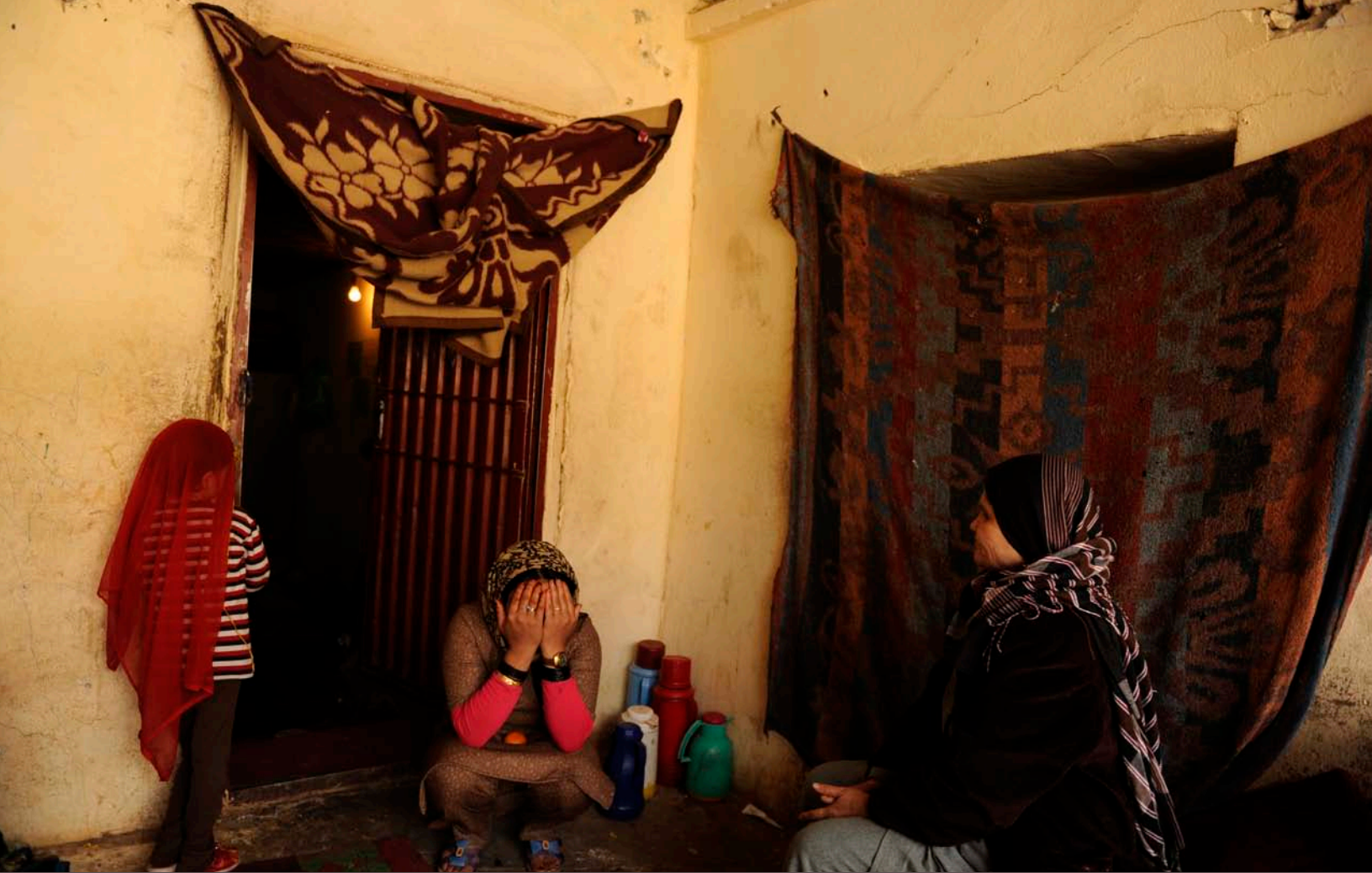
A prisoner covers her face while sitting outside a room that she shares with 15 other women prisoners in March 2010. Women in Afghanistan face serious barriers to obtaining custody of their children in the event of a divorce. Several women told Human Rights Watch that when they left prison they would have to choose between returning to an abusive husband with custody of their children or never seeing their children again. Most planned to return to their husbands.