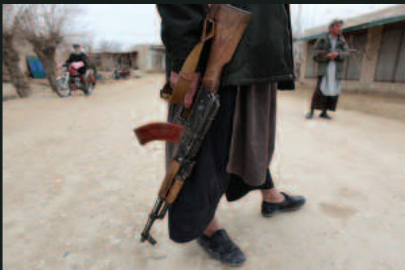
Militiamen in Kunduz province, Afghanistan.

The new administration of President Ashraf Ghani and Chief Executive Abdullah Abdullah should investigate all allegations of abuse by security forces and ensure the prosecution of those implicated in such violations. The US and other foreign donors to Afghanistan’s security forces should link continued funding to benchmarks in accountability, including prosecutions for serious crimes.