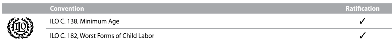
Table 3. Ratification of International Conventions on Child Labor

Morocco has ratified all key international conventions concerning child labor (Table 3).