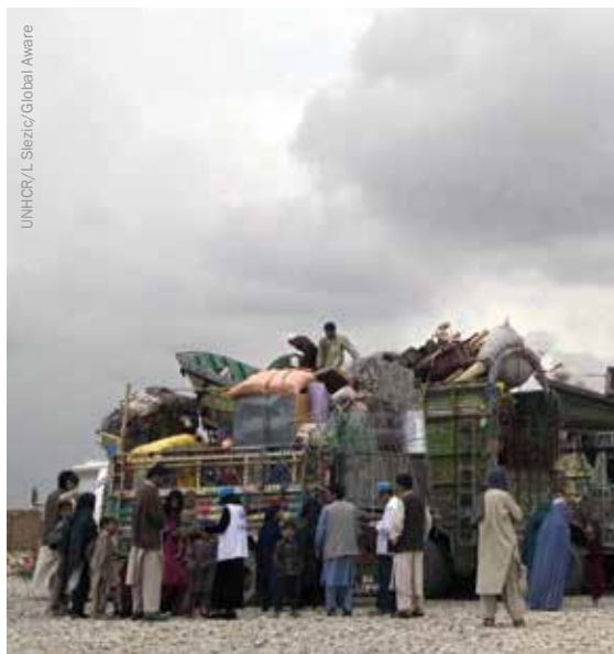
Afghan refugees returning to Afghanistan in 2004.

Further analysis shows that the reasons for the initial migration have an impact