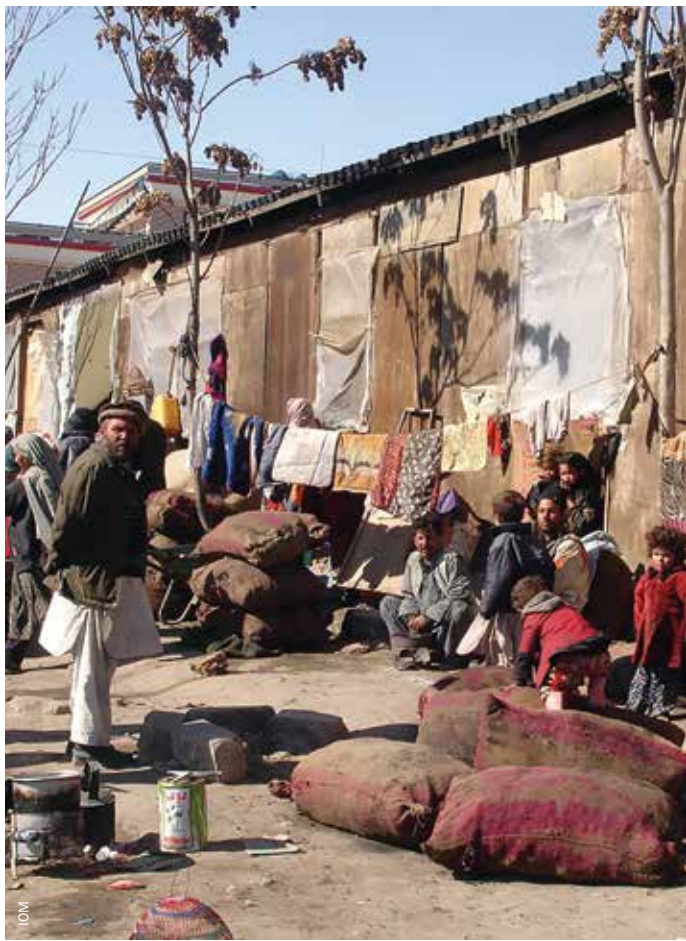
IDP camp in Kabul.