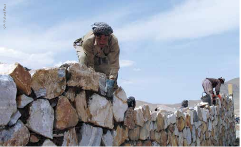
Construction work begins on a new hospital in Ghazni, Afghanistan.

capacity and building investor confidence. The same is true for displacement; while 2014 may bring further displacement, this is no reason not to deal with the dimensions of the crisis that already exist.