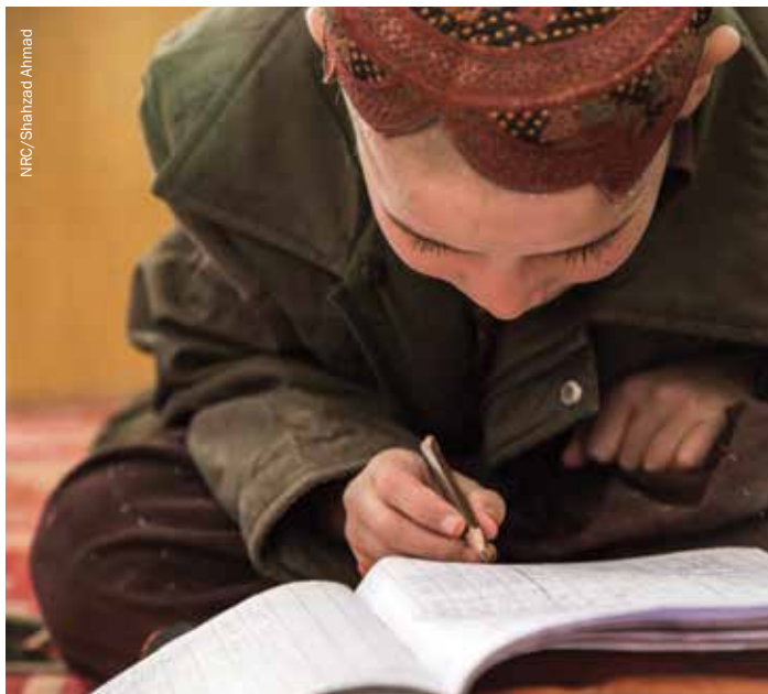
Afghan refugee child in a writing lesson at an Accelerated Learning Programme Centre, Quetta, Pakistan.

The voluntary nature of repatriation remains at the heart of Pakistan's new National Refugee Policy, reflecting a sense of realism among policymakers and an awareness that Afghanistan's poor law and order situation and shortage of livelihood opportunities remain two very significant hurdles to repatriation and sustainable reintegration inside Afghanistan. For Afghans to repatriate and reintegrate on a sustainable basis, the development of a conducive environment inside Afghanistan is imperative. The proposed development of 48 reintegration sites for returnees should therefore be given top priority by Afghanistan and the international community but so far very little progress on these has been made. Pakistan's new national policy stresses the importance of effective information-