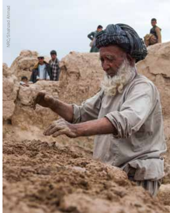
A returnee refugee re-builds his damaged house after years away. Maymana, Afghanistan.

Under the Tokyo Mutual Accountability Framework, donors promised US$16 billion in development assistance for Afghanistan from 2012 to 2016. 4 But the realisation of these aid pledges is conditional on Afghan progress in the context of a number of still unattained development benchmarks. This, coupled with shrinking aid budgets in the western world, means that Afghanistan faces significant decline in external assistance – in a context where by 2013 foreign aid represented 70%