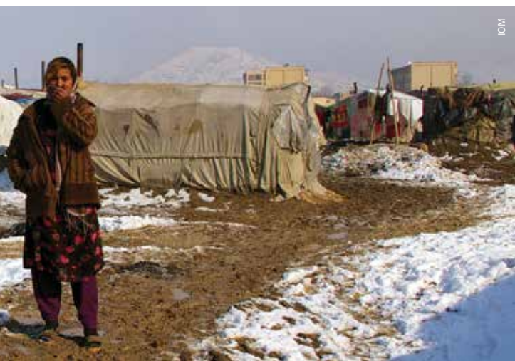
Winter in Kabul.

The IDP Policy Working Group, set up to assist MoRR in the consultation and drafting process, was a small group composed largely of international humanitarian agencies. Attempts to engage the Afghan Human Rights Commission, ACBAR (Agency Coordinating Body for Afghan Relief) or national Afghan NGOs were largely unsuccessful. There was input from a limited number of groups that were specifically approached, notably those