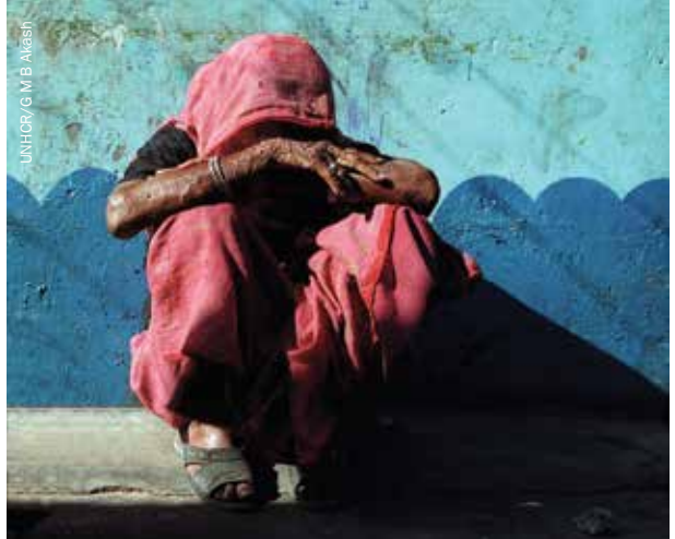
After confirmation of their citizenship, Biharis in Bangladesh can now have hope of leading a normal life after decades of exclusion.

Where there is civil society interest and mobilisation, this does not always include efforts to involve stateless people themselves, leaving them feeling disenfranchised. An example of this is where civil society focuses purely on the subject as a women's rights issue, whereas the women involved are predominantly concerned about the lives of their children, both male and female. Lack of participation by the affected population can also stem from fear of being identified and subjected to some form of official harassment.