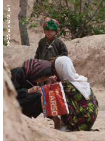
Returnee refugee girls doing homework. Maymana, Faryab Province, Afghanistan.