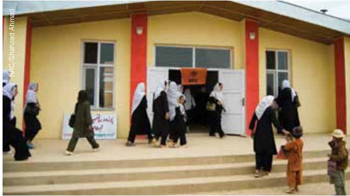
Returnee, IDP and local girls attending classes in a school built by the Norwegian Refugee Council in Maymana, Faryab Province, Afghanistan.

To date, an over-reliance on humanitarian interventions has characterised the response to the Afghan refugee situation and has compromised efforts to secure lasting and sustainable solutions. Increasing international interest in the situation of protracted Afghan refugees and the challenges surrounding return therefore remains of key importance and requires a renewed level of focus. Such approaches should be anchored in bottom-up programming principles and seek to distance themselves from any overt promotion of specific durable solutions. Instead, regional programming and advocacy in relation to