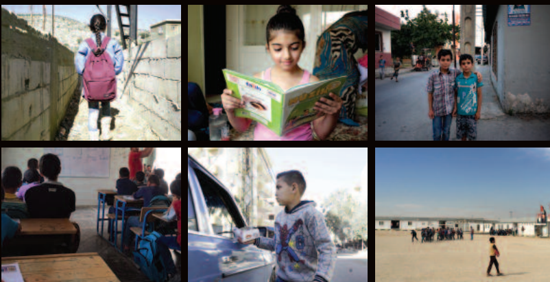
Syrian children and schools in Turkey, Lebanon, and Jordan.

The report identifies shortcomings in donors’ transparency, and demonstrates why addressing these concerns is needed to realize refugee children’s right to an education.