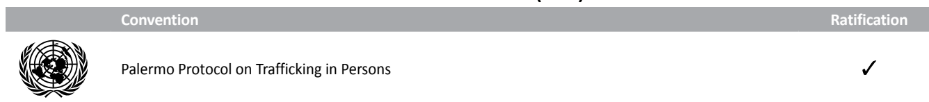
Table 3. Ratification of International Conventions on Child Labor (cont)

The government has established laws and regulations related to child labor (Table 4). However, gaps exist in São Tomé and Príncipe’s legal framework to adequately protect children from the worst forms of child labor, including the minimum age for work.