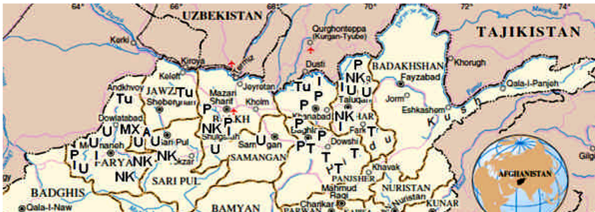
Figure 4: Ethnic composition of known Taliban fronts in the north

During the Danish Immigration Service's fact-finding mission in Afghanistan, 25 February to 4 March 2012, the Afghanistan Independent Human Rights Commission (AIHRC) stated that in non-Pashtun areas, the Taliban would often ask the community to join them or in poor areas individuals would be offered money to fulfil tasks for them (170) . A contact in Afghanistan pointed out that where other ethnicities than the Pashtun were recruited, financial incentives are often key (171) . When insurgents try to reach out to other ethnicities than the Pashtun, religious motives as well are important as a mobilising factor (172) .