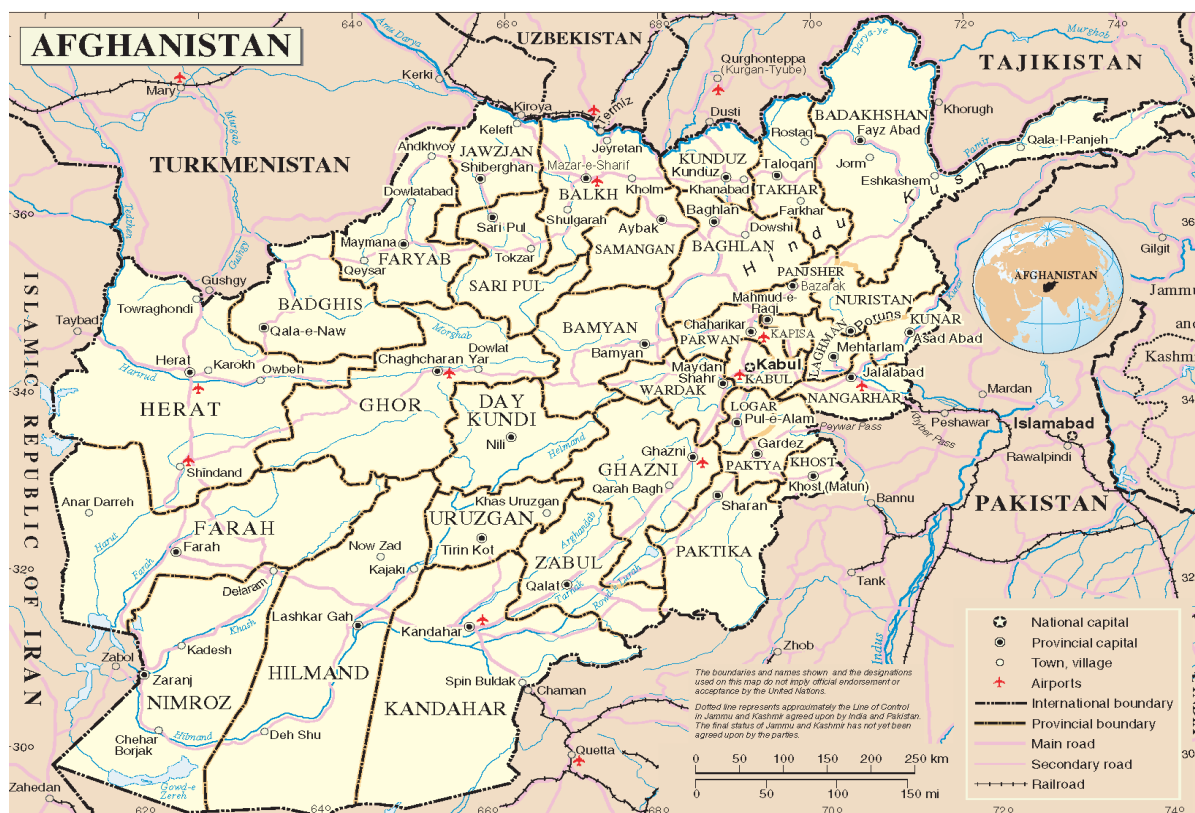
Figure 2: Provinces in Afghanistan

Some Uzbek and Tajik commanders joined the mujahideen commander Ahmad Shah Massoud who was the military commander of Jamiaat-e Islami, headed by Burnahuddin Rabbani. Massoud entered Kabul in 1992. A government was formed and after the brief presidency of Mojadeddi, Rabbani became president. An opposition leader, Gulbuddin Hekmatyar was one of the main competitors for the government. He had no real power base in the Afghan communities, but had a lot of resources provided by his international connections. Regional strongmen had a power base in the local communities: Haji Qadir controlled the eastern Pashtuns with as regional capital Jalalabad. Jalaludin Haqqani controlled the south-east with at his core base, the Pashtun Zadran tribe. Mullah Naqibullah Akhund