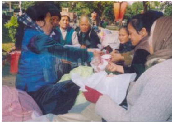
Women demonstrators share a meal