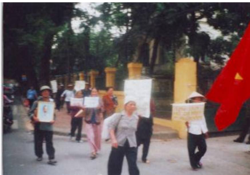
Victims of Injustice demonstrating outside the National Assembly in Hanoi

An Alternative Report to the Committee on the Elimination of Discrimination against Women (CEDAW) on the Combined fifth and sixth periodic reports of Vietnam United Nations, New York, 15 January 2007