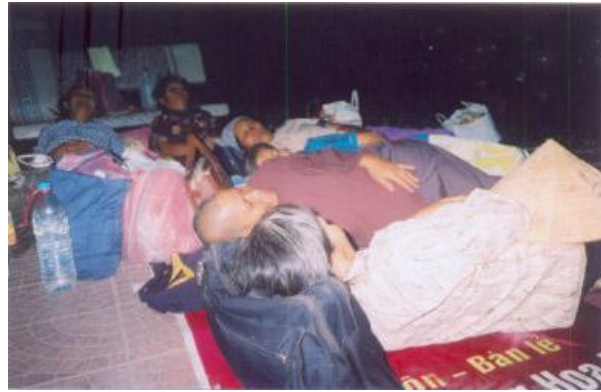
Victims of Injustice spend the night in Mai Xuan Thuong Park