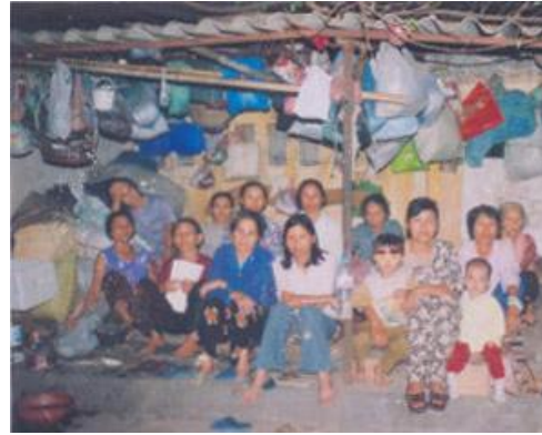
Women spend the night in a make-shift shelter

Official power abuse and corruption amongst Communist Party and government officials are a major source of land abuses against women. Reporting on the illegal confiscation of lands in the rural areas, Major-general Trinh Xuan Tu, Deputy Head of the General Department of Public Security told Vietnam's National Assembly in 2006 that more than a third of illegal land confiscations were committed by government and Party officials. He cited many cases, including that of Van Giang, Hung Yen province, where the local authorities reclaimed 522ha of land for a project. 3,940 families who were supported by the land were expropriated without any alternative employment or compensation. 86 State corruption and power abuse penalize women in particular, since women lack knowledge about their rights and access to legal support. Moreover, in Vietnam's one-Party state system, it is extremely difficult to oppose decisions of corrupt or abusive state officials.