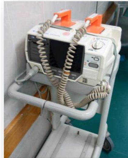
Outdated defibrillator, Shifa OR, June 2014.

The operation of Al-Shifa Hospital is therefore now in a very serious situation. Despite encouraging, fresh external painting and the completion of a new building adjacent to the surgical block, the interior of the hospital is now extremely worn and torn and do not hold standards expected in a key university hospital for 1,7 million people. Almost all stationeries and physical elements are due to be replaced, from trolleys and IV-stands to defibrillators, anaesthesia machines and surgical instruments. The patients, their families and the people of Gaza deserve a valued and paid staff and a