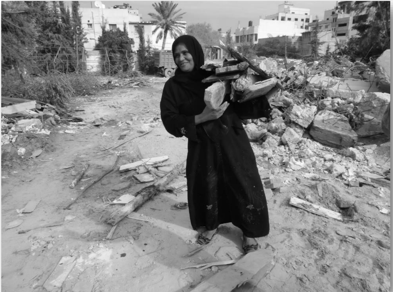
Destruction and resilience: A Palestinian woman is clearing up her destroyed home following Israeli bombing, Gaza City Nov 2012