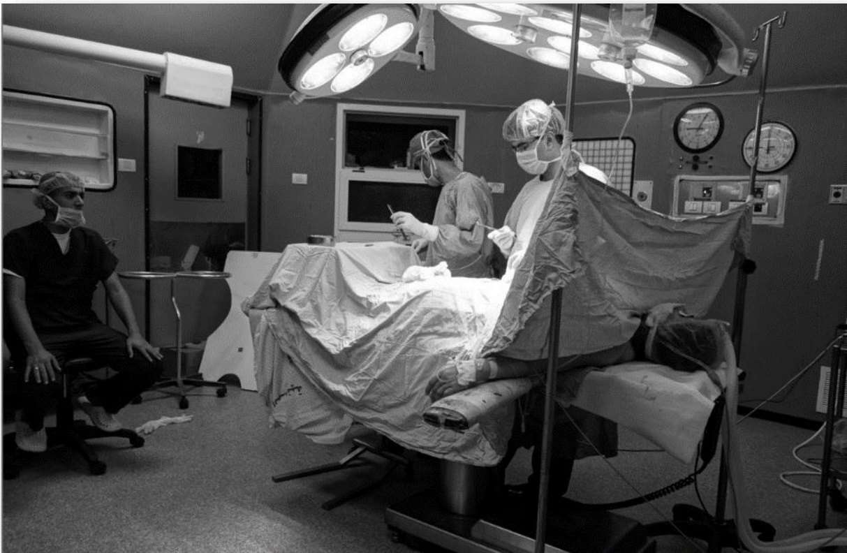
Shifa Hospital, OR, night shift, June 2014: despite desperate lack of staff salaries, medical equipment, drugs and disposables, good medical work is carried out.

level of medical services to the people of Gaza, which they all see as their primary duty. Shifa Hospital's staff and leadership have high aspirations and wish to perform state-of-the-art medicine, evidence based practise and research, but siege and serious deficiencies deny them this right.