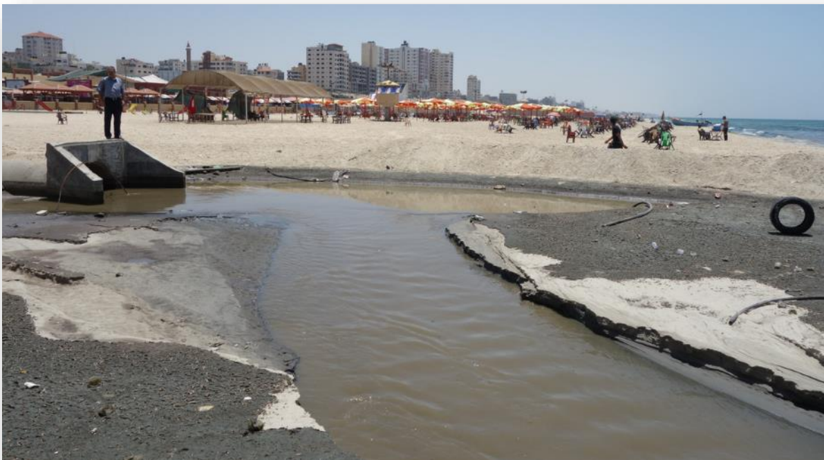
June 2014: Rivers of raw sewage now flows directly into the open sea from Gaza Municipality's Pump Stations number 1, 2, 3 and 9, totalling around 65.000 cubic meters of raw sewage daily, only from Gaza City.

During my guided tour to one of the largest raw sewage collection and pumping stations in Gaza City, I found a well-organized, properly staffed and modern sewage processing plant, which all pumps and functions nullified. They had been stopped due to lack of funds to buy fuel to operate the two large generators, generators needed to compensate for the lack of stable and sufficient electrical power supply to Gaza. The abhorrent smell from the raw sewage now running untreated into the nearby white shores of the Mediterranean sea had left the large seaside cafeteria and playing ground for Gaza's much tested children all but empty.