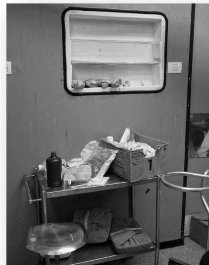
Outdated equipment, poor physical environment, Shifa OR, June 2014.