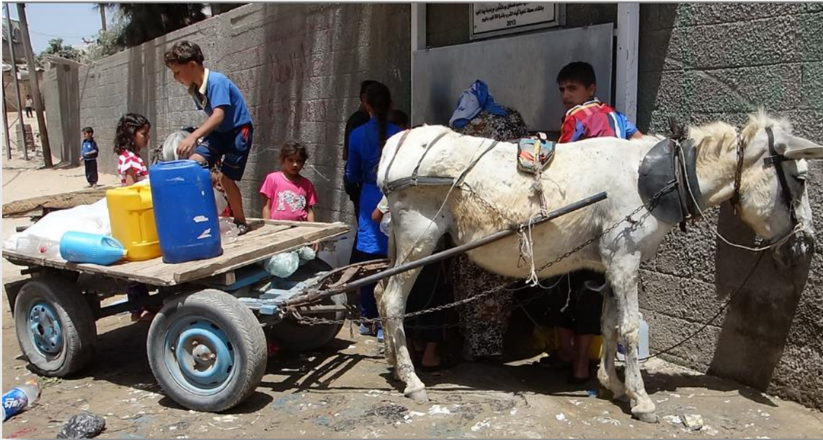
Children collecting fresh water from tap in Beit Lahia, June 2014. 90 % of Gaza's water still is undrinkable.

Fresh water pumping stations in Gaza City are also stopped due to lack of funding for fuel, severely impeding an already insufficient public water supply. Since 90 % of the water from the Gaza Aquifer is unsuitable, supplies of household water is essential. Bottled drinking water must be purchased by most families, adding to already strained private economy. Fifty percent of the Gaza Strip's population receive running water supply for six to eight hours once every four days only; 30 % receive water for six to eight hours once every three days only (OCHA). Water desalination units have reduced their operation levels by approximately 40 % since the beginning of 2014 (OCHA).