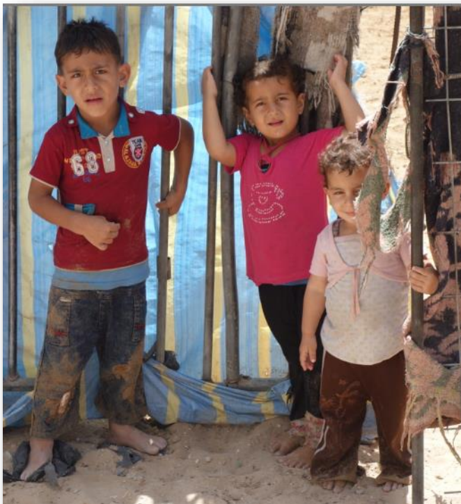
Palestinian children in Beit Lahia, June 2014. Gaza's children suffer man-made malnutrition with widespread anaemia and stunting.

Food assistance is of paramount importance in Gaza, where last year, UNRWA provided food assistance to over 800,000 refugees. In 2000, when the economy was functioning smoothly, only 10 % of refugees required UNRWA food aid.