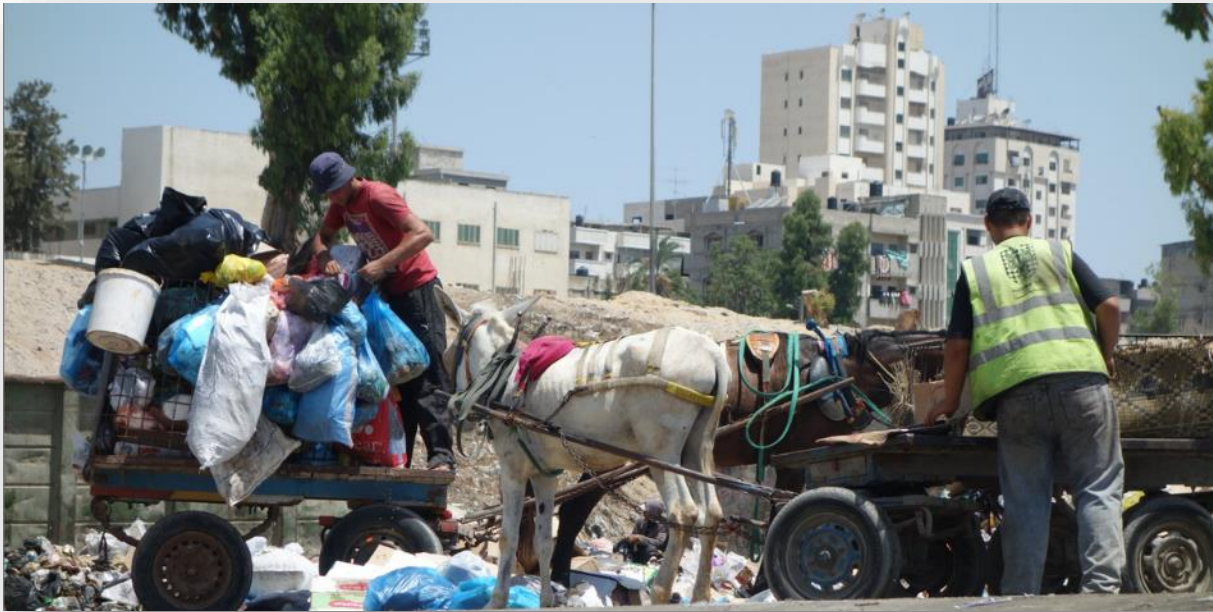
Solid waste donkey carts emptying the collected city garbage at the Yarmook transfer station for later to be transport further to landfill side. Gaza Municipality, June 2014.

running out in November. The garbage collection workers have so far been working two shifts, but is reduced to one shift due to money and fuel constraints, severely impeding capacity.