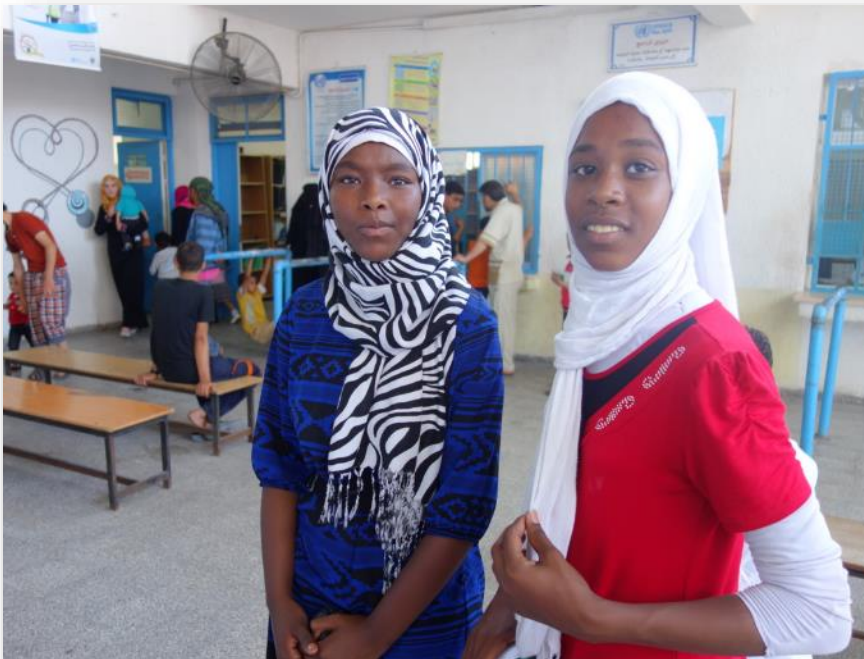
Young Palestinian refugees seeking medical help in the relatively new UNRWA PHC-Clinic in Kahn Yunis, June 2014.