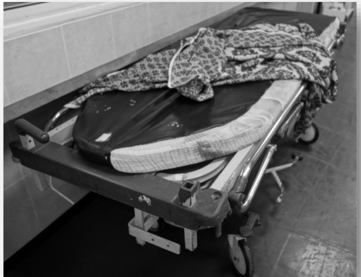
Shifa Hospital, OR, night shift, June 2014: a totally deranged patient trolley, used to take surgical patients into the clean OR.

The Shifa Hospital staff have been through an extreme historical period. The two Intifadas, the Israeli military attacks in 2006, 2008-09 and 2012; the inter-Palestinian conflict and the siege from 2007, have together placed almost insurmountable burdens and extreme challenges on top of the daily medical work. Large flows of emergency cases and extreme war trauma have pushed the staff and the hospital's capacity to its limits. Still, they have performed well and managed to implement substantial, operational improvements with a high precision in mass casualty triage. In Nov 2012, a large influx of patients who had war trauma was managed in Al-Shifa Hospital despite the erosion of infrastructure, supplies, and general population health from the previous 5-year Israeli siege. Improved, stricter triage reduced patient admission during the 2012 Israeli military attack versus the Israeli military attacks in 2008—09. Additionally, hospital staff were better