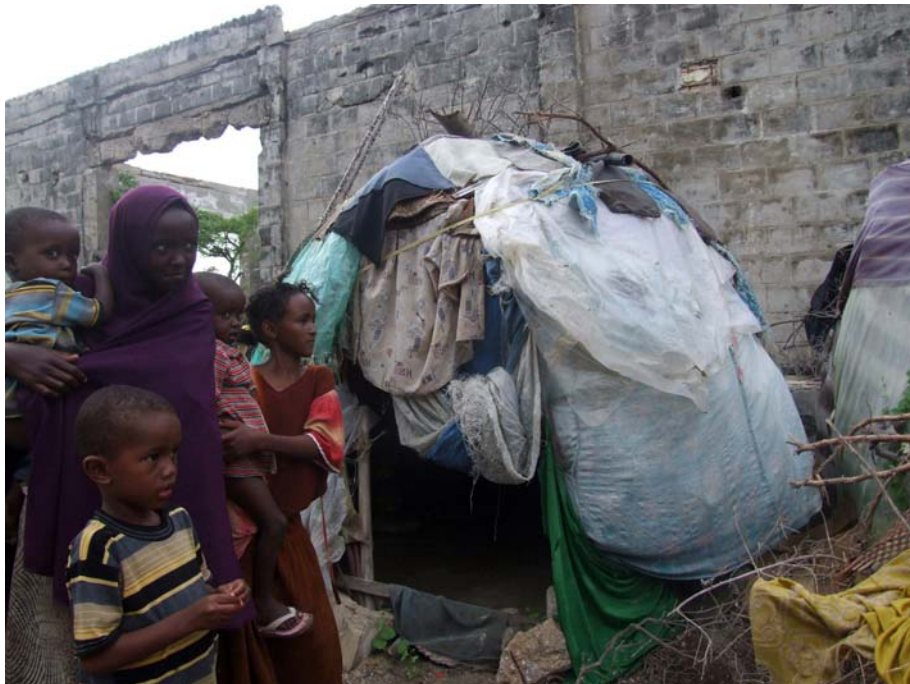
A Somali woman and children walk past a makeshift home in Mogadishu, after they fled fighting between Somali government forces and Islamist fighters, June 2009.

“One day I went to school and when I came back for lunch my family was not there and the house was destroyed. It was in December 2009. I came here [to the refugee camp] with my maternal aunt. I had 10 siblings: the oldest is 22, the youngest is three. The small children were at home as well as my mum and dad that day.”