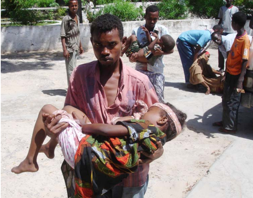
Somalis help wounded children to health facility after they were wounded by mortar shell that landed in their house in Mogadishu, Somalia, 29 July 2009

A woman from the Medina district of Mogadishu, who left Somalia in February 2010, said: