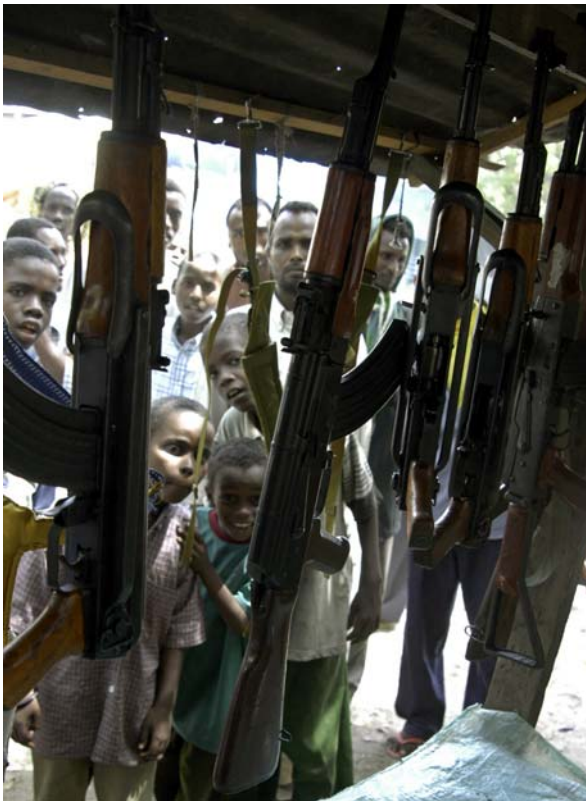
Weapons for sale at Bakara market, Mogadishu. May 2004

Parties to the conflict and other armed groups not detailed here, such as clan militia in specific areas or armed criminal gangs, have often overlapped, forged or shifted alliances, or suffered divisions over the past few years. There have been regular reports of defections between the main parties to the conflict, the TFG and al-Shabab. Defections have included members of the TFG security forces allegedly joining armed opposition groups after not being paid salaries, or factions of armed groups joining the TFG following grudges against their former allies. 22