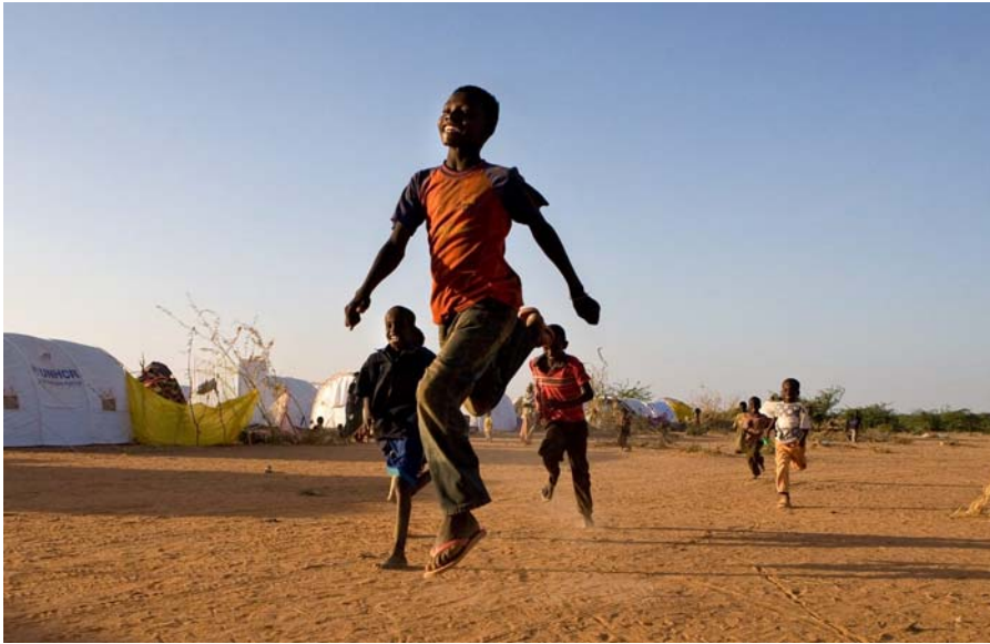
Children race against each other outside the new arrivals section of Ifo camp in Dadaab, Kenya, December 2008.

Two decades of armed conflict have taken a toll on the education system and infrastructure in South and Central Somalia, which is further compounded by the indiscriminate attacks affecting the provision of education and targeted attacks against pupils, teachers and school facilities, as described in this document. The armed conflict in Somalia has prevented an entire generation of children from receiving education and from learning skills that could provide them with sustainable livelihoods. International studies have also underlined the long-term consequences of the lack of provision of education in conflict-affected countries: national inequalities and poverty are likely to be reinforced, and lack of education and employment prospects can fuel armed conflict and threaten peace prospects. 117 In Somalia, some children with no education and livelihood opportunities have been reportedly joined armed groups to be able to sustain themselves; others who have grown up surrounded by violence are drawn into committing more violence. 118 The lack of education for the vast majority of Somali children and young people will bear heavily on the future of South and Central Somalia.