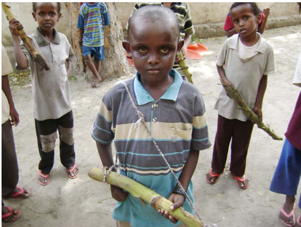
Somali children playing war games, 10 August 2008.

Another boy, aged 14, who fled Somalia in March 2010 confirmed: