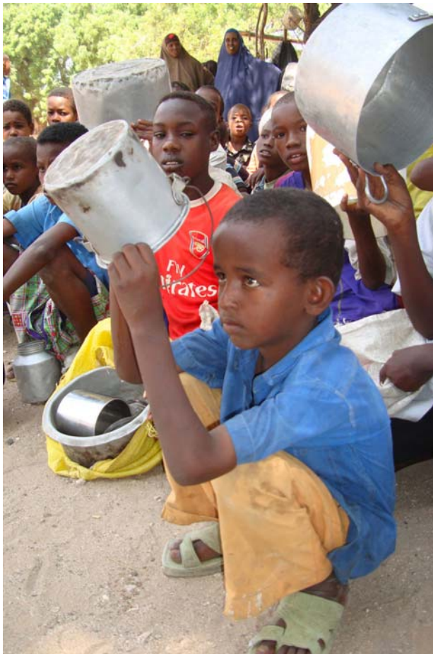
Internally displaced Somali children wait with containers in hand to receive food aid at a food distribution centre in Mogadishu, Somalia, January 2010.

Access to humanitarian aid by populations in need of assistance has drastically reduced in the past four years in South and Central Somalia, with devastating effects for children, who are among the most vulnerable, particularly to food insecurity and diseases. The operations of aid agencies have been curtailed by indiscriminate and disproportionate attacks by all parties to the conflict and the general insecurity reigning in the country. Military operations do not only impede humanitarian access and expose aid operations to danger, they also result in