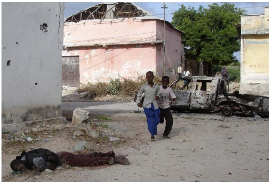
Children run past the body of a man, January 2009.

I don’t lead a normal life for someone my age. Someone my age would have had an education and a family who cares for her. I live with a family and I get something to eat and a place to sleep. I’m afraid that if I leave this family whom I’m working for I may not get any better place.”