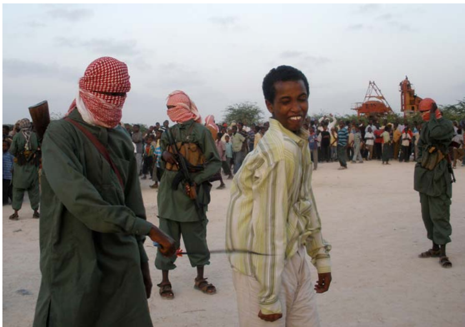
An Islamist fighter from al-Shabab beats a youth, after he was accused of a crime, March 2009.

Children have also been flogged after being accused of not praying at the right time. A 15 year-old boy who fled Baidoa in late 2009 said: