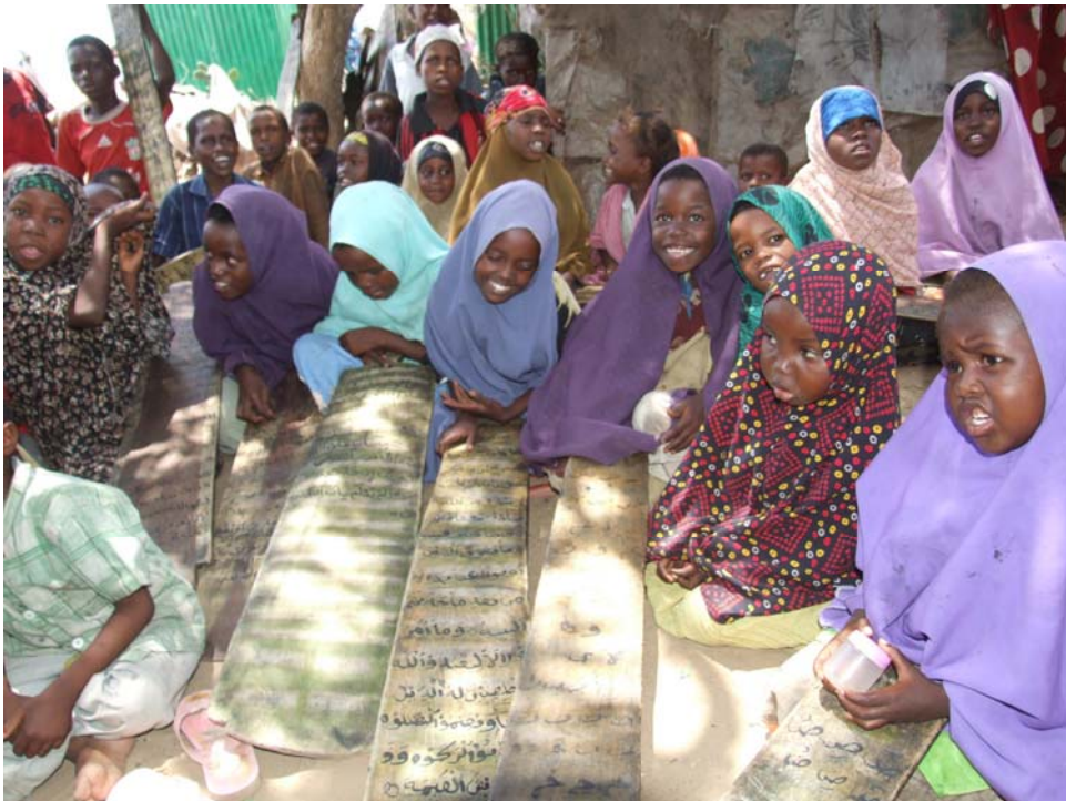
Girls at Qur'anic school, April 2008.

Children's right to education in South and Central Somalia has been severely restricted because of indiscriminate attacks and constant insecurity and direct attacks on schools, education personnel and pupils by al-Shabab. In some areas, al-Shabab factions have also imposed restrictions on girls' access to education and on schools' curriculum.