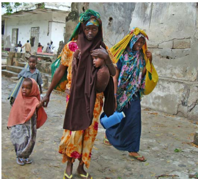
Women and children flee fighting between Somali government forces and Islamic fighters, July 2009.

“War in Somalia is so terrible for the children because they can get lost so easily. One of my daughters is missing as a result of the war. She is nine years old. A mortar was thrown near my home so I had to run away with my other children. I couldn’t find my daughter and I don’t know if she’s alive or dead. I’m not alone in this case – the majority of the people have lost children as a result of the war. It is just too easy to be caught in the cross-fire of the fighting and everyone has to run for their lives.”