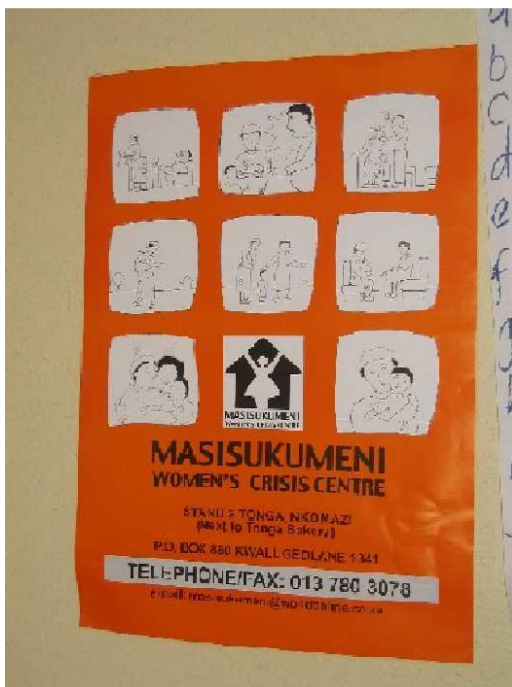
NGO Service-providing organisations play a vital role assisting women with information on state services and helping them cope with the consequences of violence and other forms of discrimination.

income transfer to poor families.” 358 In responding to this challenge government authorities have to uphold their obligations, first of all, to progressively realize the right to health for all without discrimination. They need to take into account, in addition, the life-long needs and health consequences of HIV infection for women who are living in circumstances of chronic poverty. The provision by the state of a number of social assistance grants has been critical for the survival of individuals and families living with HIV and AIDS in circumstances of poverty, but the limitations imposed by current eligibility criteria can result in women still being denied access to health services and to adequate food due to their inability to find other secure income. The NSP recognized this problem and included as a requirement for the effective implementation of the plan, the strengthening of systems to provide food support and the introduction of a “chronic diseases grant”. 359