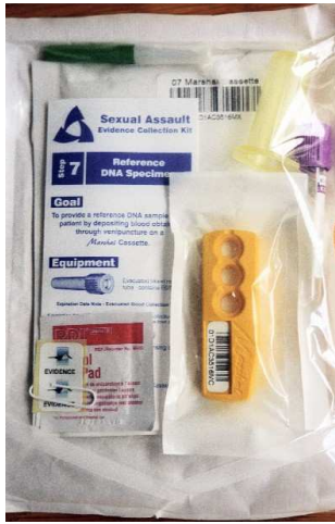
Part of the SAPS Sexual Assault Evidence Collection Kit introduced to improve the gathering of medical evidence by doctors and the management of the chain of custody of this evidence before and after it is handed over to the police.

However a number of concerns remain. The Department of Justice and Constitutional Development appears to have decided not to expand the development of the specialised sexual offences courts. Rape remains a difficult crime to prosecute and requires a high level of training for prosecutors and presiding officers. In the ordinary courts the conviction rates are low. In a recent study of the outcomes of over 2,000 police investigation cases in Gauteng province, 359 of the cases went to trial resulting in convictions for rape in about 87 cases, equivalent to less than five per cent of the original group. 82 Advocacy organizations who were involved in the decade-long process of reforming the sexual offences legislation have expressed concern that the final version of the reformed law has eroded the protections afforded to rape complainants and other vulnerable witnesses contained in the initial draft law. 83 The controversial trial on a rape charge of the former Deputy President, Jacob Zuma, in 2006 vividly illustrated the risks for complainants in seeking justice through the courts. The presiding judge allowed defence counsel to extensively question the complainant about her past sexual history, took into account the complainant's clothing and conduct, measured her behaviour against his assumptions of how a 'real' rape survivor may act and made no comment on the intimidating effect on the complainant of the conduct of