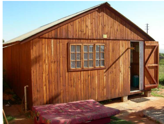
A 'victim-friendly' facility attached to a police station and run by the support organization, GRIP, for survivors of gender-based violence.