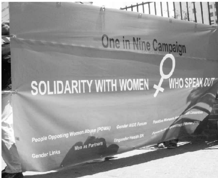
Campaigners, at the time of the trial of Jacob Zuma, highlighting the under-reporting of rape and the pressures on rape complainants.

Finally, in regard to prevention, much more needs to be done by municipal authorities in cooperation with the police, businesses and local rural communities to improve women's physical security by identifying and addressing threats to their safety in the physical environment. AI visited a number of areas where poor or no lighting, high bushes along pathways and inadequate transport links increased the risks of violence for women and girls on a daily basis. Police management could also give greater priority to increasing the level of personnel, vehicles and equipment for rural-based police stations. 86