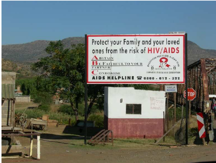
A billboard giving the 'ABC' message in rural KwaZulu Natal and promoting the use of condoms as an HIV prevention method.

support they need, men's threatened or actual use of violence was another critical factor causing the women to give in to the pressure from their partners for unprotected sex and thereby placing themselves at risk of HIV transmission or re-infection.