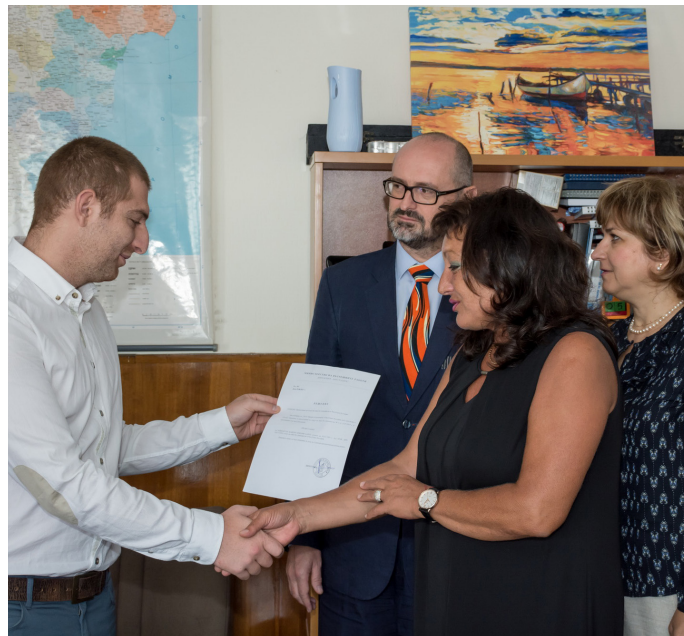
First person to be granted stateless status by the Bulgarian Government since the adoption of the statelessness determination procedure

On 22 August, the President of Chile , and the Ministers of International Relations, Interior and Public Security, signed a bill on the new Migration Law . The bill, which has been introduced to Congress, includes guarantees such as temporary residence permits for stateless persons and appoints the Ministry of Interior and Public Security as the competent authority for conducting statelessness determinations.