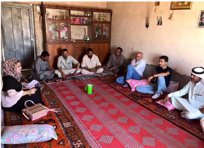
Mercy Hands lawyer providing counselling to a group of Bidoun in Basra governorate, in Iraq

With respect to Action 8 (Issue nationality documentation to those with entitlement to it) , the NGO Mercy Hands completed in July a two-month survey in targeted governorates in Central and Southern Iraq to improve qualitative and quantitative data on stateless populations. During this exercise, Mercy Hands also provided legal assistance to 519 individuals and contributed to the issuance of 133 Nationality Certificates ( Jinsiyeh ), Civil IDs ( Hawiyeh ) and other legal documents.