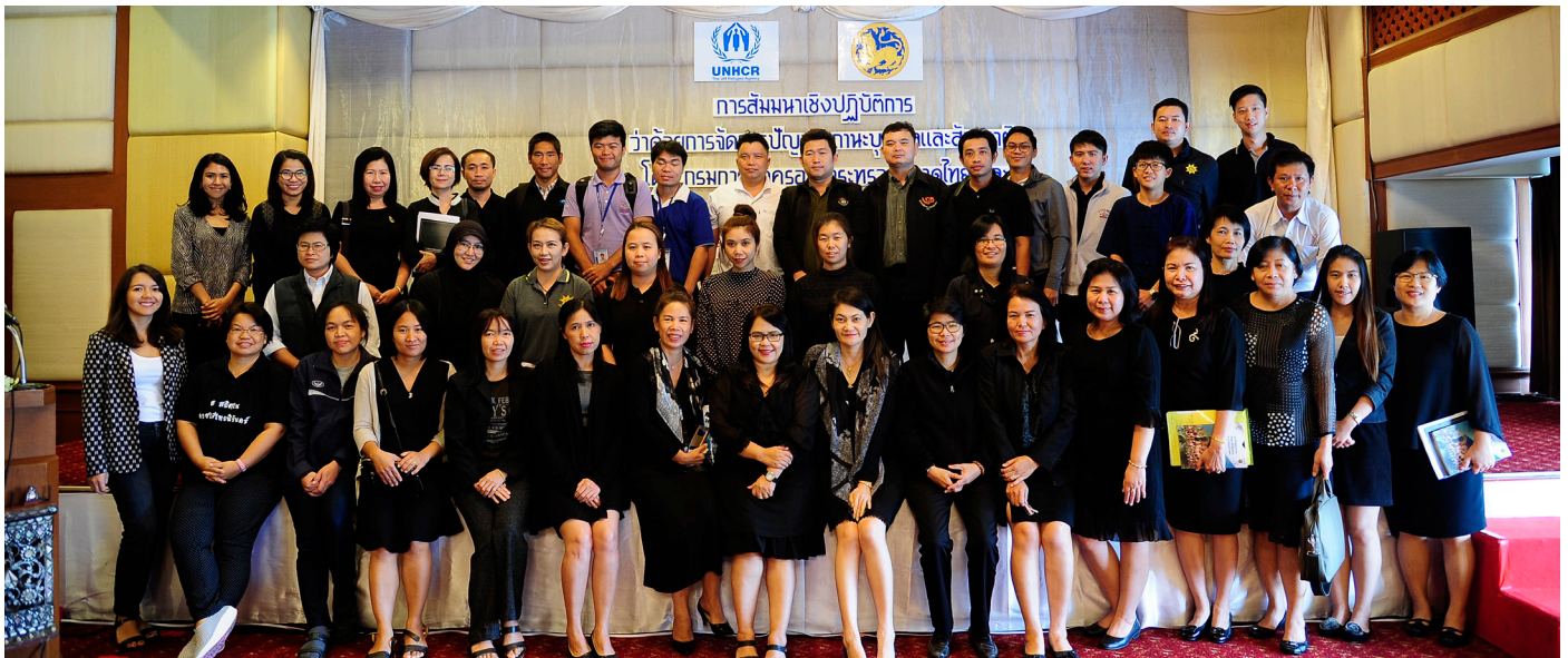
Participants at the Workshop on Nationality and Legal Status in Chiang Mai, Thailand

Two additional events focused on improving the prevention of statelessness and the protection of stateless people took place in the Philippines . On 27 July, UNHCR and UNICEF hosted a forum on birth registration aimed at government partners and civil society. The gathering aimed to identify challenges that hinder the implementation of birth registration initiatives and to strengthen local partnerships and collaboration. On 30 August, the Government, through the Refugee and Stateless Persons Protection Unit, convened a workshop to discuss the establishment of a system of facilitated naturalization for stateless persons and refugees and consider measures to increase the protection of these groups pending naturalization.