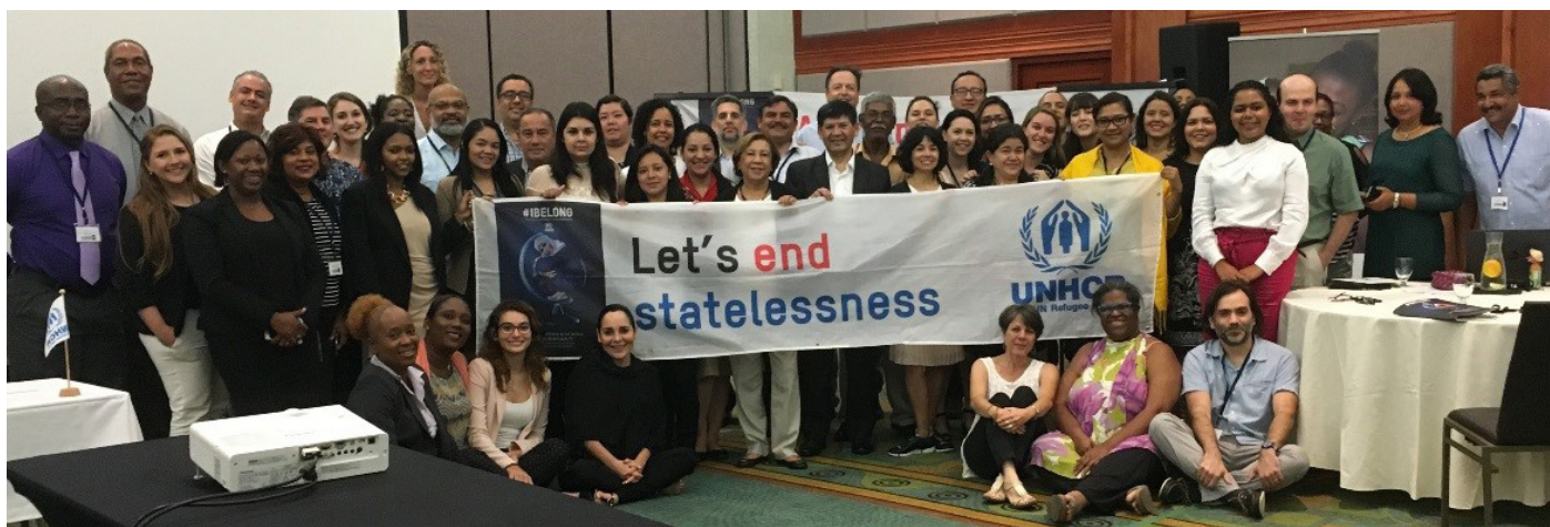
Sixth Regional Course on Statelessness in the Americas

On 21 July, the Ministry of Justice of the Kyrgyz Republic and UNHCR jointly organized a multi-stakeholder meeting to discuss measures to enhance birth registration and statelessness prevention in Kyrgyzstan. Participants included other Ministries, the Ombudsman's Office, civil society organizations and UNICEF. In order to help advance legislative reform, a working group under the Ministry of Justice was created. On 21 September, a similar event was organized by UNHCR and the Ministry of Justice of Tajikistan . The meeting was attended by representatives of several Ministries as well as UNDP and UNICEF. Next steps include close collaboration among the authorities, UNHCR and UNDP on the EPOS project concerning improvement of civil registration in the country and providing practical guidance on implementation of the Law on Civil Registration.