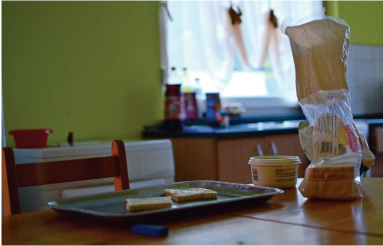
Mid-morning snack for children at the only specialist shelter facility in Hungary for victims of domestic violence. Victims may only stay for a maximum of 60 days, after which women with children may be placed in other temporary accommodation. Women without children are not eligible for further assistance. October 11, 2013.

Many of the women interviewed by Human Rights Watch viewed shelters as a temporary reprieve from the abusive home environment. Edit, a 28-year-old woman from a small town close to Budapest, told Human Rights Watch that she needed a temporary break from her abusive partner: