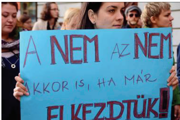
"No means no even if we already began" - Demonstration in Budapest against sexual and domestic violence. September 13, 2013.

The public outrage and protests that followed Varga's statement forced the parliament, where Fidesz has a supermajority, to reverse its previous position and to agree to include domestic violence as a discrete crime in the new criminal code. Or, as Fidesz party leader Antal Rogán stated, "I bow to the will of the ladies." 2 The government subsequently included a standalone provision on domestic violence in the new criminal code, which entered into effect on July 1, 2013.