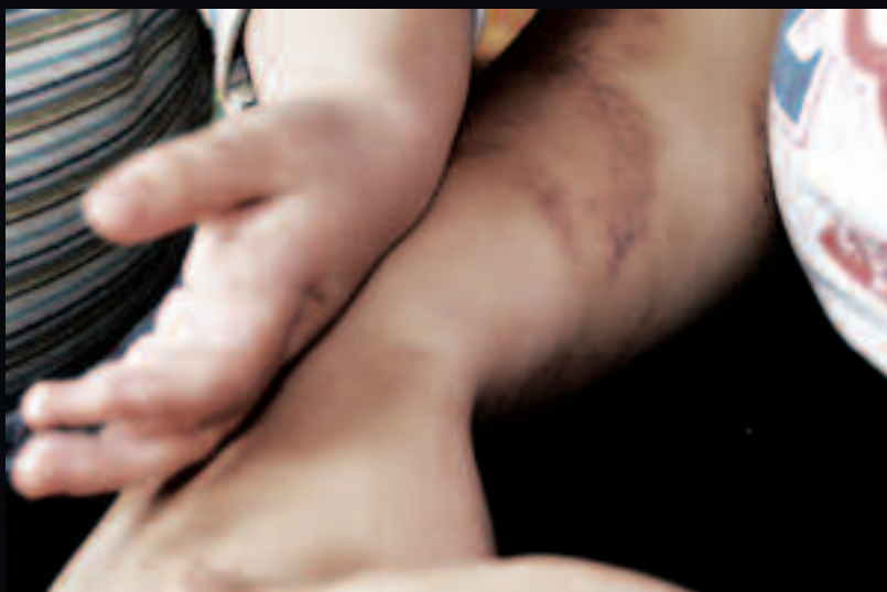
A woman and child at a shelter for victims of domestic violence in Hungary, October 10, 2013.

Hungary has clear obligations under international human rights law to protect women from violence. To meet these obligations, the Hungarian government should rectify the current shortcomings in its laws, policies and practices, improve police training, and increase the capacity of shelters for victims of domestic violence.