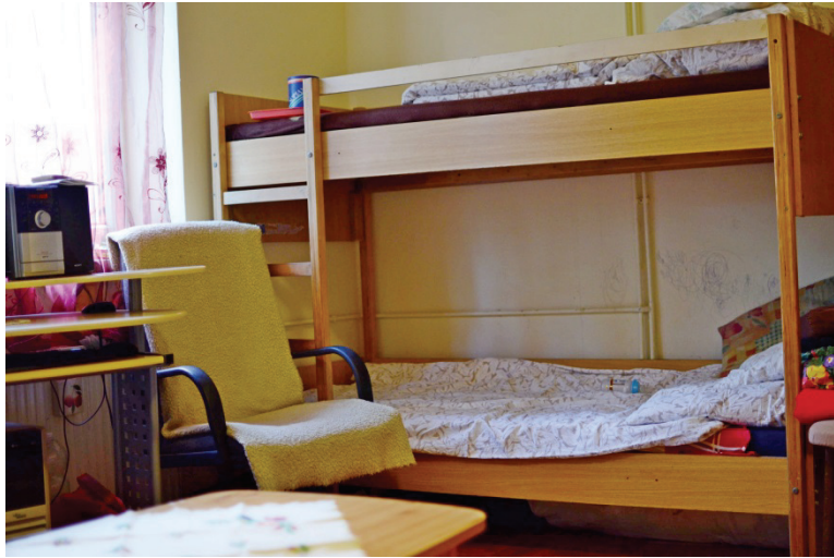
Room for homeless family of four in a temporary shelter. A shortage of specialist shelters for victims of domestic violence means that domestic violence survivors are often placed in the same facility as homeless families. October 9, 2013

The UN Handbook for Legislation on Violence against Women recommends that states make available one shelter or refuge place for every 10,000 inhabitants. 115 Similarly, the explanatory memorandum to the Council of Europe Convention on Preventing and Combating Violence against Women and Domestic Violence recommends that states should make safe accommodation in specialized women's shelters available in every region, with one family place per 10,000 head of population depending on need. 116 With a total population of around 10 million, Hungary currently falls far short of this standard and would need around 1,000 spaces to meet it.