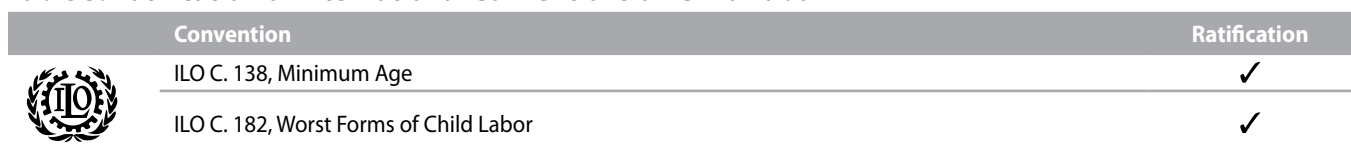
Table 3. Ratification of International Conventions on Child Labor

Mali has ratified all key international conventions concerning child labor (Table 3).