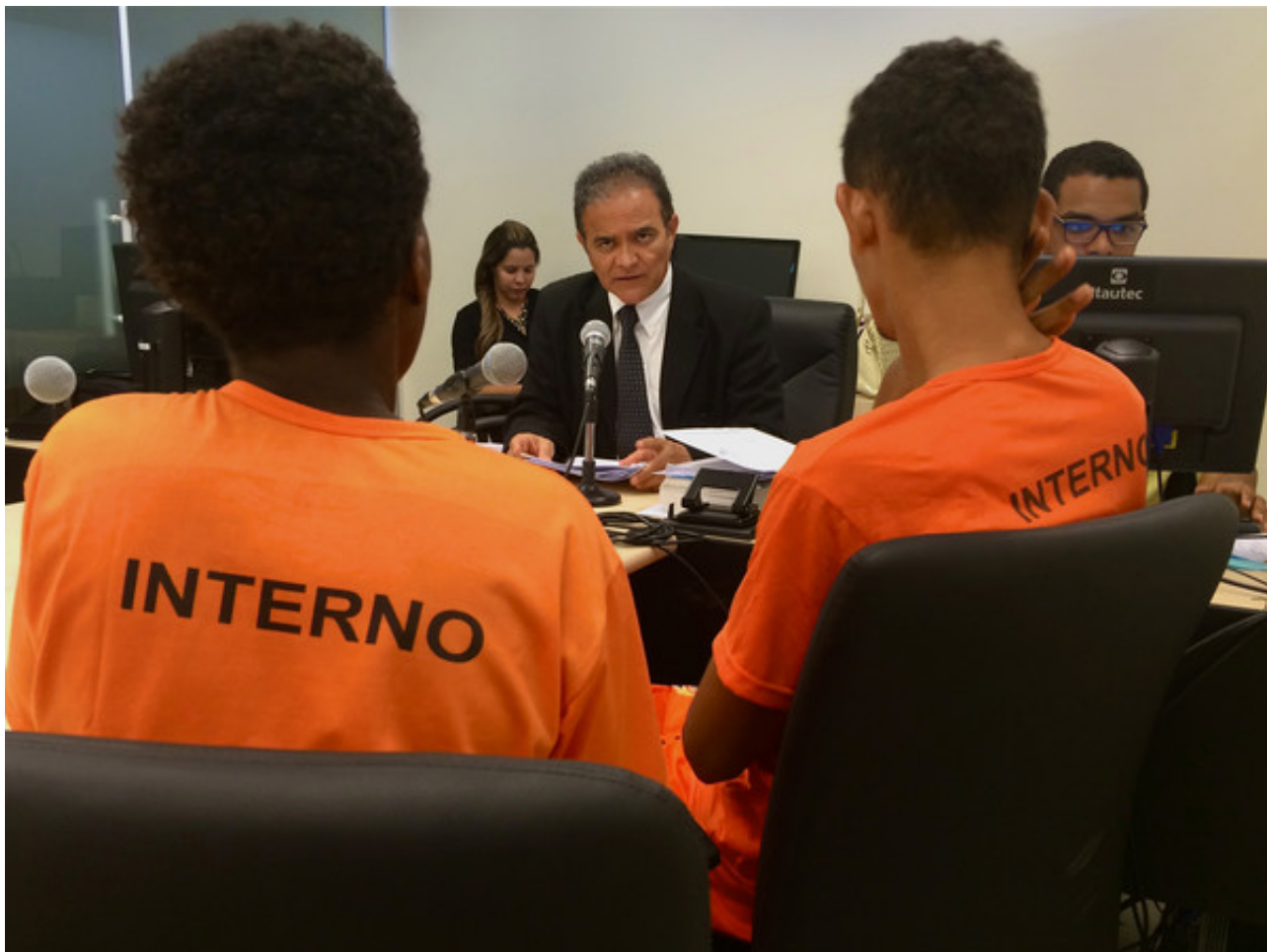
Judge Fernando Mendonça conducts a custody hearing in January 2015.

In January 2015, Human Rights Watch visited Pedrinhas, the largest prison complex in Maranhão, and interviewed 25 inmates and 17 relatives of current or former inmates, as well as judges, prosecutors, public defenders, defense lawyers, former guards, local officials, and representatives of the Sociedade Maranhense de Direitos Humanos [4] (Maranhão Human Rights Society), a nongovernmental group.