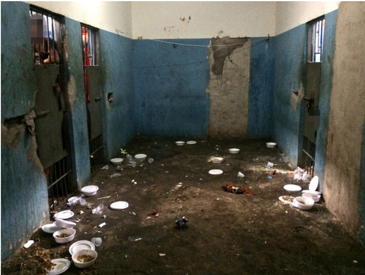
A cellblock in the Pedrinhas prison complex.

More than 90 inmates have been killed in Maranhão's prisons in the past two years, most by members of rival gangs, according to data from the National Council of Justice [5] and the Maranhão Human Rights Society. Gang members have mutilated their victims, carried out kidnappings and extortion inside prisons, and raped visitors, detainees and officials told Human Rights Watch.