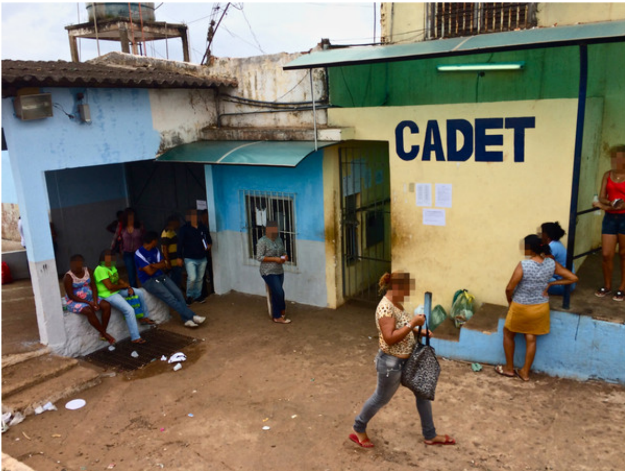
The entrance to the Casa de Detenção (Cadet), one of the facilities in the Pedrinhas prison complex.

The inmates who declare themselves gang members are eventually transferred to one of five Pedrinhas units designated for one of the two gangs. Those who declare themselves “neutral” are moved to a facility known as “Cadet” (short for “Casa de Detenção”) that is supposed to be free of gang activity. But prison officials and judges told Human Rights Watch that they suspected there were gang members in the “neutral” facility as well. Female inmates are held in a seventh unit.