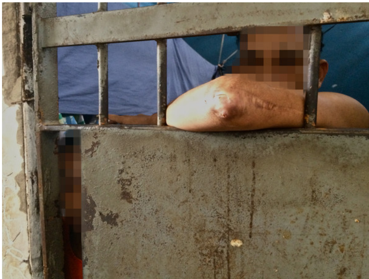
An inmate in the Pedrinhas prison complex.

The draft bill before Congress would require custody hearings within 24 hours of arrest nationwide. The bill says that a prompt hearing before a judge guarantees the physical and psychological safety of detainees, prevents torture, and allows judges to monitor the legality of the detention.