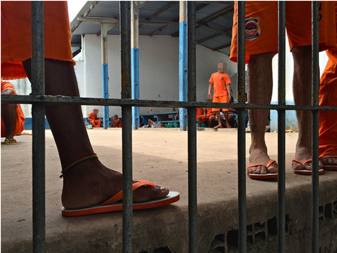
Yard at the Casa de Detenção (Cadet), one of the facilities in the Pedrinhas prison complex.

In contrast, Brazil's criminal procedure code requires that when an adult is arrested in the act, only the police files of the case must be presented to the judge within 24 hours, not the actual detainee. Judges evaluate the legality of the arrest and make the decision about continued detention or other precautionary measures based solely on written documents. They only see the detainee at their first hearing, often months after the arrest.