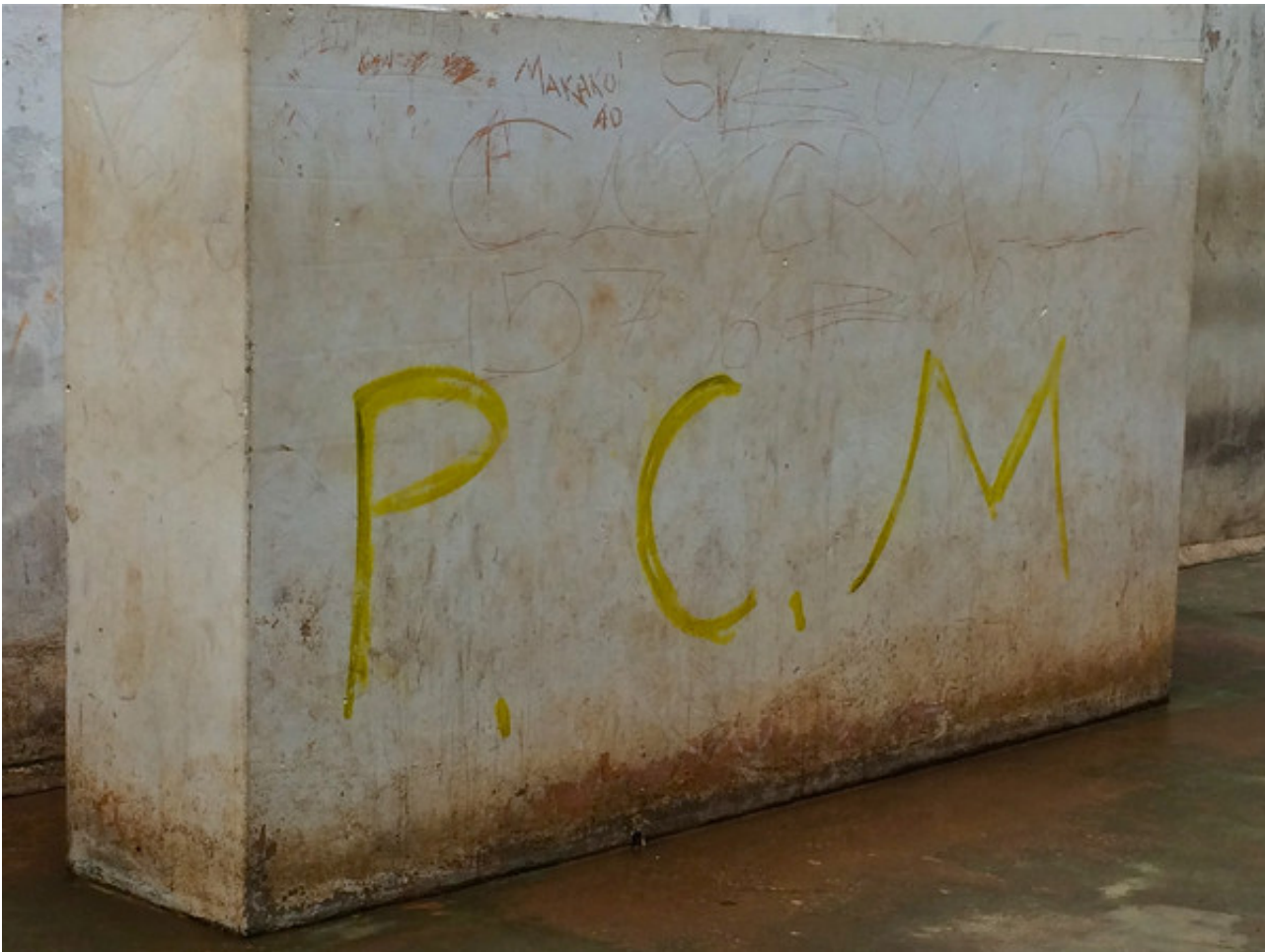
Tagging by Primeiro Comando do Maranhão (Maranhão's First Command, PCM) gang inside the Pedrinhas prison complex.