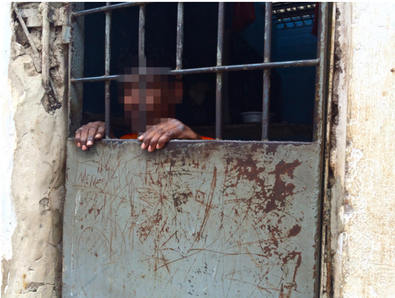
An inmate in the Pedrinhas prison complex.