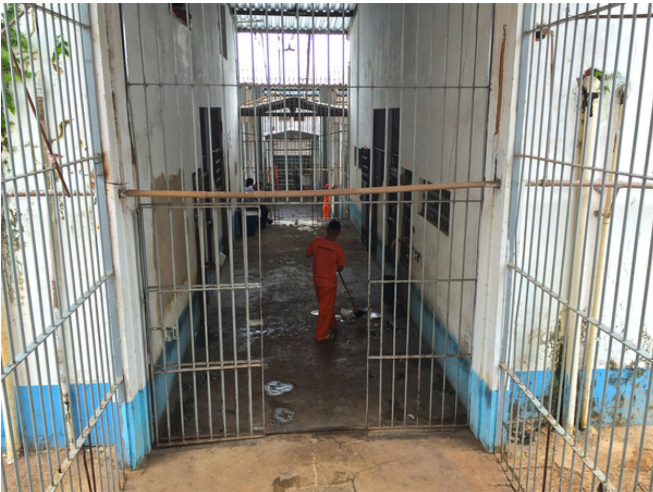
Inside the Casa de Detenção (Cadet), one of the facilities in the Pedrinhas prison complex.