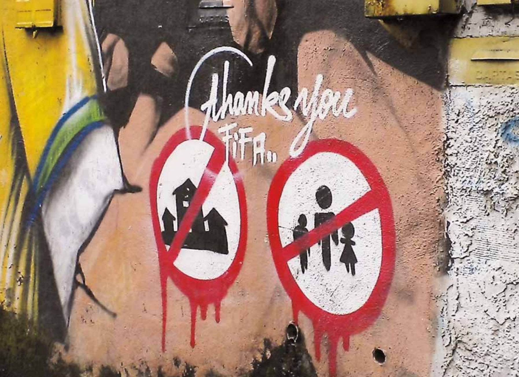
↑ Protest wall painting in the north Rio favela of Metro-Mangureira

never or rarely cover, the big media groups are beginning to fund and sponsor projects," she said. "It's a sign that our efforts to describe a different aspect of these neighbourhoods are starting to bear fruit.