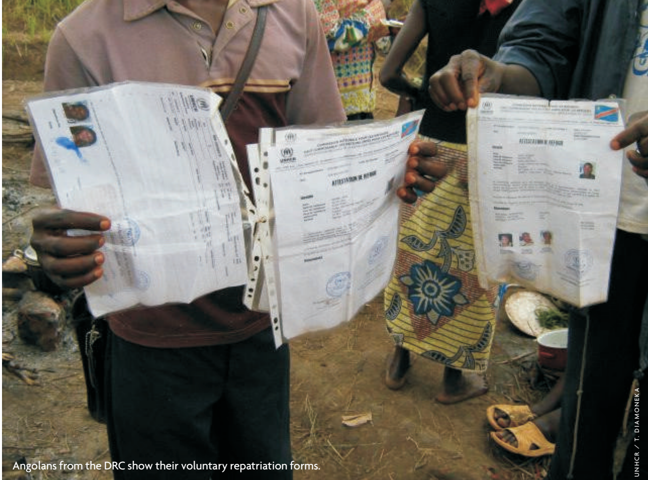
Angolans from the DRC show their voluntary repatriation forms.