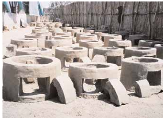
Fuel-efficient stoves in el Humeira camp Women’s Center, Kass, South Darfur. The stoves are made of a clay-sand mixture, sorghum ash or sawdust, and water. They are built around three vertically placed bricks, on which the pot rests. Due to placement of the bricks, the pot sits higher in the stove than in the Abu Shouk model. According to proponents of this model, the design allows better air flow to the fire. Interviewees said that cooking a typical pot of lentils requires approximately one-quarter of a stick of firewood.

The women were clearly uncomfortable with patrols that included only men, and were much more responsive to patrols that included both male and female CivPol members. They had not yet been asked their opinions about the patrols, but expressed clearly that they would have suggestions for CivPol and/or the local firewood patrol committee (regarding locations, frequency, number of participants, etc.) were they to be asked. A key concern of the interviewees was what would be done about the fact that women move at different speeds – the elderly and disabled, for example, would move more slowly and could either be left behind or would slow the rest of the group down.