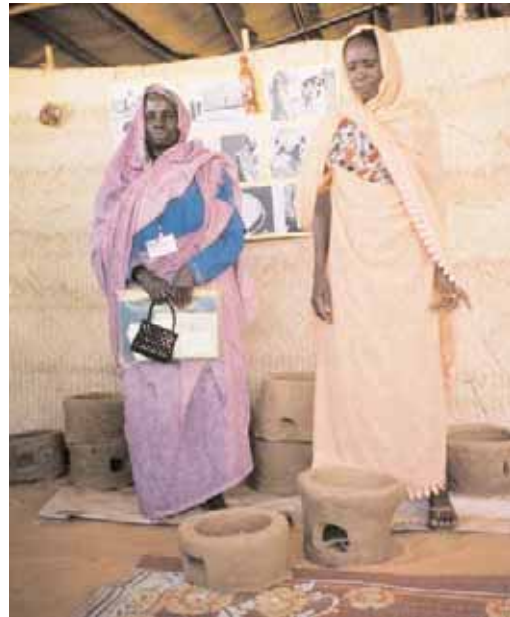
Women in Abu Shouk Women's Center, posing with their stoves.

still be at risk (which would make sense considering the women's earlier statement that they fear "anyone in a uniform.") Even when presented with the fact that at least some of the CivPol members participating in the patrols would be women, the women interviewed were still hesitant. However, they did suggest that they would be willing to sit down and talk with CivPol and perhaps after a series of such conversations would be more willing to accept the patrols.