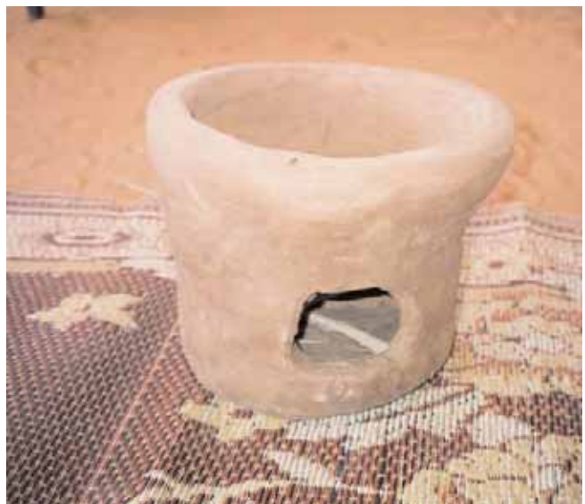
Fuel-efficient stove in Abu Shouk Women's Center, El Fasher, North Darfur. The stoves are made of a clay-sand mixture, animal dung and water, and are built around three horizontal bricks (on which the pot sits). Pots are placed almost fully inside the stove. A single piece of firewood is inserted under the pot through the small "door" at the base of the stove.

Before displacement, in their home villages, most women used either a three-stone fire or cooked with gas (none used a mud stove at home). Several of the women interviewed had seen an exposition on solar cooking put on by Cooperative Housing Foundation (CHF) in the camp, and therefore were familiar with the basic premise of the technology. However, the women, without exception, refused to use solar cookers themselves – the food takes too long to cook and, according to the women, tastes bad (it lacks the distinctive smoky flavor of food cooked over a fire).