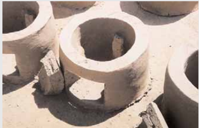
A fuel-efficient mud stove drying outside the Women's Center, el Humeira IDP camp, Kass (south Darfur).