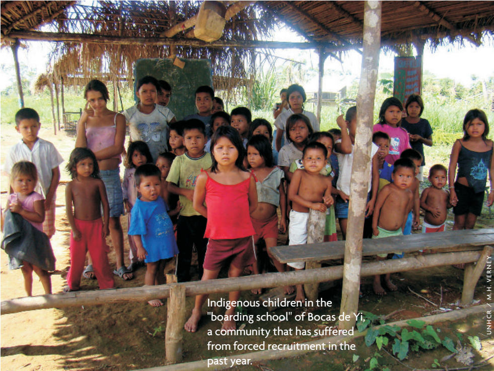
Indigenous children in the "boarding school" of Bocas de Yi, a community that has suffered from forced recruitment in the past year.