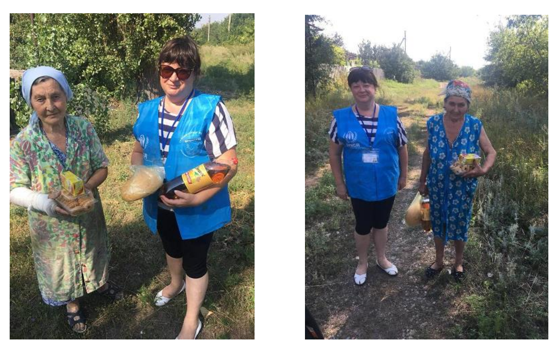
UNHCR through its Partner Proliska is the only organisation that has access to the village of Spirne, situated some 30 km from the Contact Line. Only elderly people stayed in the settlement, deprived of all services, namely food, medicine, transportation, gas and central heating. UNHCR is providing them with essential humanitarian and protection aid.