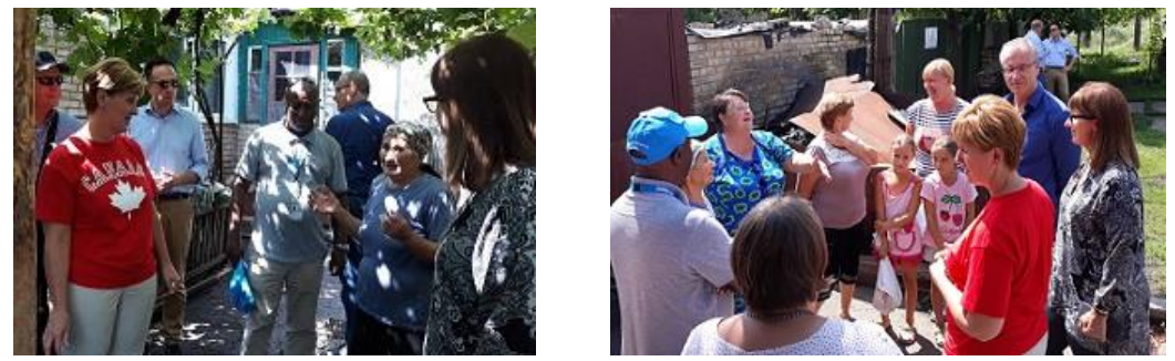
UNHCR took Minister to the village of Kurdiumivka. In this village, UNHCR and implementing partners rehabilitated 38 homes. Despite absence of military in the city, it suffered various shelling incidents in early 2015, early 2017 and recently in early 2018. As a result, people were killed and buildings destroyed. In response, UNHCR not only repaired 38 homes but also coordinated other partners through its Shelter Cluster to repair and provided in-kind material donations to a total of 83 households. Before, the village survived thanks to a ceramic factory. However, the factory was destroyed early in the conflict leaving the residents with no livelihood.