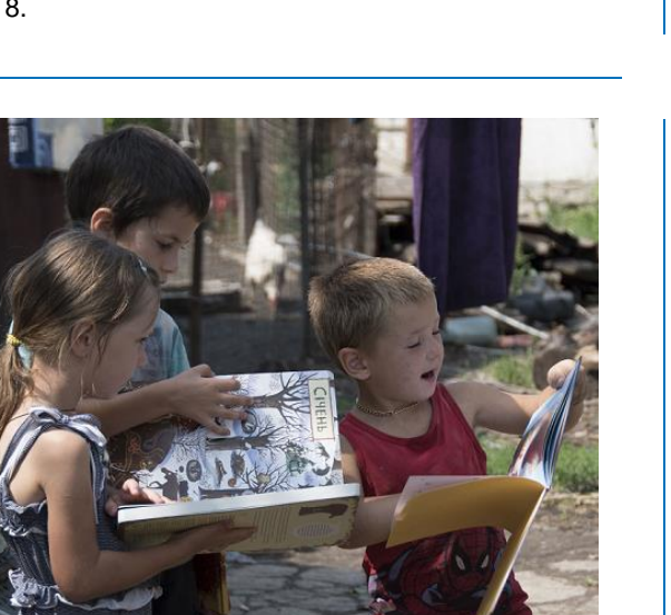
A family of 7 children from the village of Troitske, situated along the Contact Line received a cash grant from UNHCR and books from Partner NGO Proliska

Persons with specific needs have received in-kind support in Non-Government Controlled areas of Donetsk Region in 2018.