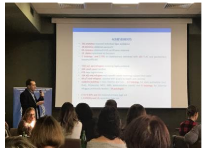
UNHCR legal partner R2P provides legal assistance to internally displaced persons and conflict-affected people.

UNHCR Annual meeting with partners: On 28 November, UNHCR held an annual "Partners Meeting" with 13 NGO partner working in Ukraine. The meeting included: Right to Protection (R2P), Proliska, People in Need (PiN), Norwegian Refugee Council (NRC), NEEKA, Crimea SOS, Tenth of April, Rokada, Slavic Heart, Most, Mira, DDC and Caritas Ukraine. The "Partners Meeting" received positive feedback from NGO partners who thanked UNHCR for the "participatory" style of this year's meeting. During the meeting, UNHCR conducted a refresher course on Age, Gender and Diversity Mainstreaming (AGDM) as well as Accountability to Affected Populations (AAP), presented an overview of project implementation in 2018 as well as programmatic plans for 2019. UNHCR also offered a thematic presentation on the importance of information management and reporting. NGO partners took the opportunity to present their achievements and challenges.