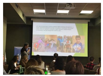
UNHCR NGO partner NEEKA supports refugees and persons at the risk of statelessness, namely Roma communities in Zakarpattia region.