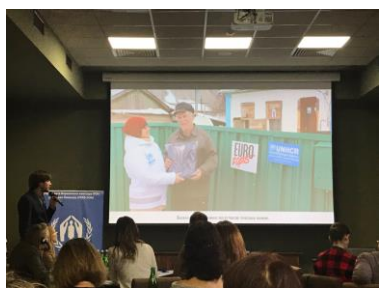
UNHHCR NGO partner 'Proliska' has ten hubs along the 'contact line' and is always the first to provide emergency support to conflict-affected population.

Mass Media Training: On 16 November, on International #ToleranceDay, UNHCR Ukraine held a mass media training for Ukrainian journalists in order to explain UNHCR's protection mandate as well as the challenges faced by those affected by forced displacement in Ukraine. The objective of the training was to inform and raise awareness among journalists of both challenges and potential of displaced persons and refugees in Ukraine so that they report objectively and prepare compelling human stories about Ukraine's complex humanitarian situation and displacement.