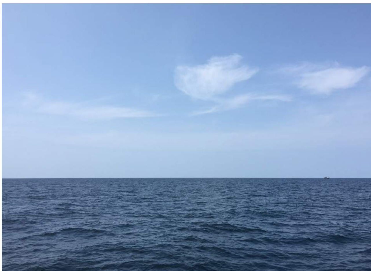
A fishing trawler sails through the Andaman Sea near where boats carrying thousands of refugees and migrants were abandoned by smugglers in May 2015.

The Bali Declaration on People Smuggling, Trafficking in Persons and Related Transnational Crime echoed 17 proposals and recommendations put forward by many of the same governments at the Bangkok Special Meeting on Irregular Migration in the Indian Ocean on 29 May 2015. Together, the Bangkok and Bali instruments provide the foundation for the coordinated regional action required to manage and protect refugees and migrants at sea.