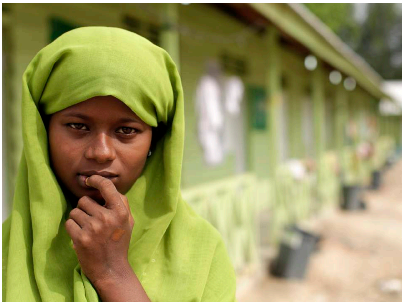
A Rohingya refugee stands in front of her temporary shelter after being rescued by Indonesian fishermen from a sinking smugglers' boat in May 2015. At least a dozen passengers from the boat drowned or were killed during a vicious fight for drinking water.

Overland, hundreds of Rohingya are believed to have crossed by foot, bus, and train from Myanmar and Bangladesh to India in 2016, and UNHCR continues to register new Rohingya arrivals in India. The rate of registration in India, however, has remained steady since the beginning of 2015—before maritime routes through the Bay of Bengal dissipated—suggesting that recent overland movements are a continuation of previous movements along the same overland route, rather than a new alternative to maritime movements. A limited number of Rohingya, possibly in the hundreds, have also reportedly found means to fly to Malaysia for between USD 4,500 and USD 6,600 or to Saudi Arabia for up to USD 8,300.