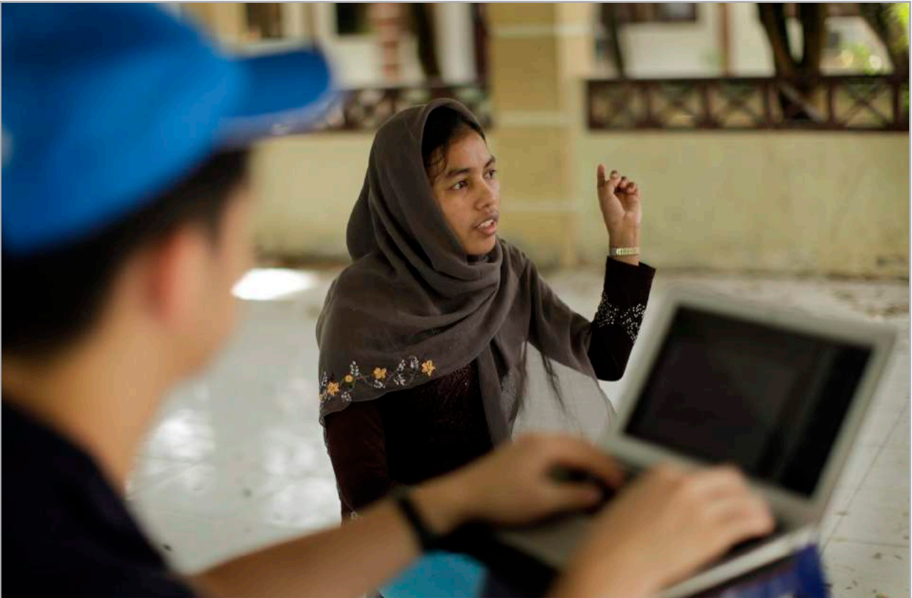
UNHCR's Maritime Movement Monitors interview a refugee in the temporary shelter in Aceh, Indonesia, where she and her brother lived after being rescued by Indonesian fishermen from a sinking smugglers' boat in May 2015.

As the root causes of refugee flows out of Myanmar have not been resolved, the absence of maritime movements by refugees in 2016 is attributable to intensified interdiction efforts (particularly in Bangladesh and Thailand), greater awareness of the risks of the journey, and lack of legal status in traditional destination countries. At the same time, the costs for viable air and land routes are prohibitive. Legal pathways remain scarce.