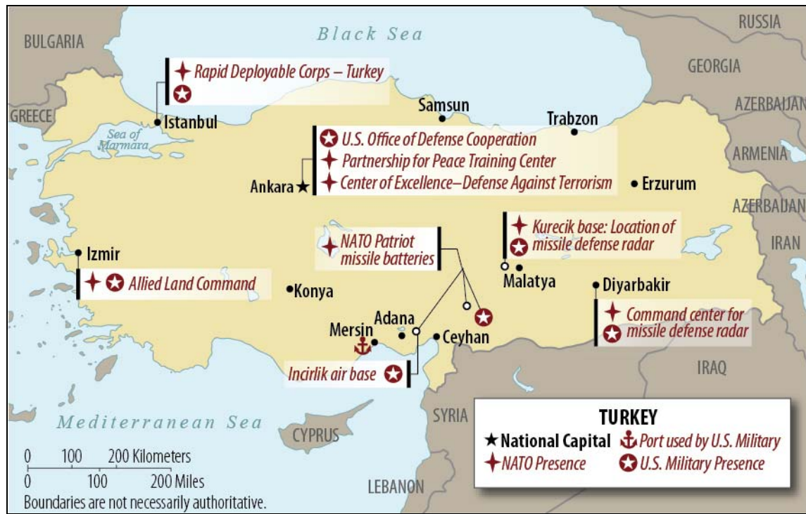
Figure 2. Map of U.S. and NATO Military Presence in Turkey