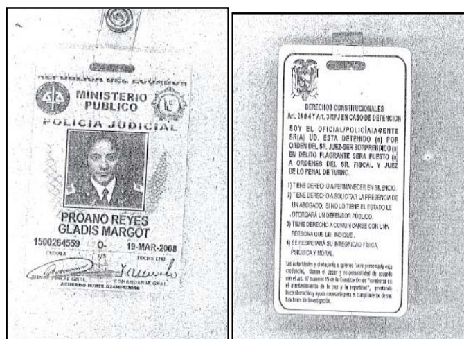
Table 3 Card setting out the rights of arrested persons*

* [Constitutional Rights, art. 24 # 4 and art. 3 of Judicial Police regulations when making an arrest. I am an officer/police officer/agent (name). You are being arrested by order of the magistrate/while committing a crime. You will be placed at the orders of the public prosecutor and the duty criminal magistrate. (1) You have the right to remain silent. (2) You have the right to an attorney. If you do not have one, a public defender will be provided by the State. (3) You have the right to contact a person of your choice. (4) Your physical, moral and mental integrity will be respected. Authorities and citizens to whom this credential is presented have a duty and responsibility under point 15 of Art. 97 of the Constitution to “contribute to the maintenance of peace and security” by providing whatever collaboration and assistance may be required for the bearer to carry out his or her investigative functions.]