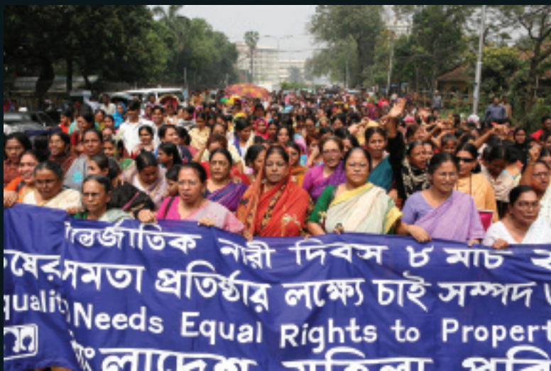
The members of Bangladesh Mahila Parishad, a leading women’s rights organization, attend a rally to mark International Women’s day in Dhaka, Bangladesh on Saturday, March 8, 2008. The banner reads “International Women’s Day rally. Gender equality needs equal rights to property and resource.”

The Bangladesh government has taken small but concrete steps toward law reform recently. This report highlights the demands of women’s rights groups in Bangladesh for law reform and calls on the government to forge ahead with reforms, amend family court procedures, and improve social assistance programs to meet the profound needs of many divorced and separated women.