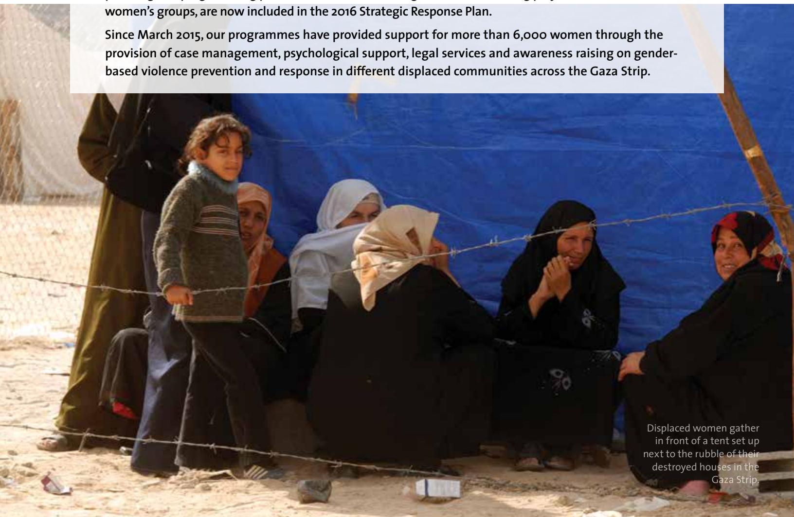
Displaced women gather in front of a tent set up next to the rubble of their destroyed houses in the Gaza Strip.

Since March 2015, our programmes have provided support for more than 6,000 women through the provision of case management, psychological support, legal services and awareness raising on gender-based violence prevention and response in different displaced communities across the Gaza Strip.