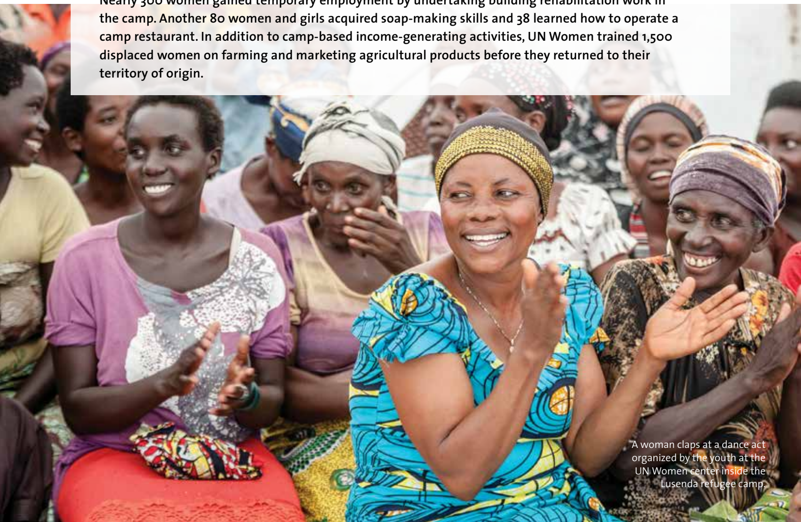
A woman claps at a dance act organized by the youth at the UN Women center inside the Lusenda refugee camp.

UN Women also offers livelihood and income generating opportunities. With our assistance, 264 women refugees contributed to camp food security after attending training on growing vegetables. Nearly 300 women gained temporary employment by undertaking building rehabilitation work in the camp. Another 80 women and girls acquired soap-making skills and 38 learned how to operate a camp restaurant. In addition to camp-based income-generating activities, UN Women trained 1,500 displaced women on farming and marketing agricultural products before they returned to their territory of origin.