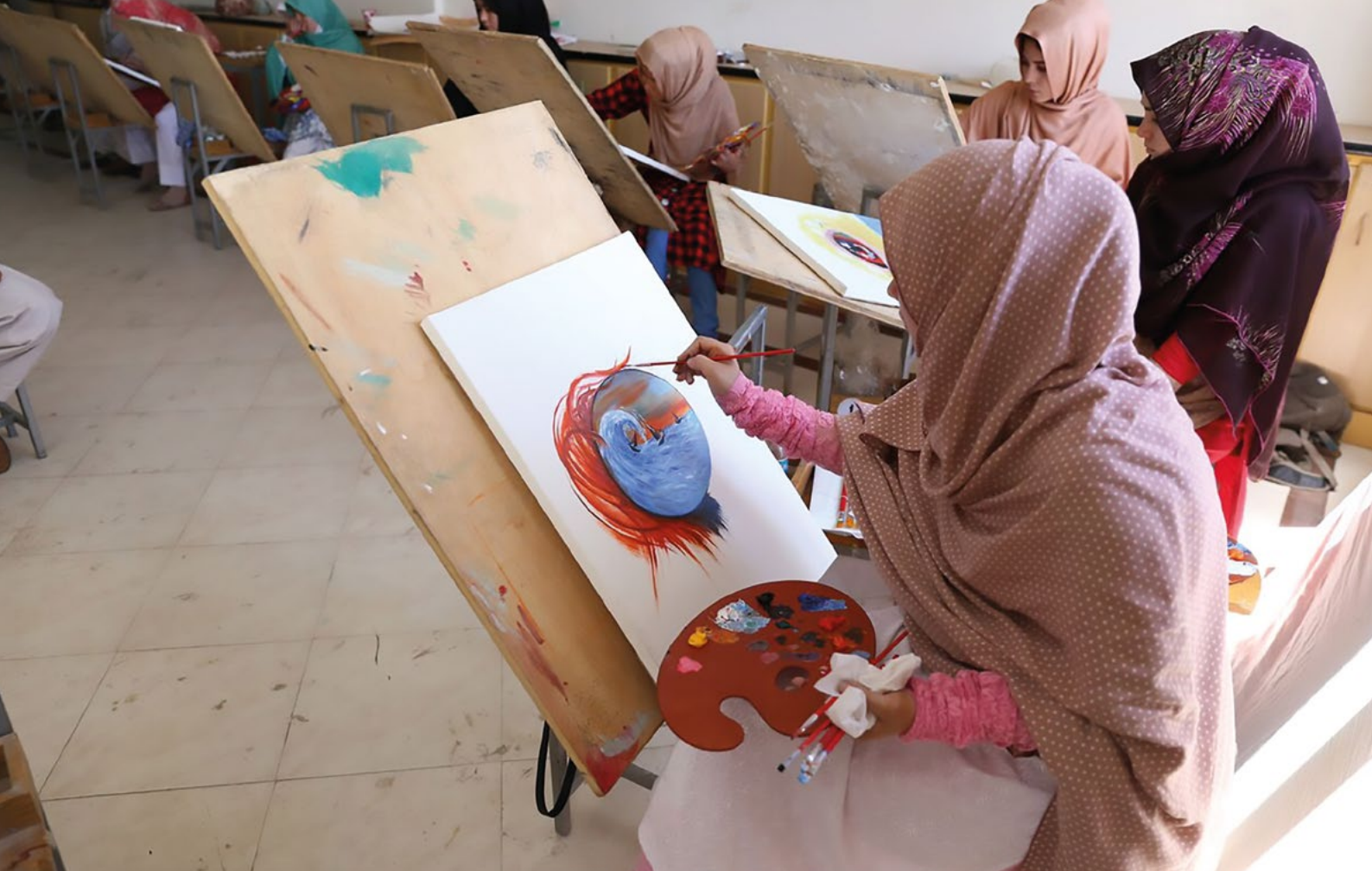
Afghan and Pakistani youth participating in a 2017 World Refugee Day painting contest.