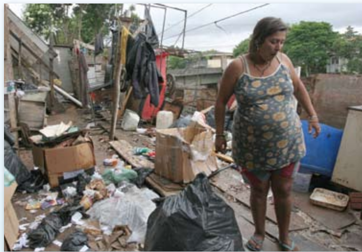
Carina Wint / UNFPA

Mental, physical health and social conditions are three vital strands of human life that are deeply interdependent and interconnected. The prevention and treatment of mental health problems is not only critical to general well-being, but also necessary to prevent problems relating to sexual and reproductive health.