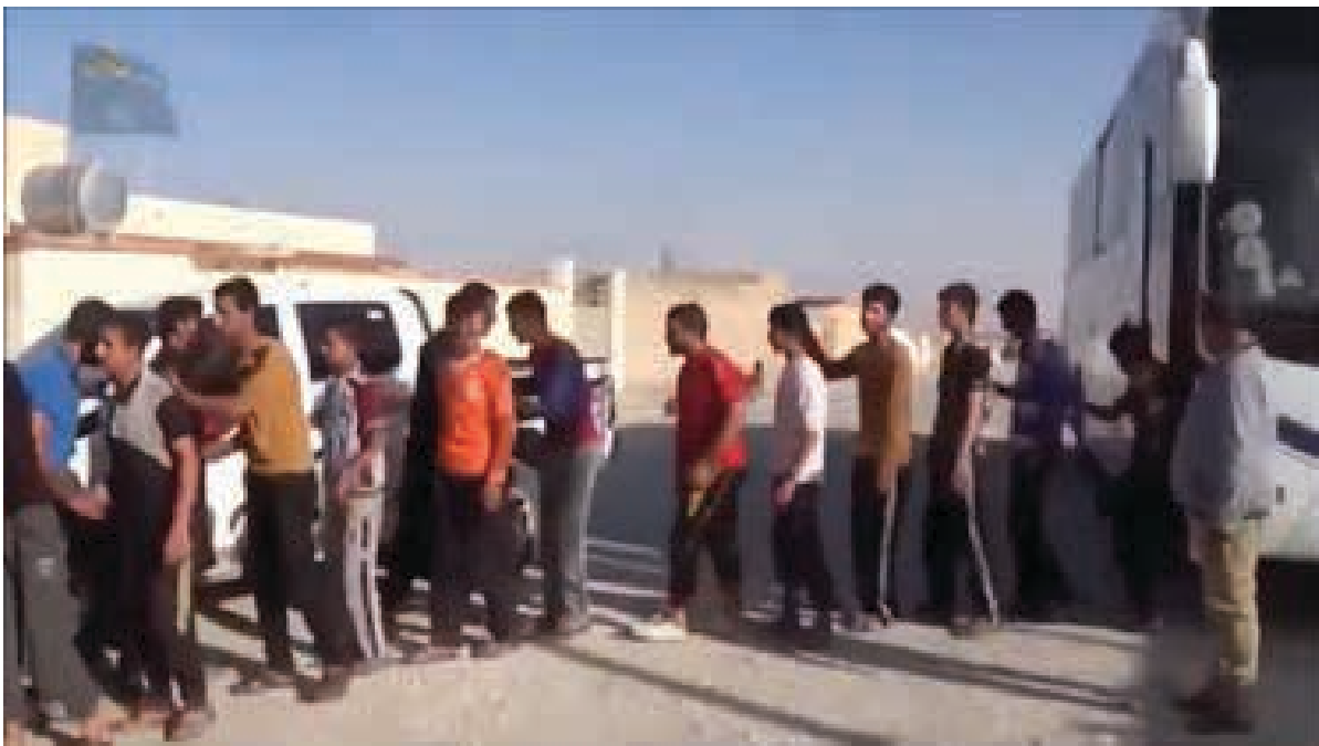
Hundreds of Yazidis arriving in buses to ISIL controlled bases after being forced to convert to Islam. 43

Following the attack on Sinjar, ISIL developed an ideology on the Yazidis and revealed it to the world. Various written guidelines, booklets and newsletters boasting about, and seeking to religiously ground and legitimise the captivity and enslavement of women, girls and children, as well as the execution of Yazidi men, were released. In parallel, online media channels celebrated the conversion of hundreds of Yazidis to Islam and shared footage of “receptions” welcoming the arrival of buses carrying the newly-converted Muslims into ISIL held territories. 42