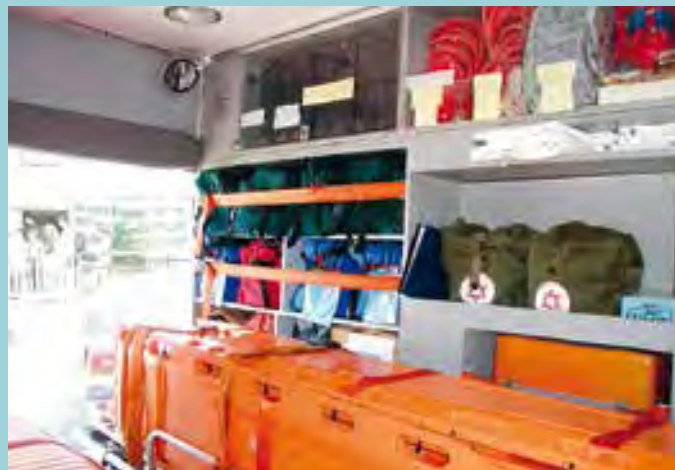
Equipment and supplies carried by the vehicle