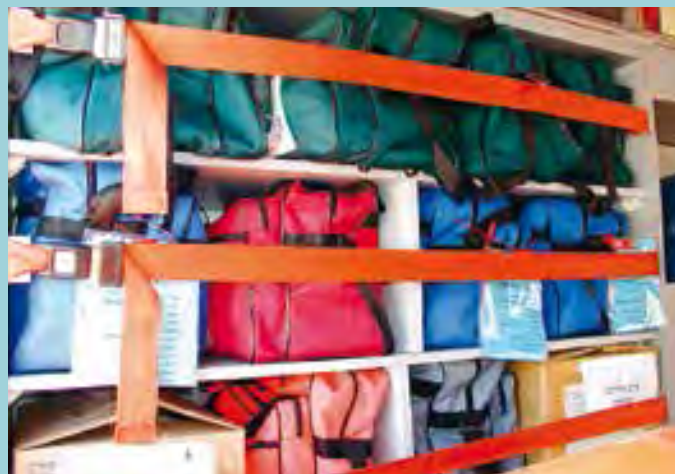
Equipment bags for emergency medical technicians and paramedics