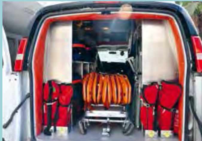
Spinal boards for moving people with suspected spinal injuries