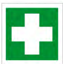
A widely used symbol for first aid

The Misión Médica symbol in Colombia, the sign for all health-care services in the country – created from Resolution 4481, which adopted the Manual de Misión Médica , or the Medical Services Manual . In Colombia, health-care personnel and facilities are collectively known as the misión médica or the ‘medical mission’. The manual is aimed at adopting and implementing a system to strengthen respect and protection for the medical mission in Colombia during armed conflict and in other situations of violence.