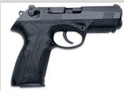
A PX4 Storm semi-automatic pistol