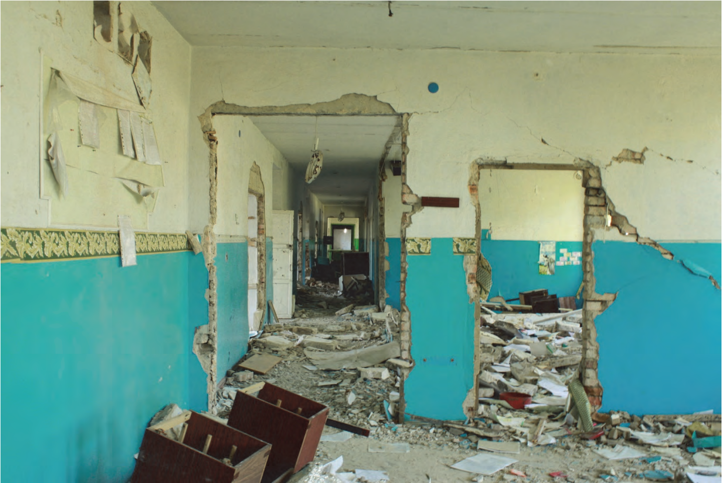
Damaged school in Nikishine Rebel fighters deployed inside the school between September 2014 and February 2015 and exchanged intense fire with Ukrainian forces.

In Ukraine, since 2014, armed groups have shelled schools, destroyed resources, and forced schools to close during the conflict. Even when schools re-opened in an attempt to continue, merging students led to overcrowding, some schools operated on a double-shift system, and the number of teaching hours for children has been reduced. 175