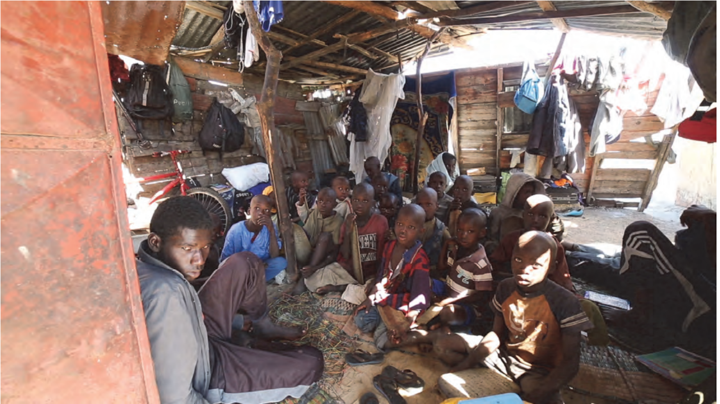
This open-air shack in Saint-Louis, a town in northern Senegal, serves as a so-called “Quranic school,” a typical example of the inhumane conditions in many such schools.

Governments should ensure children are protected from economic exploitation and from performing any hazardous work, or work which interferes with compulsory education, or impacts on their health or development. 211 An effective response to child labor requires a complex guarantee of multiple rights. To enforce children’s right to education, governments must also put equal effort into other areas, including social protection