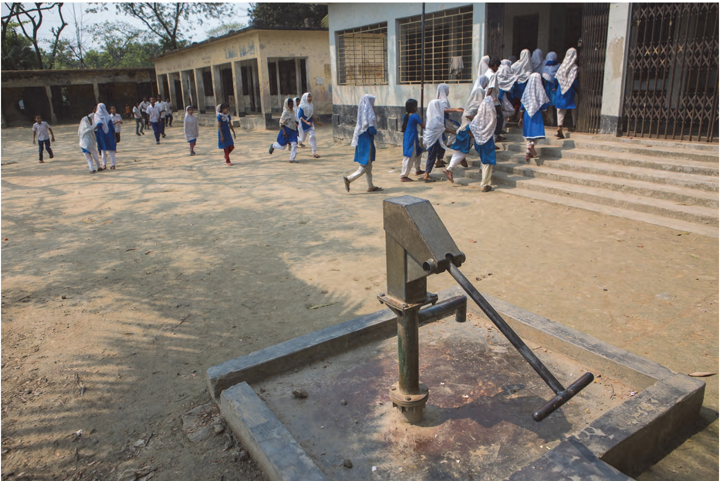
A broken-down and unused government tubewell in a school playground. When Human Rights Watch visited Iruain in July 2015, the village was without any government-installed functioning and publicly accessible water points. Iruain (Laksam Upazila in Comilla District), Bangladesh. March 6, 2016

In Nepal, Sunita, age 19, told Human Rights Watch, “The government should build toilets in schools. We had a toilet, but it was not good. If there are proper toilets, girls will feel better when they are on their periods and have to change their pads. Many girls stay home during their periods. They were marked absent and wouldn’t be able to learn. They couldn’t catch up because the course would have moved on. They would try to sit with their friends and catch up, but the teacher wouldn’t repeat [information]. Some of them left school because of this. Some got married then, some did not.” 159