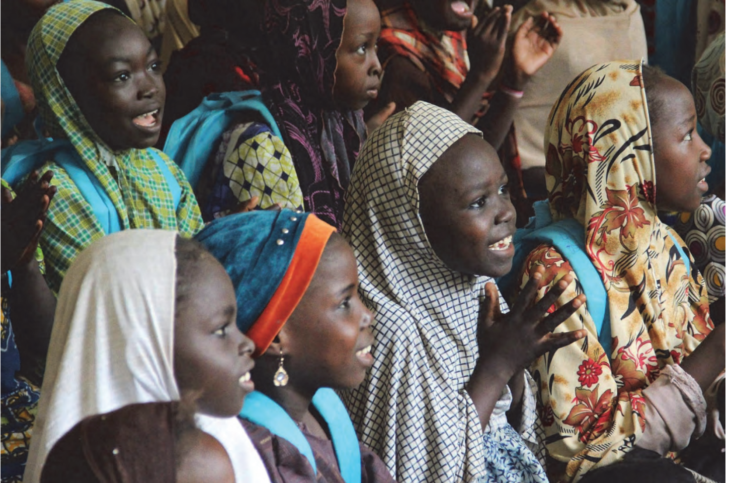
Internally displaced children attending classes at a displacement camp in Maiduguri, Borno state, September 2015.

In many cases, girls and boys are also targeted by armed groups where those groups aim to attack or destroy government institutions. In cases where governments must adopt army-led interventions to tackle such attacks, they must always plan those with critical human rights and protection concerns in mind to protect all civilians, and refrain from using schools for military purposes. 191