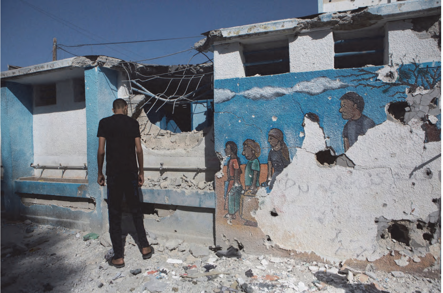
Damage at the Jabalya girls school on July 30, 2014, after an Israeli attack killed 20 people, including three children.

During times of conflict and insecurity, maintaining ongoing access to education is of vital importance for children. If they remain safe and protective environments, schools can provide an important sense of normality that is crucial to a child’s development and psychological well-being. Schools can also help provide important safety information and services. 232