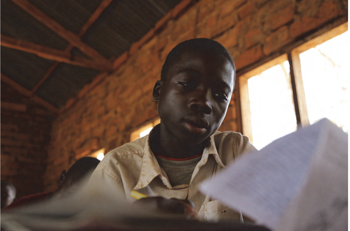
A 13-year-old boy, who mines gold, attends classes in a small-scale mining area in Mbeya Region. Work in mining impacts children's performance and attendance at school.

studied to class six and married at age 14. She told Human Rights Watch: “My father stopped my schooling because he could not afford my fees, stationery, and uniform.” 63