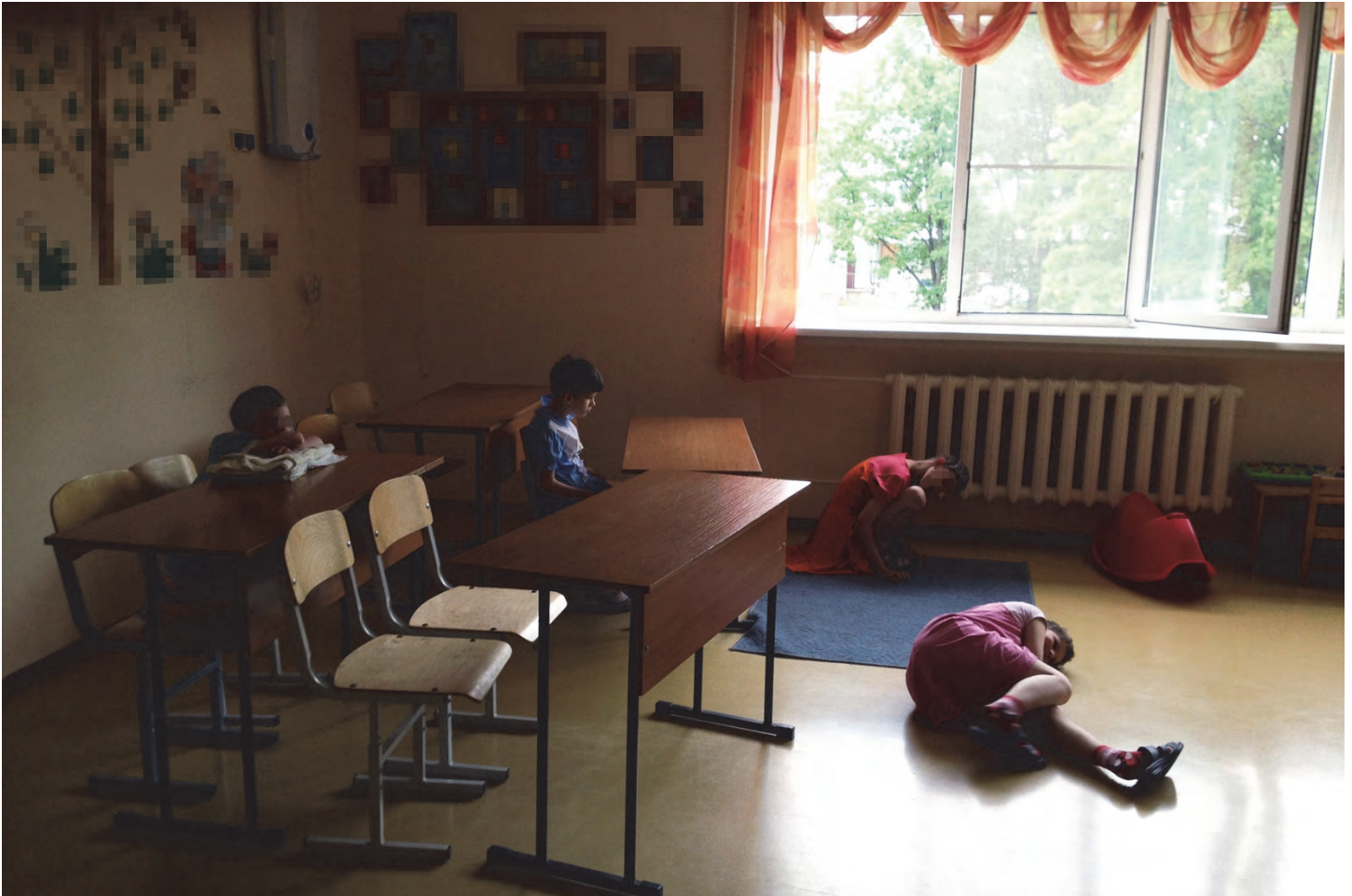
A group of girls, ages 10 to 15, in an orphanage for children with disabilities in northwest Russia. Many children in “specialized” orphanages spend their days seated in rooms with minimal attention from staff, who often lack training and other resources to engage children in activities appropriate to their ages and disabilities.

development, assuming they would not be able to learn or progress within school. 91 In many cases, mainstream schools do not receive additional budgets to accommodate children with disabilities, or to implement adequate measures to make schools more accessible. 92