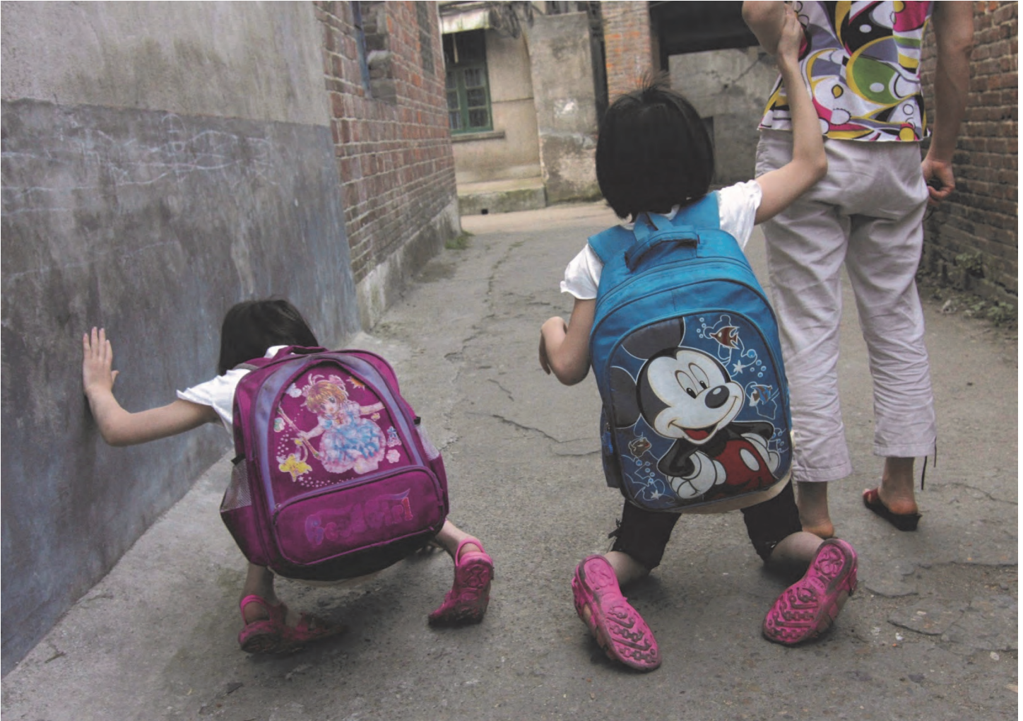
Twin sisters with mobility disabilities making their way to school in China.