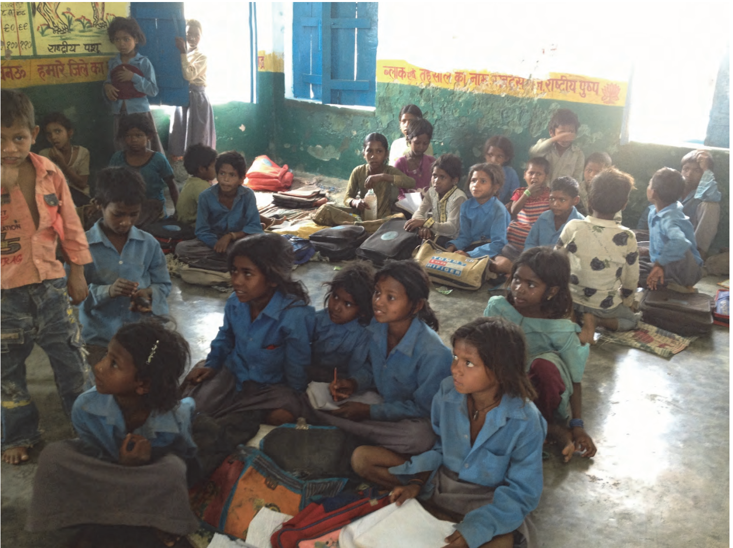
Children from the Ghasiya tribe say they are called “dirty” and are discriminated against by the teachers and other students at a primary school in Sonbhadra district, Uttar Pradesh. All children from the tribe are enrolled in the same grade and sit in the same classroom irrespective of their ages

practices which may have the effect of disproportionately impacting on the right to education of children who require further accommodation, or whose circumstances may not be the same as those of the majority school population. 69 This is particularly the case with children with disabilities globally, or children belonging to minorities, such as the Roma, who may be placed in segregated or specialized schools in countries like the Czech