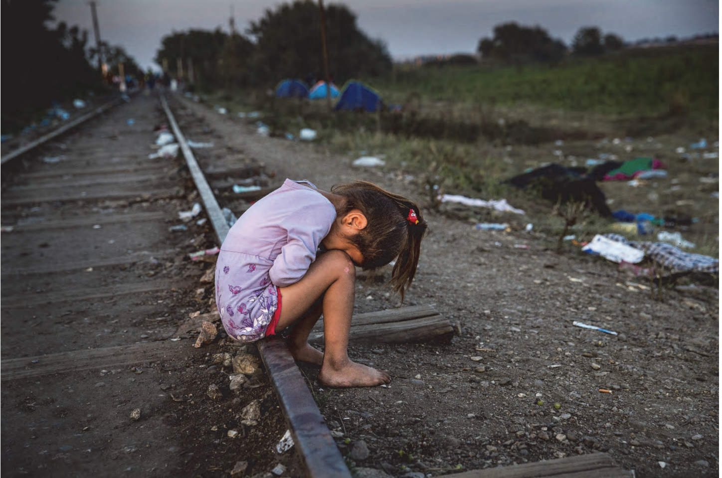
An exhausted child cries on the railway tracks between Serbia and Hungary as night falls, and her family argues nearby whether to cross into Hungary and face temporary detention.

As of June 2015, continued instability and conflict led to the displacement of around 19.5 million refugees worldwide; including over 38 million people who were internally displaced due to conflict. Half of them are children. 238 Conflict in the Middle East and North Africa region alone has driven 13 million children out of school. 239 The ongoing armed conflict in Syria, for example, has forced four million Syrian children out of school for over four