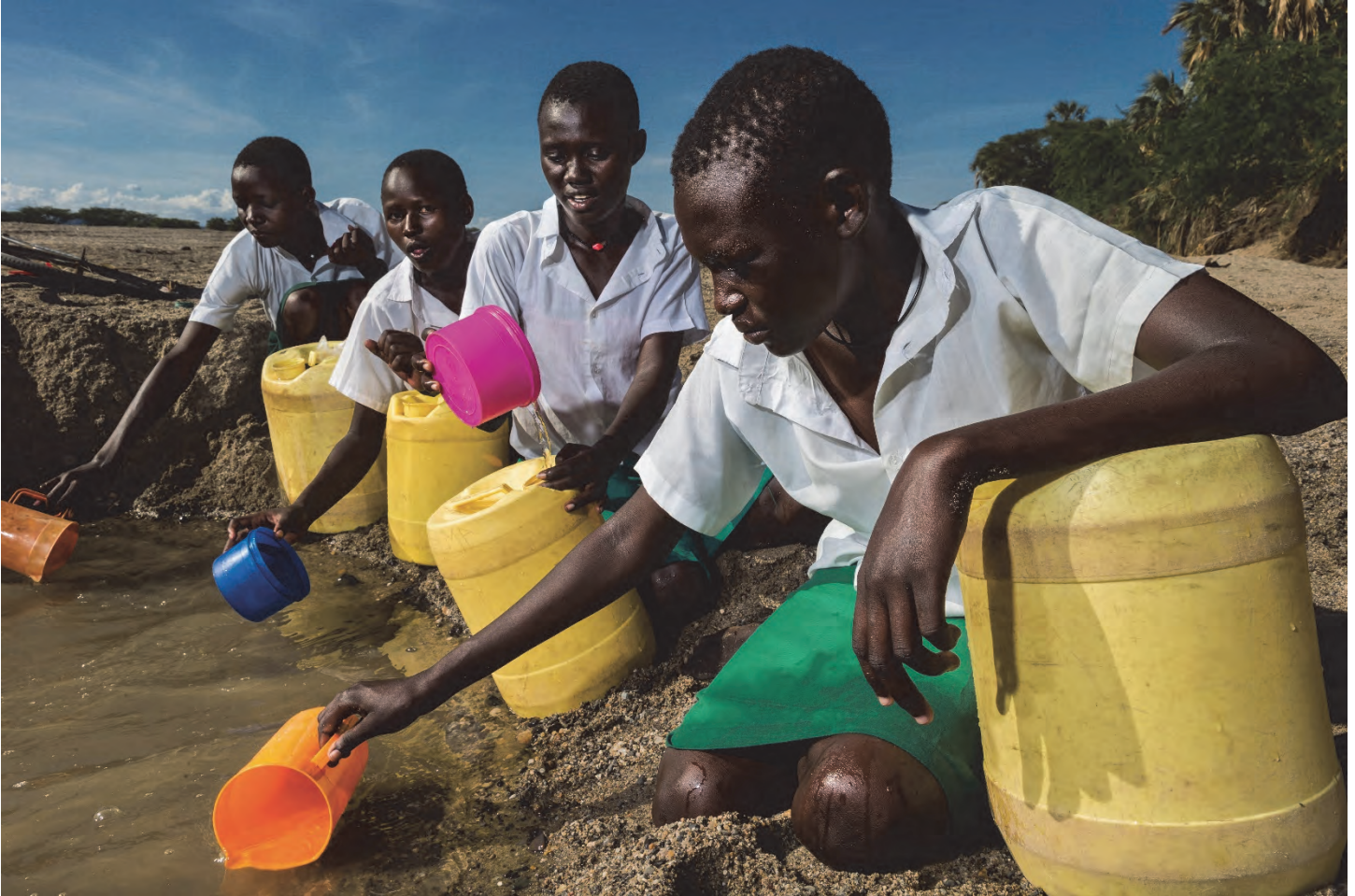
Girls from the Kalokol Girls Primary School fetch water from a dry riverbed to carry back to their school, which does not have access to running water. Nearby Lake Turkana is too saline for human consumption. Women and girls often walk extremely long distances to dig for water in dry riverbeds, exposing them to physical danger and taking time away from their studies. As climate variability increases, women are having to walk further and dig deeper to access potable water.