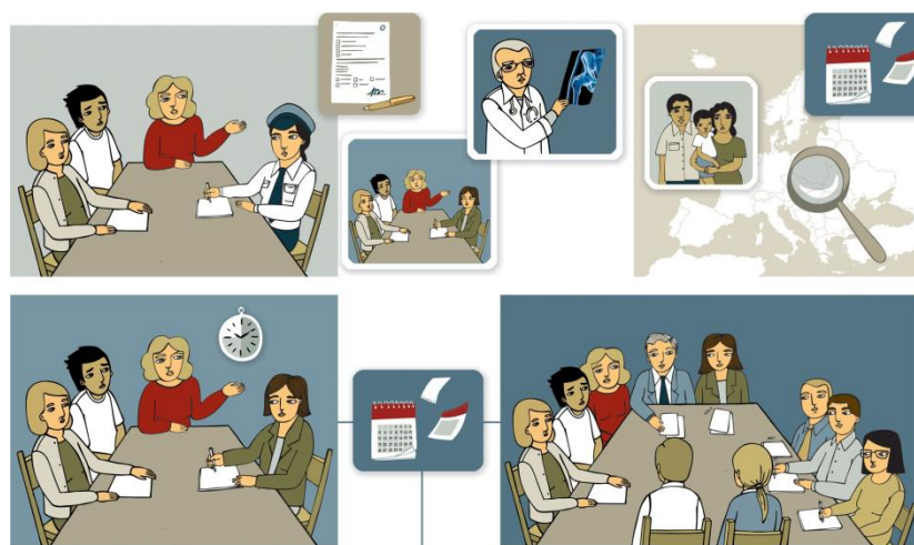
Danish Refugee Council, Visual illustration of the procedure, 2012

In 2012 the Danish Refugee Council published a visual illustration of the asylum procedure in Denmark used as a tool to complement oral explanations. 173