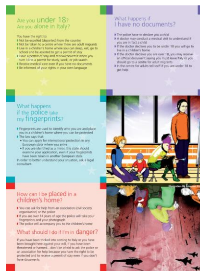
Save the Children Italy, Ministry of Interior, Do You Know Your Rights?, 2013

In Italy , Save the Children produced a leaflet targeted at children “on the move” generally, not only those seeking asylum. It explains, in simple terms, basic rights applicable and the actors who may help unaccompanied children in various situations. It explains for instance the specific rights of children, what happens when children do not have identification documents, what happens after the police takes their fingerprints, who they may contact for help, how to claim asylum or what to do if they have a relative in another European country. The leaflet was revised and updated in 2013 to be used in information activities at the borders (see below). It is available in Italian, English, French, Arabic, Tigrinya (Eritrean language), Somali, Farsi and Bengali. 178