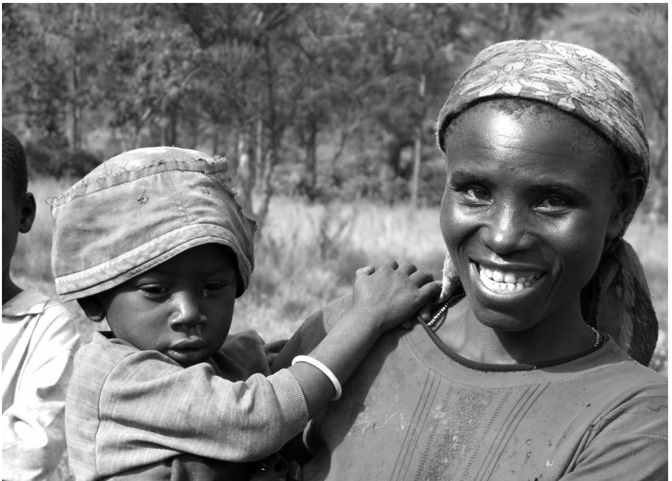
BATWA WOMAN AND CHILD IN BURUNDI.

It is clear from the results of the research in all four countries that Batwa women and girls are marginalized