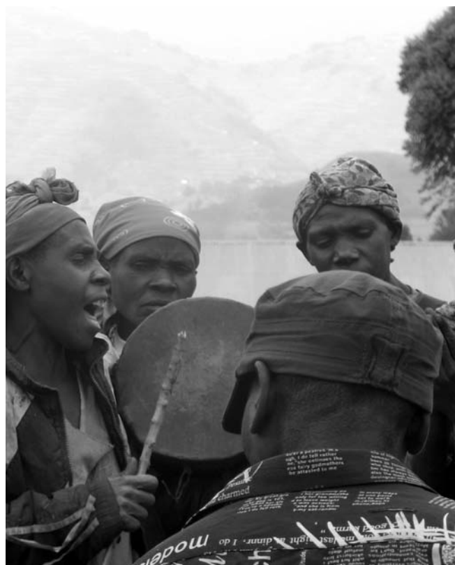
BATWA WOMEN SINGING.

The attitude of Batwa parents in the DRC to education of girls is closely tied up with attitudes towards marriage and the role of girls in society. One parent said, ‘Women were created to be married, have children and to look for food and not to spend time in front of men studying.’ Another parent’s response was, ‘According to the Pygmies, a girl who goes to school and reaches secondary level is considered a free woman, i.e. a whore, because she might not get a husband within the community.’ The responses of other parents and teachers indicate that the financial implications of marriage, i.e. a dowry given to the girl’s family, encourage early marriages and discourage education. According to one parent, ‘Pygmy parents don’t expect to live long so their daughters must get married quickly for fear of being abandoned by the young men in the villages but also so as to use up the dowry before they die.’ Another parent said, ‘The more a girl studies, the less chance she has of getting married,’ and a teacher’s view was, ‘Women encourage their daughters to get married quickly so that they can get a few goats to eat as a dowry.’