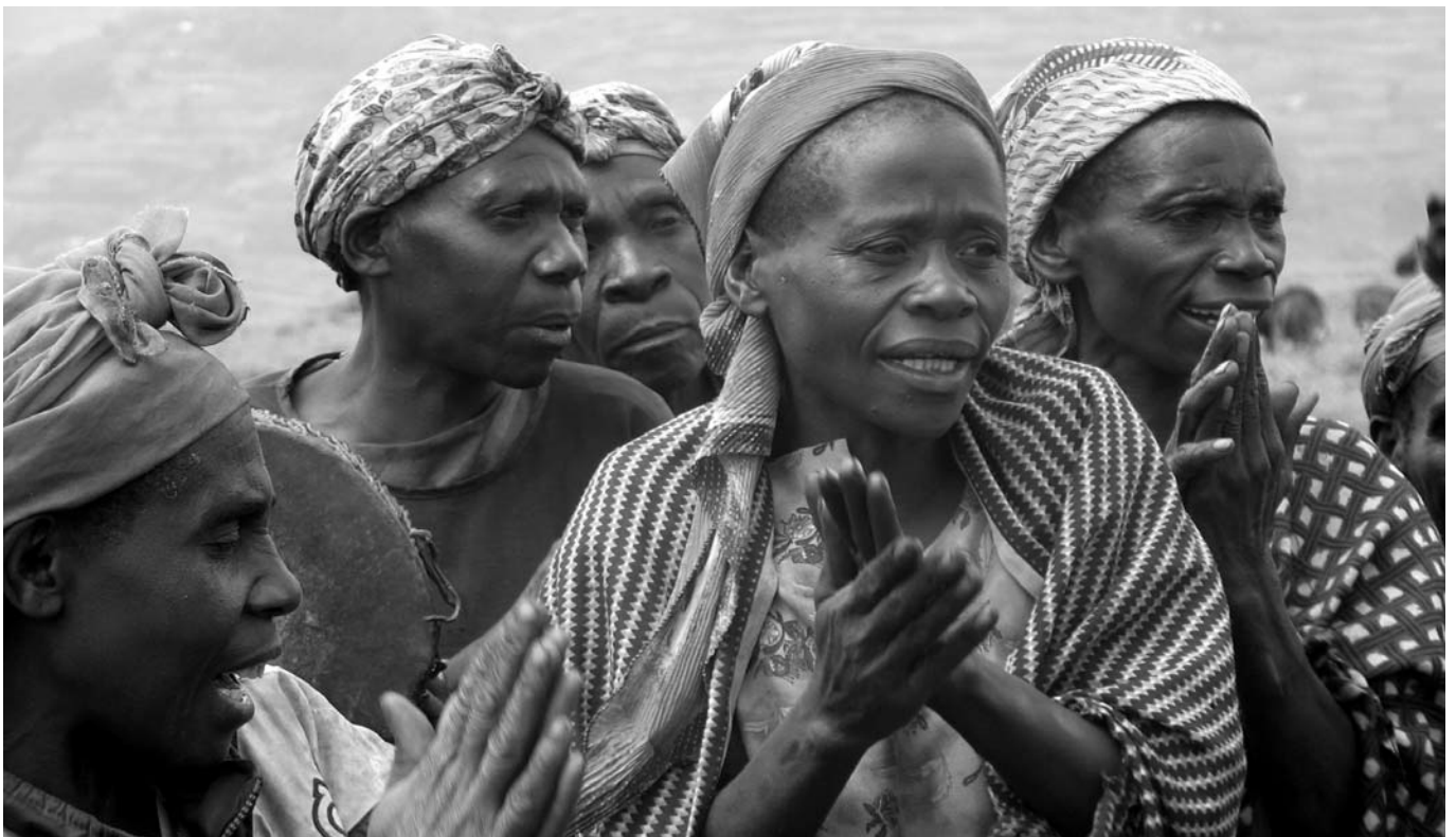
BATWA WOMEN IN UGANDA.

MRG has worked with Batwa non-governmental organization (NGO) partners to establish areas of particular importance, and highlight the need for more comprehensive official data to help inform outreach programmes and policies. The unique investigations conducted in four countries, albeit on a small scale, identify and analyse some of the problems Batwa women and girls encounter, as conveyed by Batwa communities themselves. In particular, they focus on lack of access to education and worrying proportions of gender-based violence.