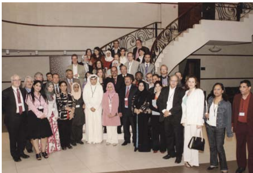
IFJ regional meeting, Amman, October 2009.

In late 2009, the press echoed assertions of bribery involving the Jordan Petroleum Refinery Company (JPRC) and chief national figures. The government opened a criminal investigation, but in March 2010, the Jordanian State Security Court forbade the media reporting on the case without its authorisation.