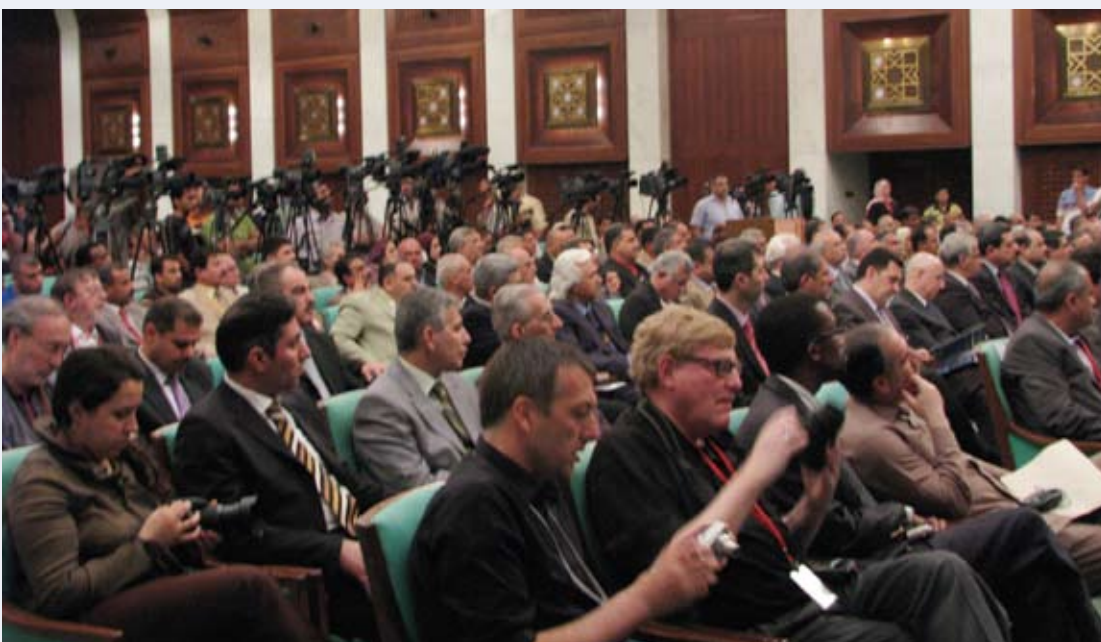
IFJ-IJS Iraqi Journalism Summit, Baghdad 23-24 May 2009.

Journalists continued to face charges from politicians who did not understand the role of media in a democracy and physical attacks from police forces and security escorts. This led to angry demonstrations by Iraqi journalists organised on