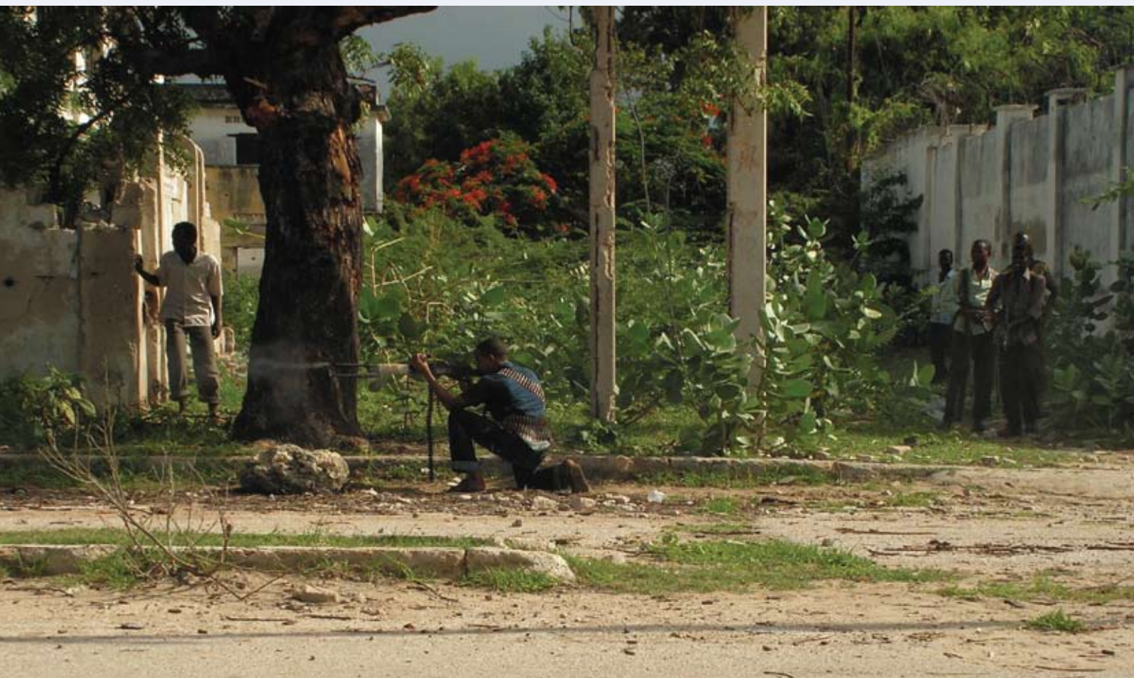
Journalist takes cover behind a wall as fierce fighting captures him in the crossfire.

NUSOJ Annual Press Freedom Report http://www.nusoj.org/2009%20ANNUAL%20REPORT-NUSOJ%2031.12.09.pdf