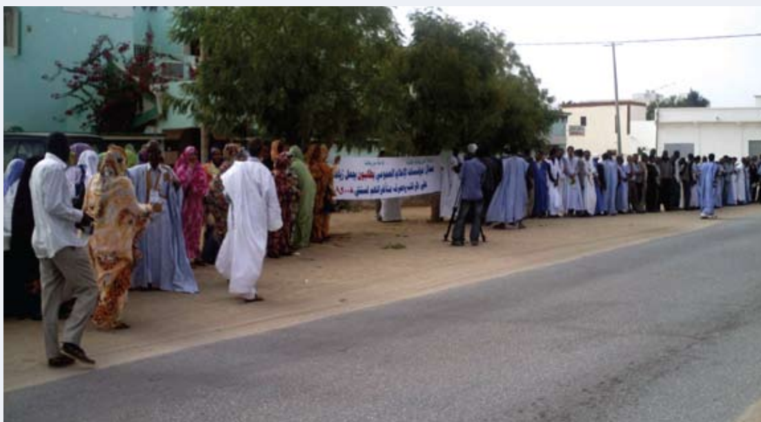
Demonstration in support of journalists at the Mauritanian TV and Radio, 14 April 2010.

The Mauritanian Journalists' Syndicate was created in April 2008 and organised its first congress on 18 and 19 December 2009. A