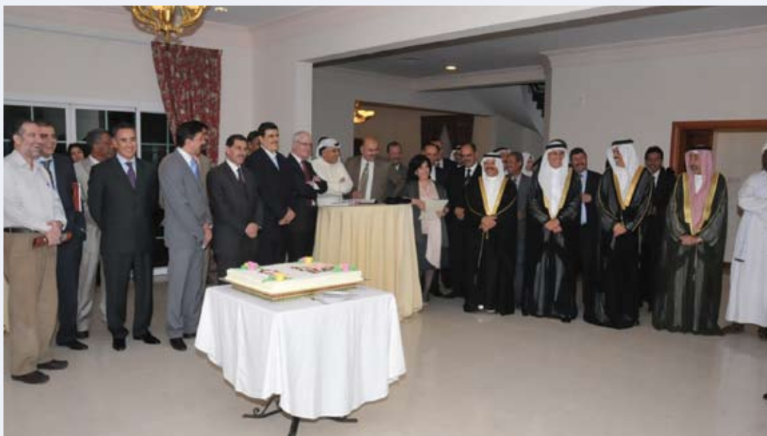
Opening of the IFJ Office in Bahrain, April 2009.

Since the coming into power of the new monarch in 1999, there have been no journalists jailed in Bahrain. The few defamation cases brought against journalists resulted in fines. In addition, the Bahraini Journalists Association (BJA), an IFJ affiliate, has secured an agreement with the Prosecutor's office so that a period of two weeks is observed to try resolving lawsuits filed against journalists through mediation. This resulted in the resolution of a number of cases in 2009 and 2010 away from the courts. The public prosecutor's office also issued a "circular" No.14 – 2007, which aims at ensuring procedural guarantees to journalists facing penal charges.