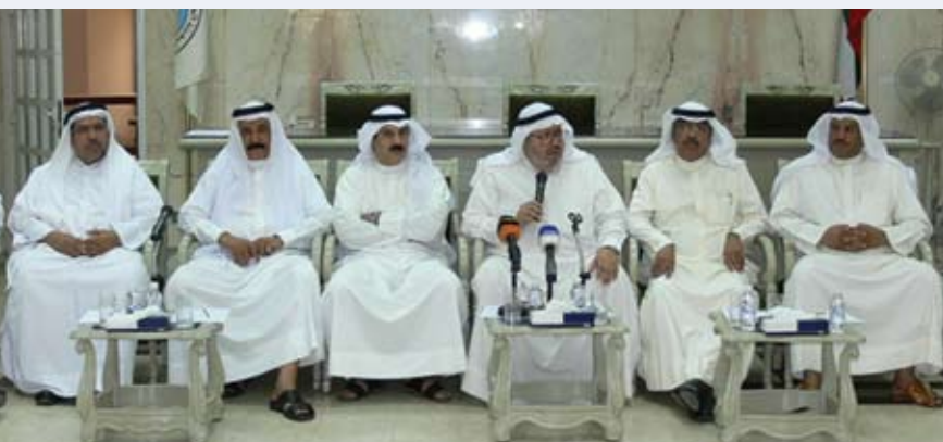
KJA editors' meeting.

For more information visit KJA website: http://www.kja-kw.com