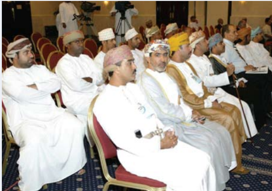
OJA seminar, Muscat June 2009.

Launched in 2004, the Omani Journalists' Association represents Omani and foreign journalists working in the country. It works at defending journalists rights in the