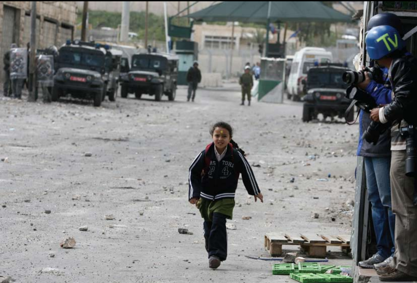
A young girl walks past journalists covering clashes between Israeli forces and Palestinian demonstrators in the Shufat refugee camp in Jerusalem on March 16, 2010.