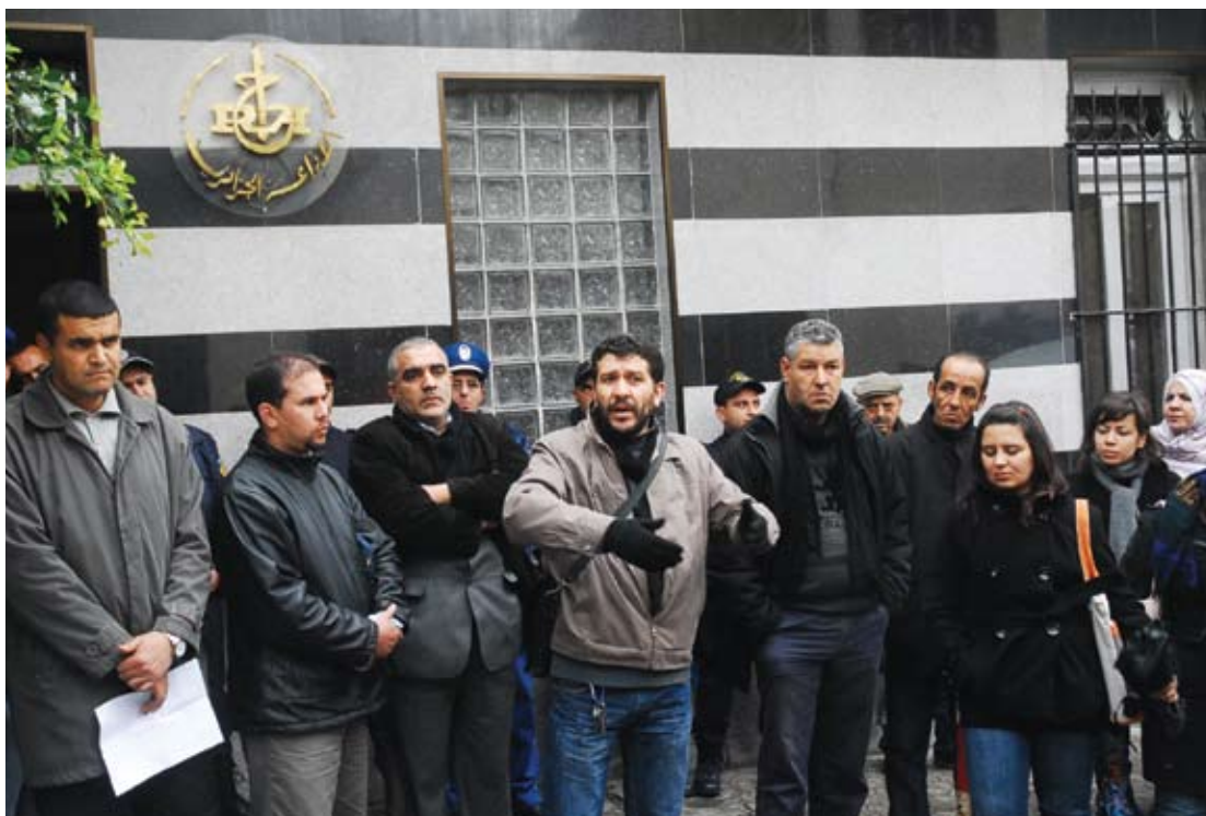
Journalists in strike at the Algerian Radio headquarters.

Journalists working conditions have been a major challenge for Algerian journalism. The social and material uncertainties in which Algerian journalists live continue to affect the independence and quality of journalism in the country. The lack of a national collective agreement in the sector has exposed