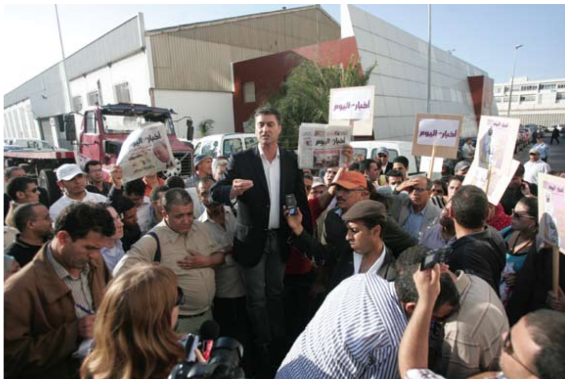
SNPM demonstration on 2 October 2009, at the headquarters of Akhbar El Youm newspaper in Casablanca.

The same month, the offices of the daily Akhbar al Youm , were cordoned off by the police who prevented staff from entering. Meanwhile, director Tawfiq Bouachrine and cartoonist Khaled Kadar were interrogated for 48 hours. These actions followed the publication of a cartoon depicting the wedding of a member of the royal family, Prince Moulay Ismail.