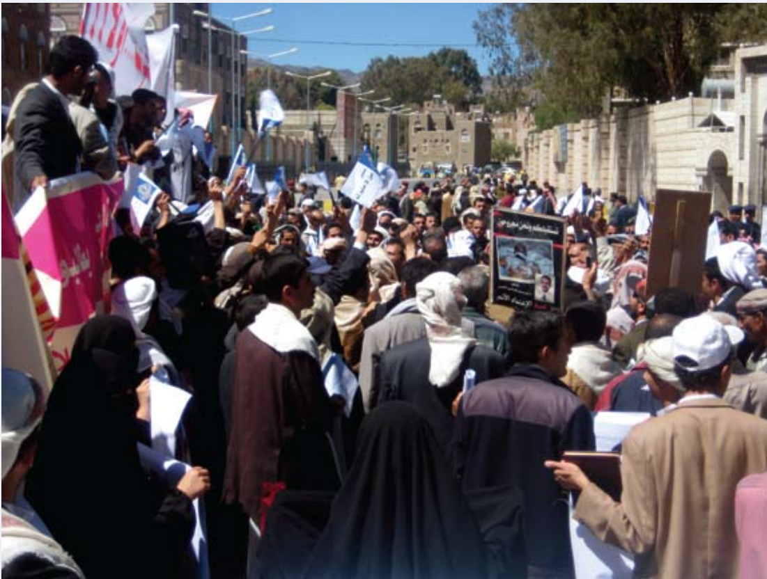
Demonstration in front of the YJS headquarters against raids on the offices of Al Jazeera and Al Arabiya satellite channels and confiscation of their broadcasting equipment, Sanaa 13 March 2010.

On 4 and 5 May 2009, Yemeni authorities carried out raids on independent media in the country seizing thousands copies of Al Diyar , Al Share , Al Masdar , Al Nidah , Al Mustaqilla , Al Ayyam , Al Ahali and Al Watani newspapers. They also closed down tens of websites. In Aden, the authorities laid siege to Al Ayyam's offices for its reporting of the conflicts and