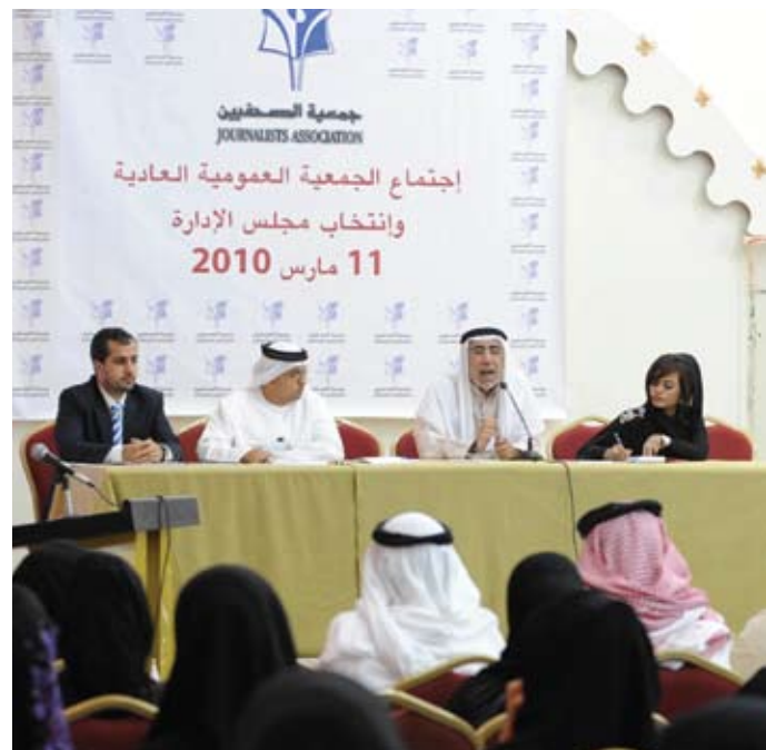
UAE-JA Congress 11 March 2010.

According to the UAE-JA, these delays in adopting the controversial draft gives the impression that the UAE government is carefully reviewing the situation and open to dialogue with the media community and other stakeholders in order to formulate a law that meets journalists' needs and international standards of media freedom.