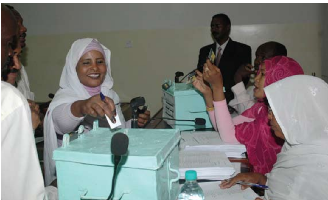
SUJ elections, Khartoum October 2009.

The new press law was eventually passed in June 2009. Although the new bill provides for better protection of media rights than the preceding law, it still allows the authorities to take