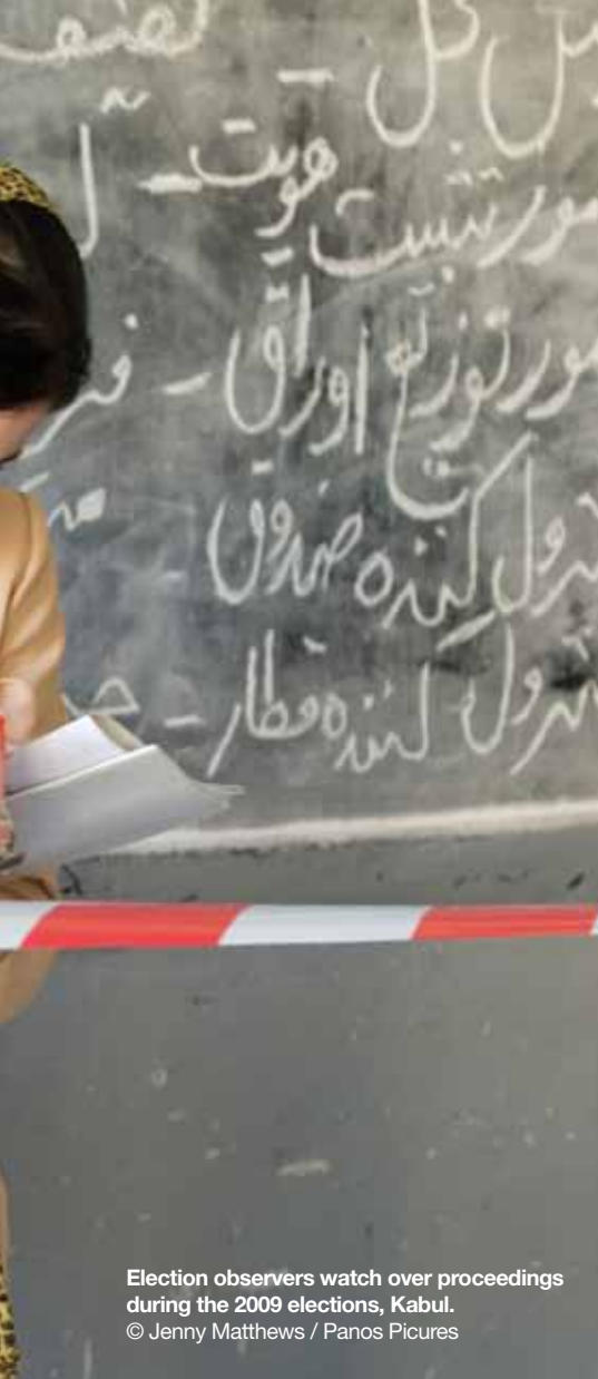
Election observers watch over proceedings during the 2009 elections, Kabul.