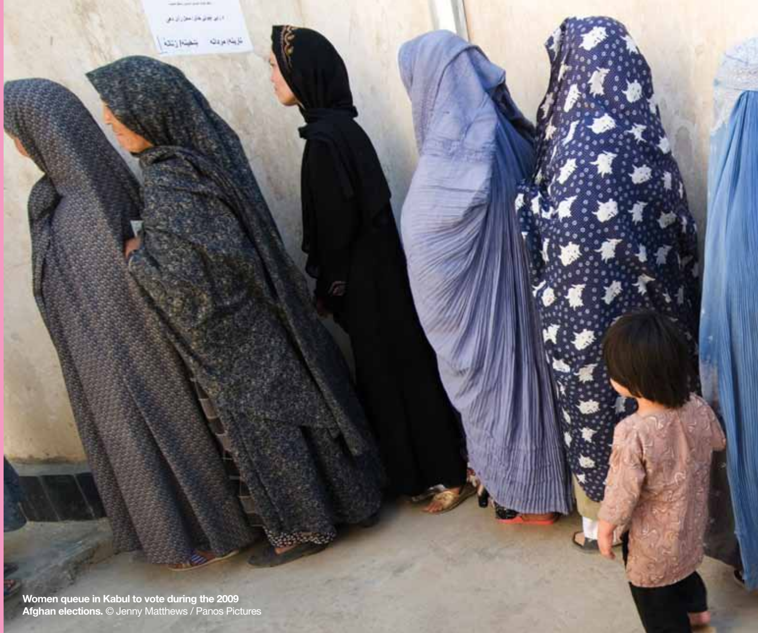
Women queue in Kabul to vote during the 2009 Afghan elections.