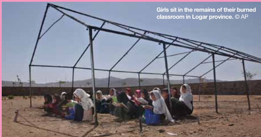
Girls sit in the remains of their burned classroom in Logar province.

The Afghan government has said that Taliban fighters who take part in reconciliation must renounce violence, cut ties with al-Qa'ida and accept the principles of the Afghan constitution, which forbids discrimination and states that men and women are equal before the law. The constitution also guarantees the right of education for all Afghans and the political representation of women in parliament.