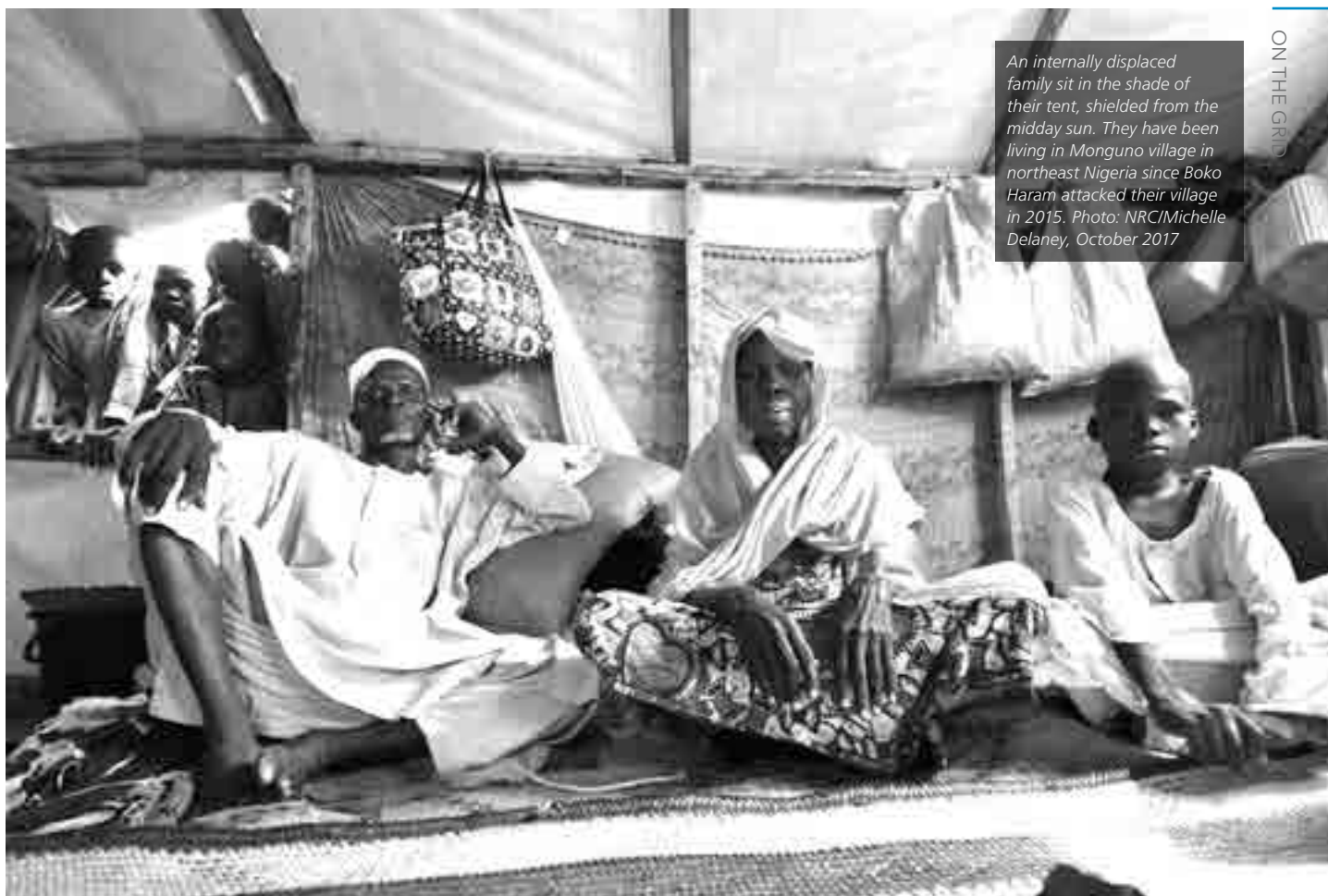
An internally displaced family sit in the shade of their tent, shielded from the midday sun. They have been living in Monguno village in northeast Nigeria since Boko Haram attacked their village in 2015. Photo: NRC/Michelle Delaney, October 2017

conflict and disasters and guarantees their protection. Article 10 also highlights the need to address displacement associated with development projects. 67