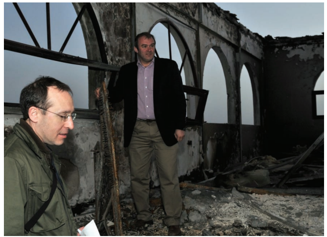
Andy Slaughter MP and Ed Davey MP in the destroyed Gaza Music School

British Foreign Secretary David Miliband called for an investigation into "extremely serious allegations about the conduct of both sides during this conflict," but did not specify what form any investigation should take. 19