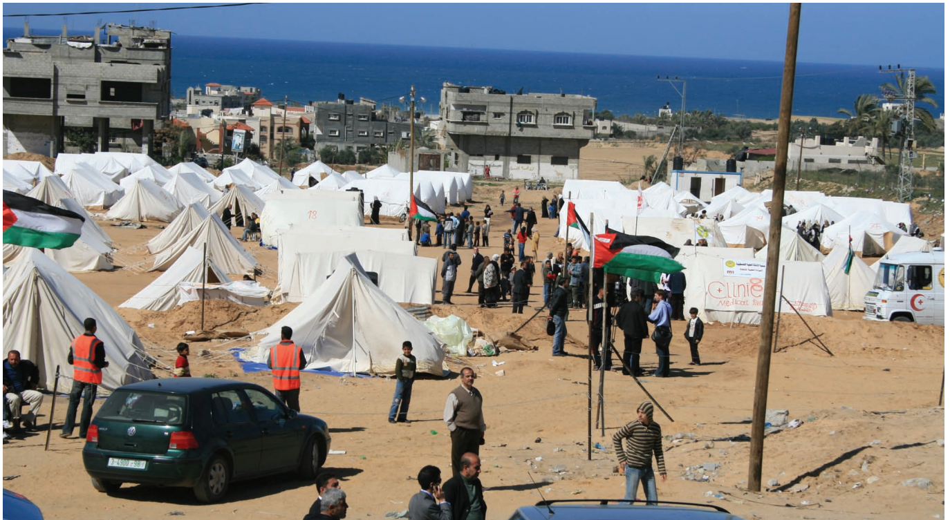
Emergency tent site set up for homeless families on outskirts of Beit Lahiya

The delegation was told that white phosphorous had been used during Israeli military strikes at Al-Quds Hospital and at Al-Wafa Hospital (see 1.10 below).