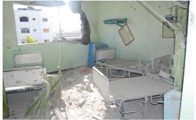
Damage within Al-Wafa Hospital