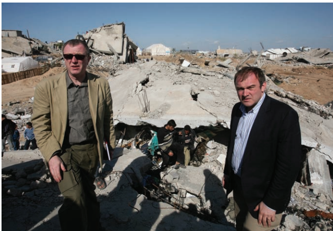
Richard Burden MP and Ed Davey MP in Izbit Abed Rabbo, Gaza

Izbit Abed Rabbo lies less than 1 km from Israel, and when the delegation visited on 16th February, not a single building in the town of 5,000 inhabitants had been left standing. The town came under continued aerial bombardment, before Israeli ground forces dynamited the homes and used bulldozers to flatten any remaining buildings. Residents told the delegation that 200 people had been killed in the town. Many of the town’s inhabitants are now living in tents near to the rubble of their former homes, with 90 percent relying on the UNRWA Food Distribution Centre nearby.