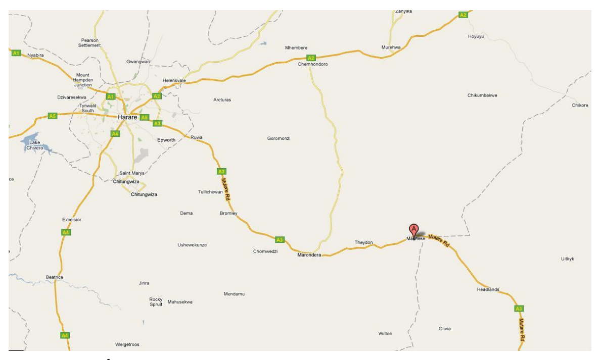
Map 1: Macheke<sup>2</sup>

Macheke is a town in the province of Mashonaland East, Zimbabwe, approximately 100 kilometres southeast of Harare (see map 1). Macheke is located in the Federal electorate of Murehwa South, a district which the ZANU-PF party has held since independence and won again in the March 2008 parliamentary elections (see map 2). The local government area in which Macheke sits, Masvingo, is also held by ZANU-PF. It would be misleading, however, to describe Macheke as a stronghold of ZANU-PF as both federal and local political power has been maintained by ZANU-PF largely through the use of violence and intimidation.