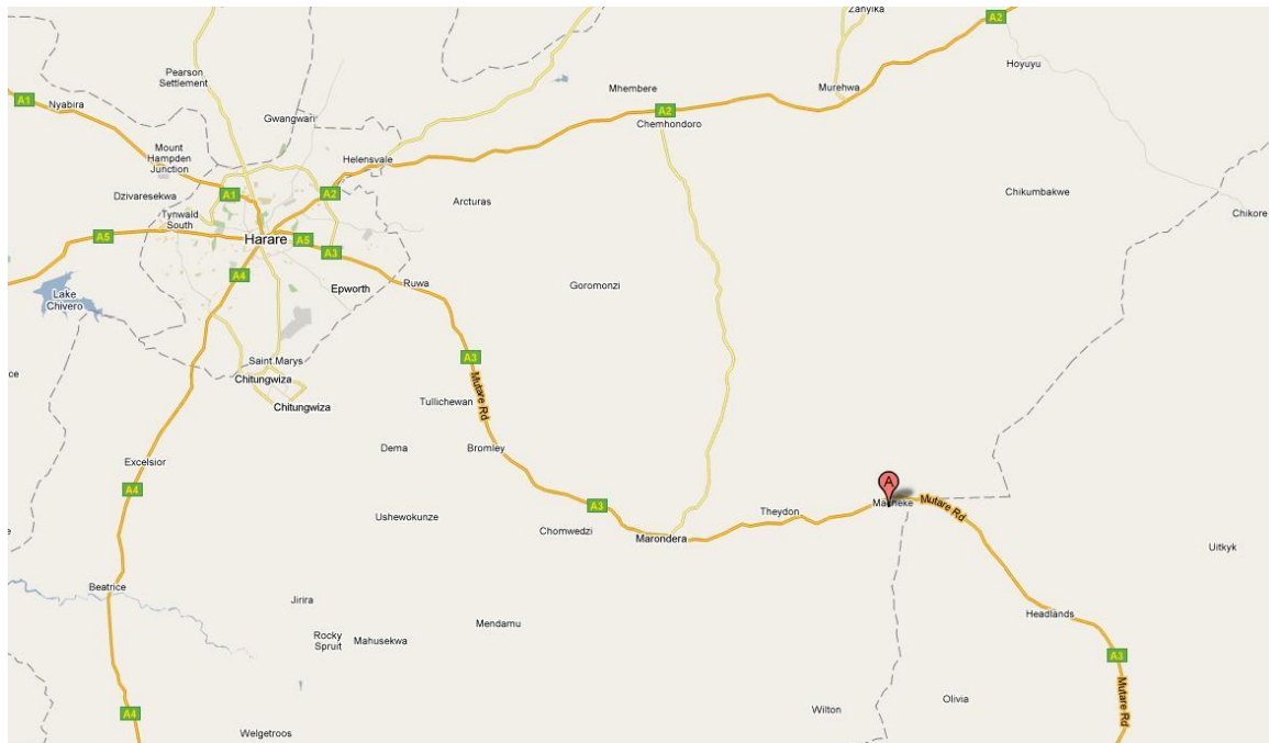
Map 1: Macheke 2

Macheke is a town in the province of Mashonaland East, Zimbabwe, approximately 100 kilometres southeast of Harare (see map 1). 1 Macheke is located in the Federal electorate of Murehwa South, a district which the ZANU-PF party has held since independence and won again in the March 2008 parliamentary elections (see map 2). The local government area in which Macheke sits, Masvingo, is also held by ZANU-PF. It would be misleading, however, to describe Macheke as a stronghold of ZANU-PF as both federal and local political power has been maintained by ZANU-PF largely through the use of violence and intimidation.