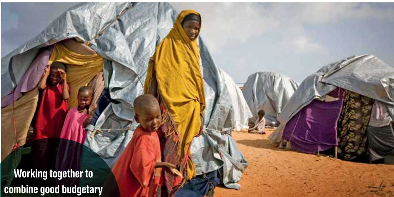
A family stands outside their makeshift tent in BadBado camp in Mogadishu, Somalia

Working together to combine good budgetary practice and an effective humanitarian response as events unfold