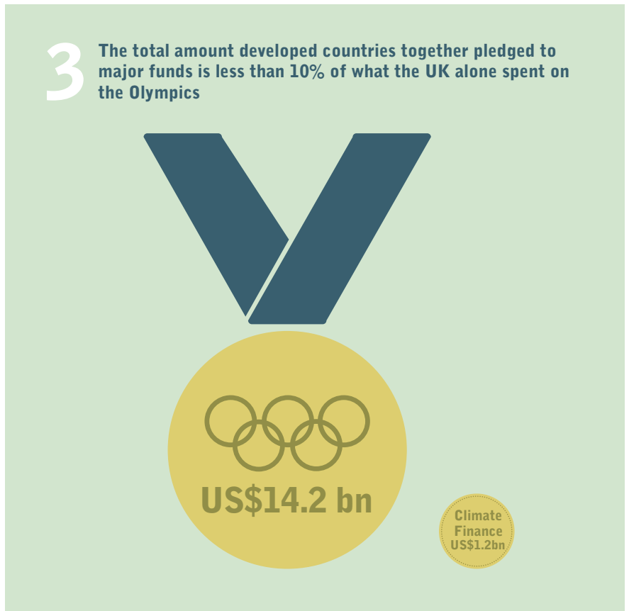
ODI is making more use of infographics, including 10 things to know about climate finance in 2012

Our emphasis on taking the stories to the media resulted in our third year of increased global media coverage. As in previous years, the emphasis was on quality, as well as quantity, including coverage in eminent outlets such as The Economist , Foreign Policy , the Financial Times , The Guardian and The Daily Telegraph , and national