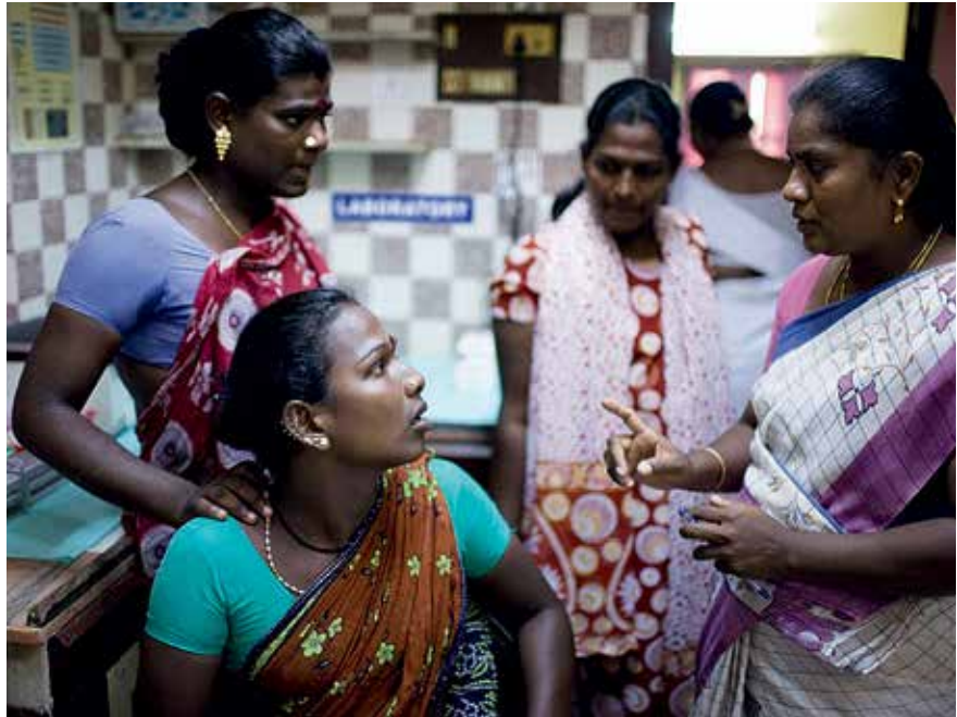
HIV and AIDS peer counselling, India