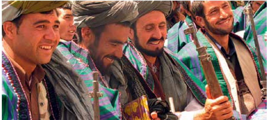
Former Taliban fighters prepare to hand over rifles to the Government of the Islamic Republic of Afghanistan, May 2012

think and act in ways that are politically smart. Demand has grown for the POGO-led training programme on political-economy analysis: in 2012 we worked with DFID, the EC, Plan UK and BBC Media Action to deliver courses and workshops, and to help them design more politically informed programmes and policies.