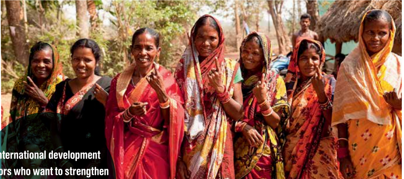
The panchayat elections in Odisha, India, in February 2012, urging women to stand for elections

International development actors who want to strengthen democracies would do well to start by focusing on parliaments