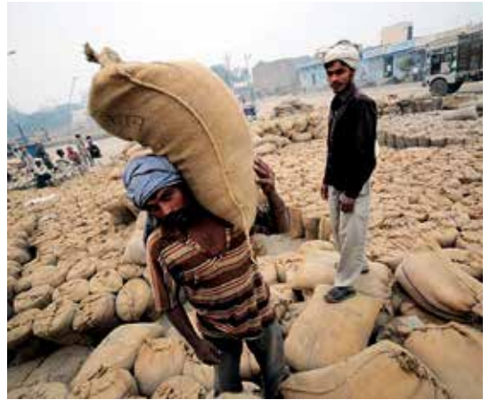
Rice-packing centre in Sangrur, south-east Punjab, India