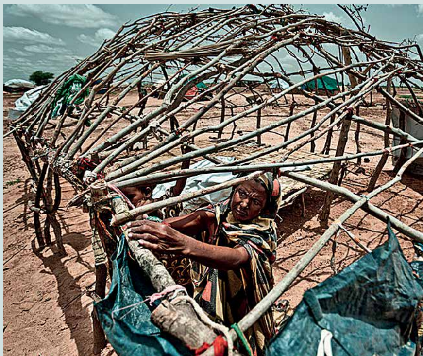
Building shelter at the Mentao Nord camp in Burkina Faso

Our Social Protection programme has launched a Shockwatch work-stream of research and policy advice to donors and governments on how best to respond to the poverty impacts of crisis events. A toolkit has been developed, informed by research visits to Mozambique and Zimbabwe in December 2012: visits that confirmed the scarcity of credible data and highlighted the need for alternative approaches to pinpoint likely risks and responses. The resulting country report on Mozambique has already been used by DFID to guide a risk-mapping exercise in the country, while the Zimbabwe country report provided a useful review of existing social-protection provision for DFID staff.