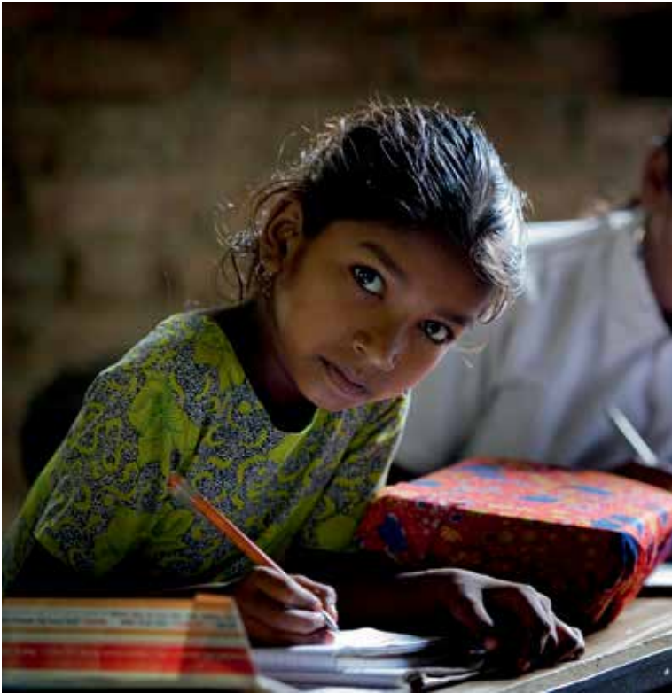
A young girl attends a school near Bhairawaha, Rupandehi District, south-central Nepal