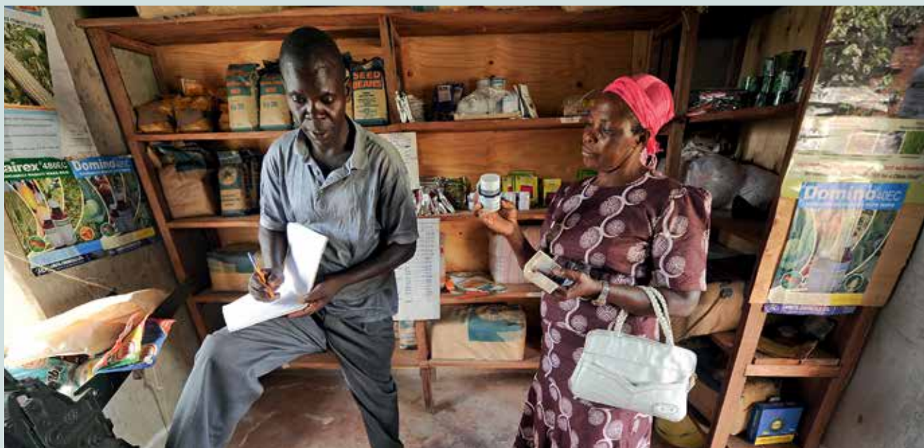
Creating diverse livelihoods in Lower Nyando, Kenya