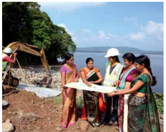
Dam under construction in Sri Lanka