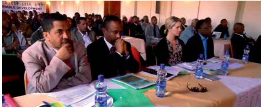
Citizen consultation on green development, Ethiopia

This initiative has helped to build the capacity of those handling grants, provided a model to test theories of change, and generated lessons on key approaches, such as outcome mapping and political-economy analysis. Above all, it has forged cross-sectoral and cross-country communities of practice for the future.