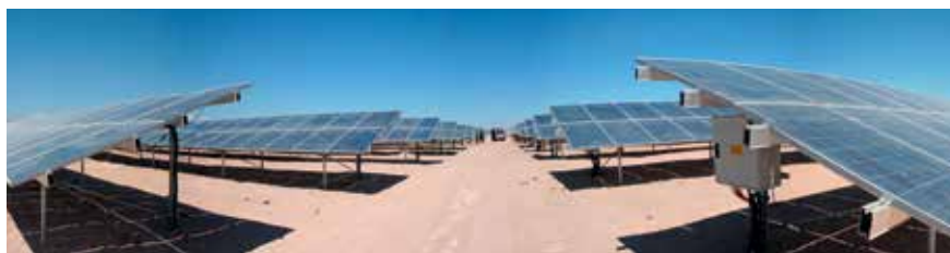
Solar panels in the desert, Chile

delivery of climate finance, through its analysis of national institutions and expenditure, and its work on climate-finance readiness.