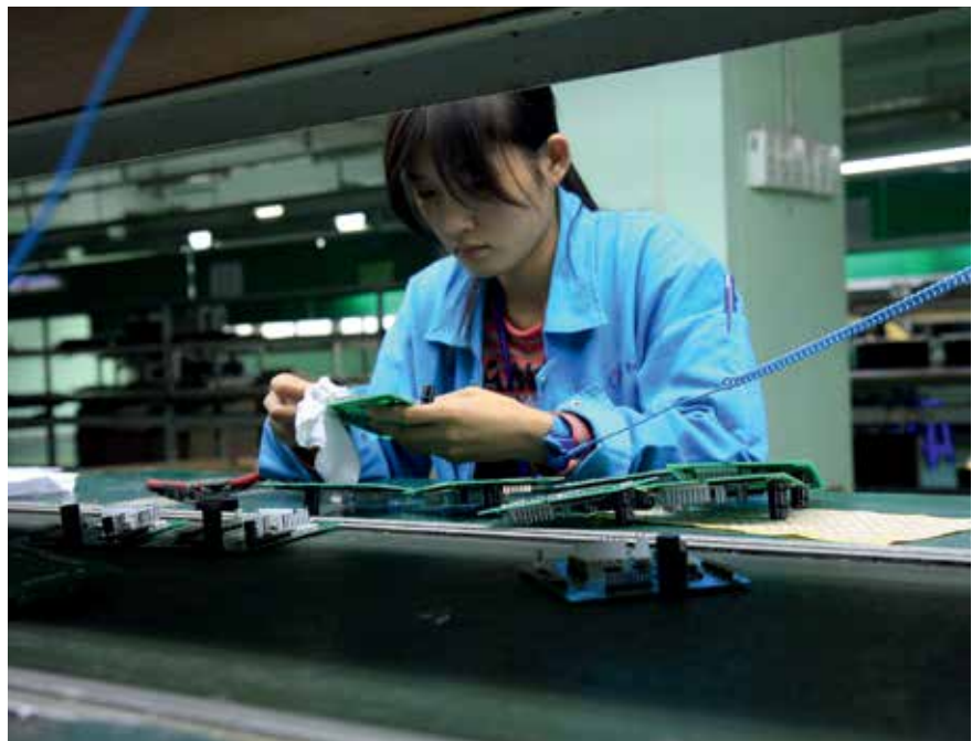
IBE electronics, Shenzhen, southern China

The report, based on an assessment of the MDG experience and analysis of the likely trends for the next 20–30 years, was enriched by case studies on Côte d'Ivoire, Nepal, Peru and Rwanda, as well as a dozen background papers by practitioners and academics. The report reaches four main conclusions: a transformative agenda is vital, national ownership will be critically important, global collective action must be scaled up, and a new framework should be as much about instruments as it is about goals. This independent annual report is funded by the European Commission and seven EU Member States: Finland, France, Germany, Luxembourg, Spain, Sweden and the UK.