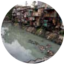
Cover photo Rehabilitating Jakarta's waterways to mitigate flood risk