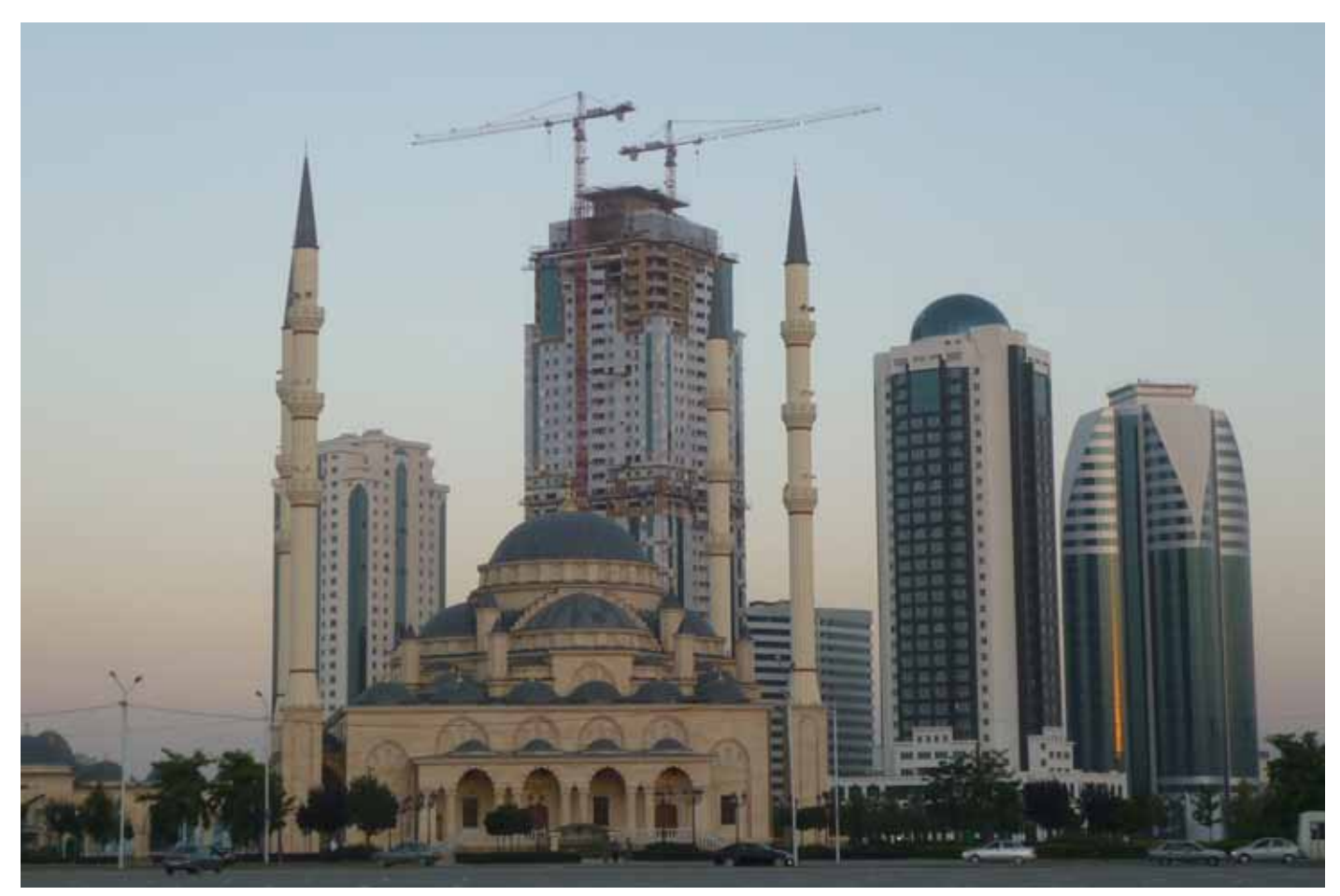
THE "NEW GROZNY" - THE CENTRAL MOSQUE AND A BUILDING UNDER CONSTRUCTION IN "GROZNY CITY."

The path taken by Chechnya is portrayed everywhere in a resolutely optimistic light. There is universal unanimity about the system established by President Kadyrov with the help of Moscow's petrodollars – restoration of relative order and rapid reconstruction of the republic's infrastructure in exchange for complete domination by the ruling faction. Nowhere in the Chechnya-based media could Reporters Without Borders find any trace of the concerns of human rights organizations about the corollaries of this consensus: the total absence of political competition, arbitrary behaviour by the security forces, large-scale corruption, submission to puritan Islam and a personality cult.