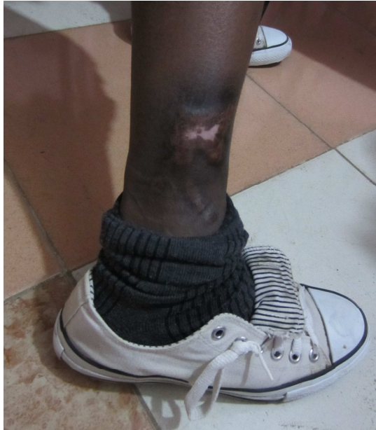
The ankle of a 17-year-old Eritrean boy showing the scars he said came from months of being chained by his captors in Sinai

He was freed once his community paid USD 27,000. Months after his release, there were visible scars on his ankles, compatible with his testimony of being chained for eight months.