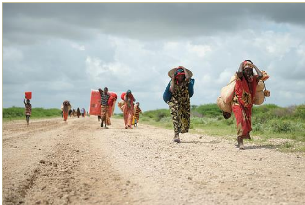
Carrying whatever possessions they can, women arrive in a steady trickle at a camp for IDPs established next to a base of the African Union Mission for Somalia near Jowhar (UN Photo, Tobin Jones, November 12, 2013).

2.3 The Global Protection Cluster should assess how these strategic reflections are going and make the necessary changes to ensure that the clusters are continually dealing with new challenges which come their way. It might be helpful, for example, to have a team of external consultants work with the clusters in developing these plans or to hold the cluster leads individually responsible for ensuring that this strategic review is carried out or to circulate these strategic plans between protection clusters for ‘peer review’ critique.