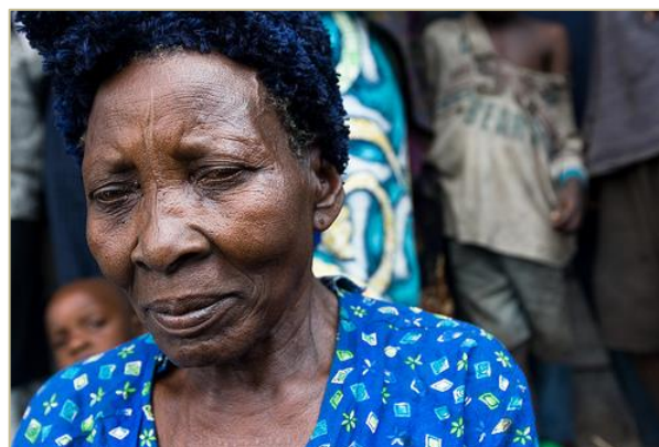
An IDP woman at a camp in North Kivu Province, DRC (UN Photo, Marie Frechon, February 16, 2008).

Although there is now much greater awareness of protection than when Protect or Neglect was published, there are signs that internal displacement is slipping off the international agenda. There is a danger of losing progress made on IDPs over the past two decades. The trend toward mainstreaming, the decreasing visibility of IDPs on the international agenda, the decline in numbers of staff focusing explicitly on IDPs in international organizations such as UNHCR, OCHA, and ICRC and the weakening of the position of Special