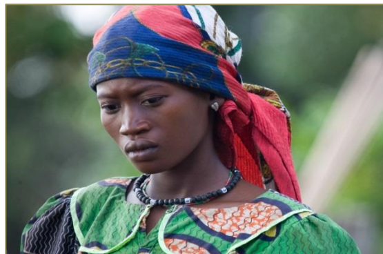
An IDP woman at Bompata Encampment in DRC (UN Photo, Marie Frechon, March 11, 2007).

For over two decades, large numbers of people in DRC have been displaced from their homes, often repeatedly, as a result of persistent conflict. The waves of violence have been so chronic over the years that displacement has touched nearly every inhabitant living in the eastern provinces. Although figures have fluctuated, the number of IDPs has generally hovered around the two million mark for over a decade, with an estimated 2.6 million displaced in 2014 – most of whom do not live in settlements but are dispersed among the local population.