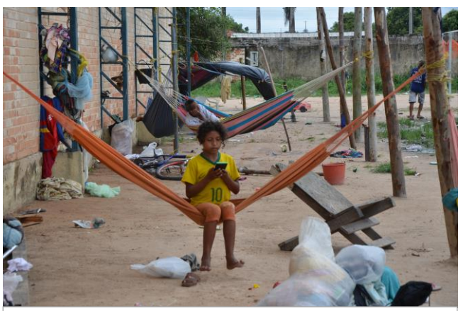
Venezuelans rest outside the shelter in the Boa Vista border city in Roraima state, Brazil. The indigenous Warao prefer sleeping in hammocks, so some have set up their spaces outside the shelter's walls. UNHCR has been working with authorities and partners to establish better living conditions, including access to clean water and medical services.