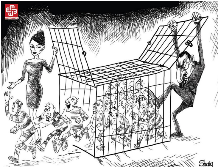
Caricature depicting President Aliyev and his wife's role in the arbitrary arrest and release of political prisoners

The same year, Azerbaijan was found to be the worst place for LGBTI people to live in Europe in 2016 by the European Region of the International Lesbian, Gay, Bisexual, Trans and Intersex Association (ILGA).