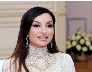
President Ilham Aliyev and his wife Mehriban Aliyeva.