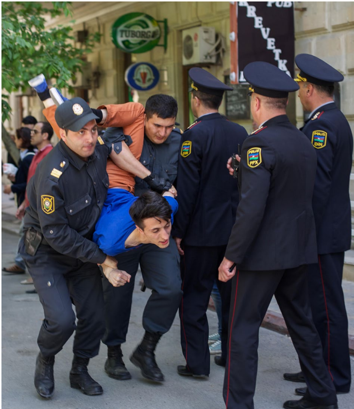
Youth Protestors are arrested in Baku, 2014

The authorities have also employed non-legislative means to intimidate and harass civil society, including through public smear campaigns in state-owned media (NGO staff and leaders are frequently labelled as traitors in popular press); intrusive stop and search processes against activists when entering or leaving the country; and applying pressure on private businesses not to provide services to civil society.