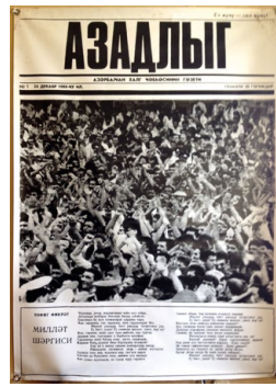
Front Page of Azadliq, 24/12/1989