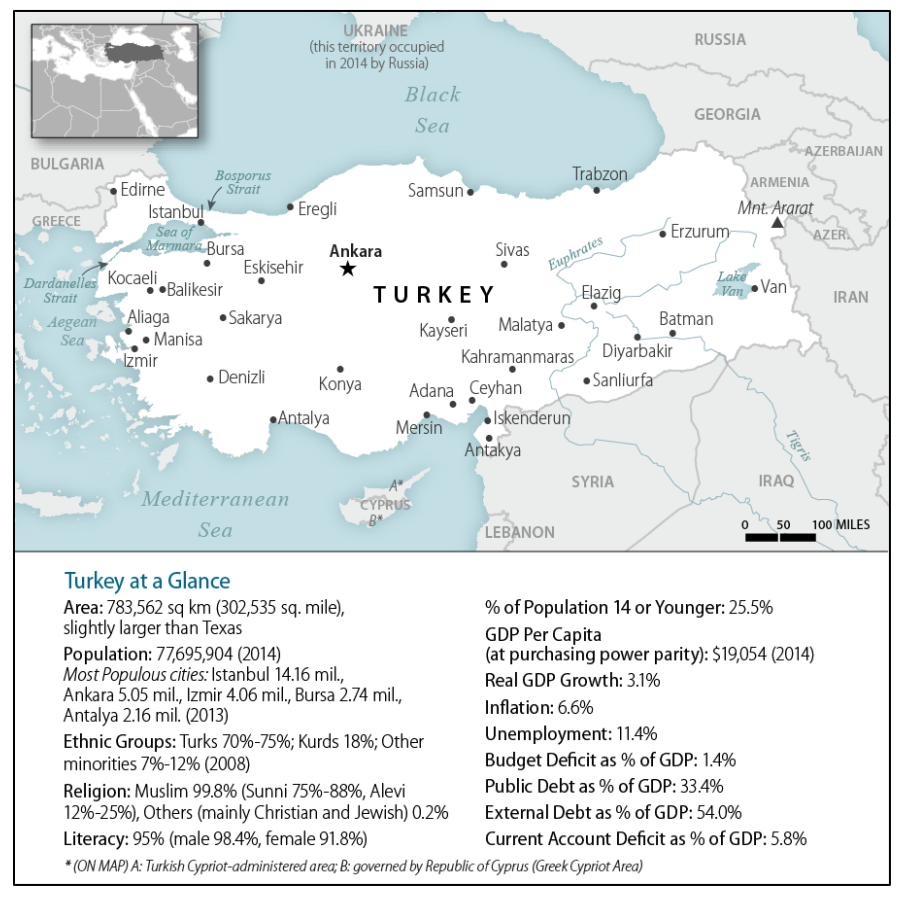
Figure 1. Turkey: Map and Basic Facts