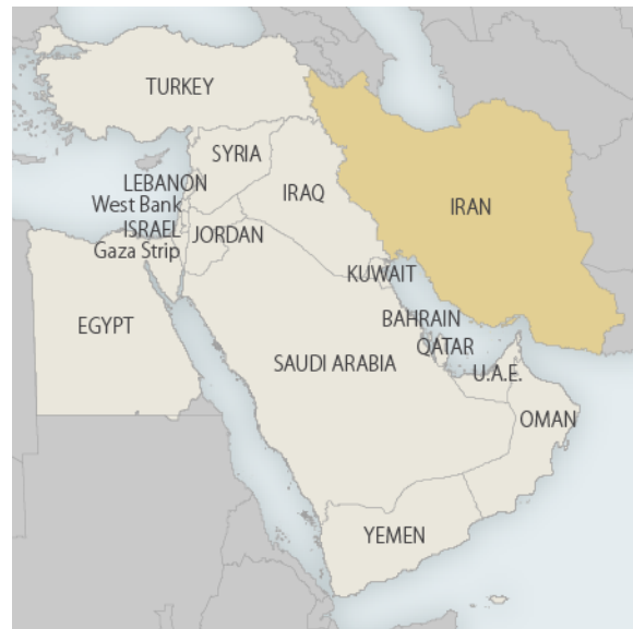
Figure 1. Map of Near East

The following sections analyze the main outlines of Iran's policy toward each GCC state. There are distinct differences within the GCC on Iran policy, as discussed below.