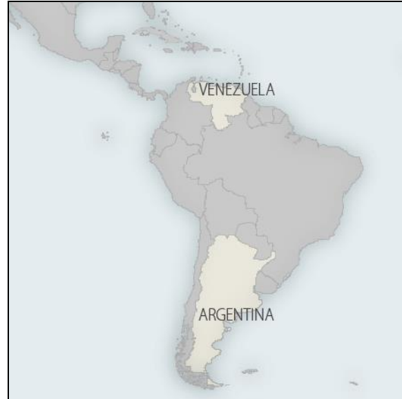
Figure 4. Latin America

Some U.S. officials and some in Congress have expressed concerns about Iran's relations with leaders in Latin America that share Iran's distrust of the United States. Some experts and U.S. officials have asserted that Iran has sought to position IRGC-QF operatives and Hezbollah members in Latin America to potentially carry out terrorist attacks against Israeli targets in the region or even in the United States itself. 142 Some U.S. officials have asserted that Iran and Hezbollah's activities in Latin America include money laundering and trafficking in drugs and counterfeit goods. 143 These concerns were heightened during the presidency of Mahmoud Ahmadinejad (2005-2013), who made repeated, high-profile visits to the region in an effort to circumvent U.S. sanctions and gain support for his criticisms of U.S. policies. However, few of the economic agreements that Ahmadinejad announced with Latin American countries were implemented, by all accounts.