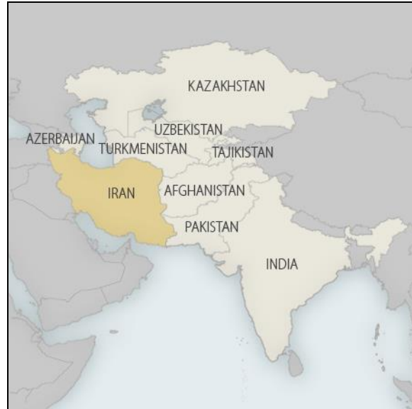
Figure 3. South and Central Asia Region

Most of the Central Asia states that were part of the Soviet Union are governed by authoritarian leaders and Iran has little opportunity to exert influence by supporting opposition factions. Afghanistan, on the other hand, remains politically weak and divided and Iran is able to exert influence there. Some countries in the region, particularly India, apparently seek greater integration with the United States and other world powers and, until the implementation of the JCPOA in January 2016, limited or downplayed cooperation with Iran. The following sections cover those countries in the Caucasus and South and Central Asia that have significant economic and political relationships with Iran.