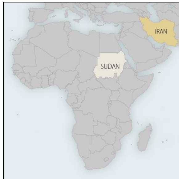
Figure 5. Sudan

The overwhelming majority of Muslims in Africa are Sunni, and Muslim-inhabited African countries have tended to be responsive to financial and diplomatic overtures from Iran's rival, Saudi Arabia. Amid the Saudi-Iran dispute in January 2016 over the Nimr execution, several African countries broke relations with Iran outright, including Djibouti, Comoros, and Somalia,